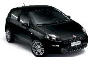
876 CROSSOVER BLACK (metallic)