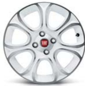
50902779 16" white alloy wheels with diamond finish (Lineaccessori)