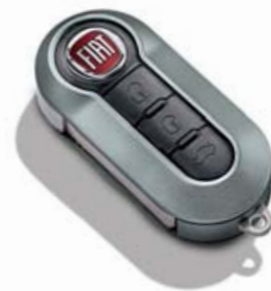
Matt titanium grey