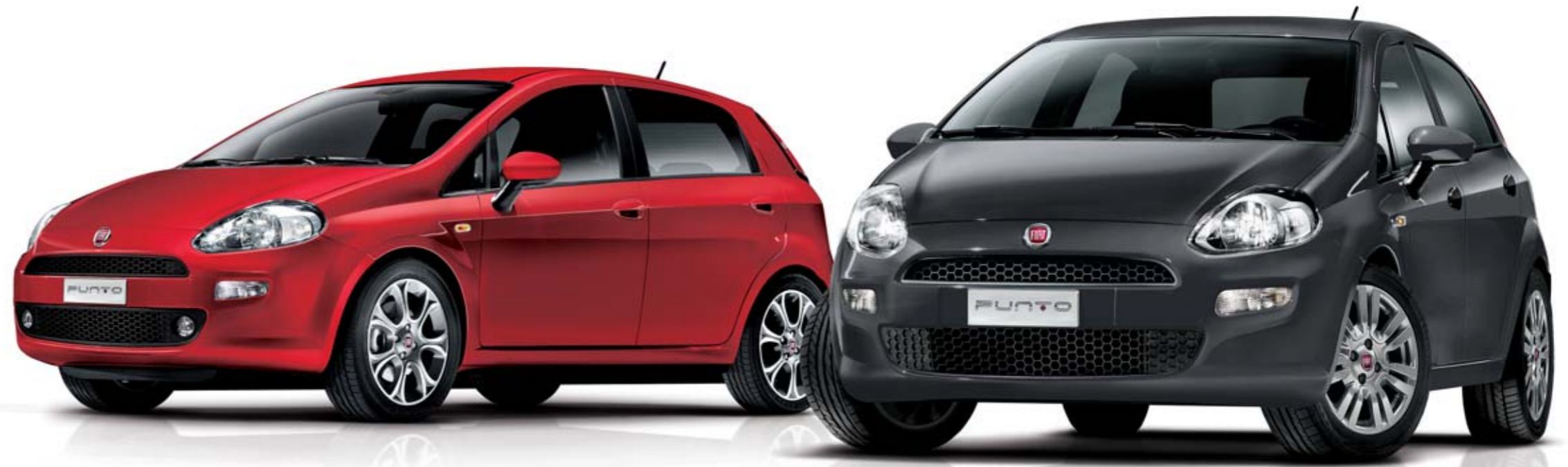
The Punto Pop+ and the Punto Easy+ for those who don't want to forgo style, functionality and elegance.