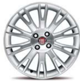
50901339 17" alloy wheels (Lineaccessori)