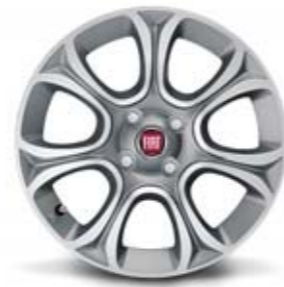
439 16" 7 Spoke 2-tone Sportline Alloy Wheels