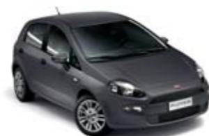
679 UNDERGROUND GREY (metallic)