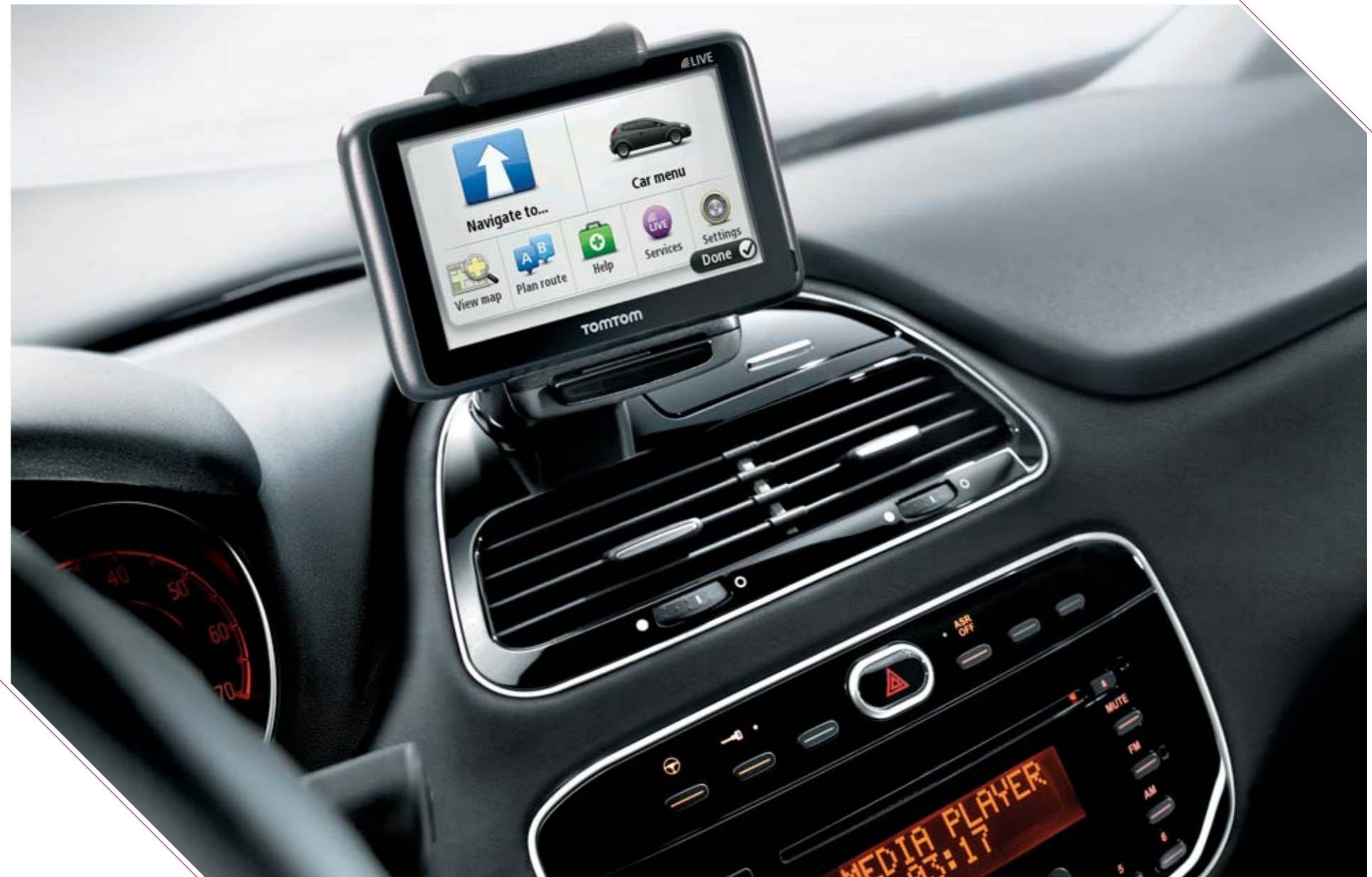
TomTom LIVE system