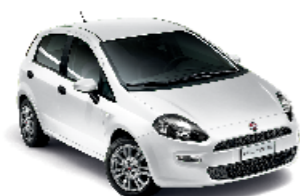
296 AMBIENT WHITE (pastel)

Switch off boredom, start living in full colour. It's easy with the host of different colours available for the Punto range: choose the one that suits your personality.