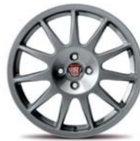
50902243 17" burnished alloy wheels (Lineaccessori)