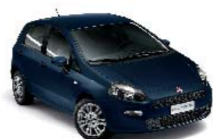
475 ROCK 'N' ROLL BLUE (pastel)