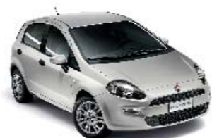
348 LYRICAL GREY (metallic)