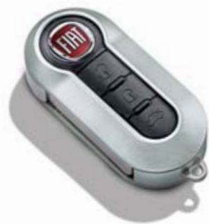
Matt silver grey