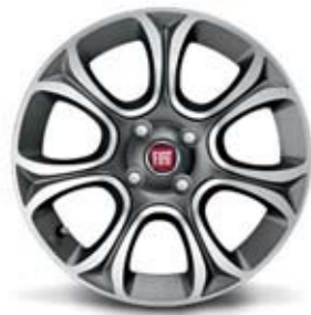
50902778 16" burnished alloy wheels with diamond finish (Lineaccessori)