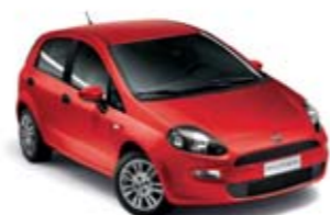
176 EXOTICA RED (non-standard pastel)