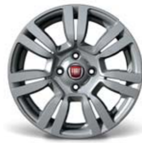
108 15" Comfortline Alloy Wheels