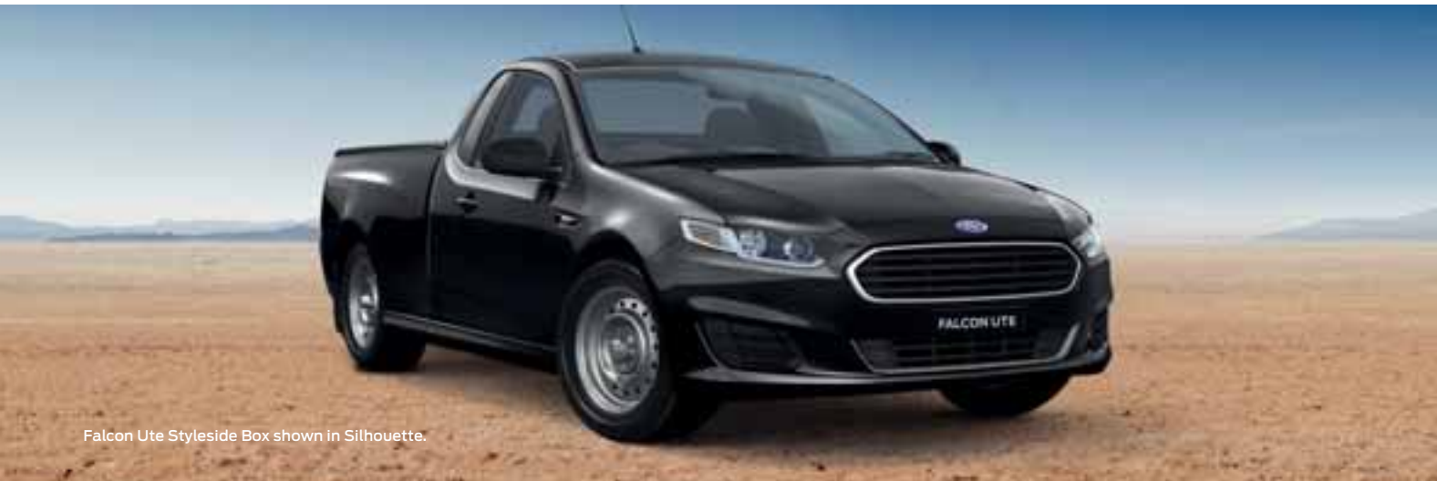
Falcon Ute Styleside Box shown in Silhouette.