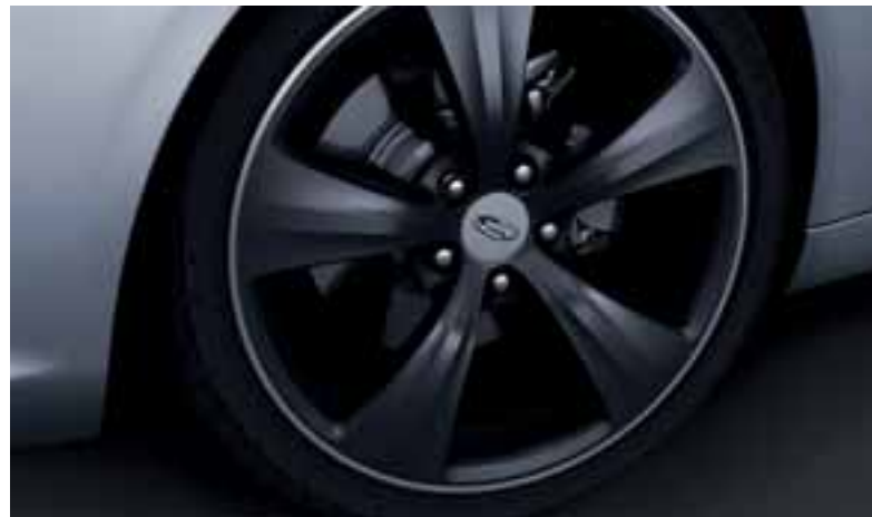
FPV wheel. These distinctive FPV alloy wheels are purpose-designed to complement the Ford Falcon's dynamic lines.