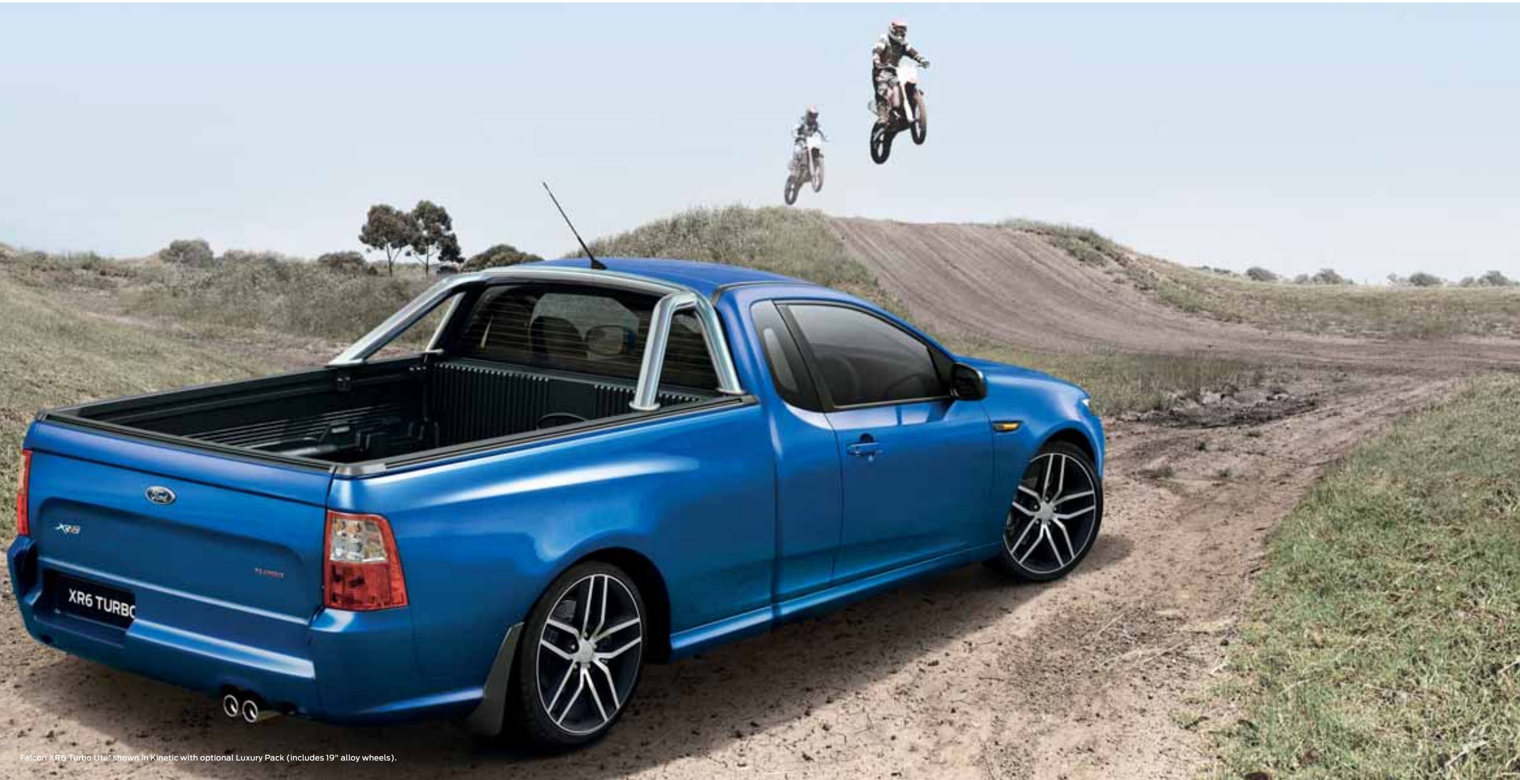
Falcon XR6 Turbo Ute* shown in Kinetic with optional Luxury Pack (includes 19" alloy wheels).

When the work day is over, the Falcon Ute comes into its own. Nothing proves it more than the Falcon XR Ute. Slick design, low stance and full body styling kit meets an 8" colour touch screen, car-like comfort and superb driving performance. Inside and out, it takes fun seriously.