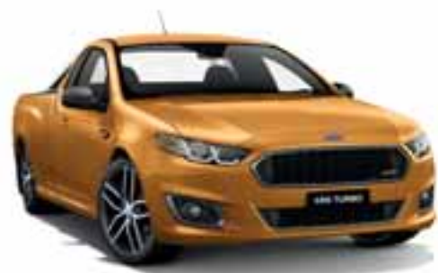
Victory Gold ^^