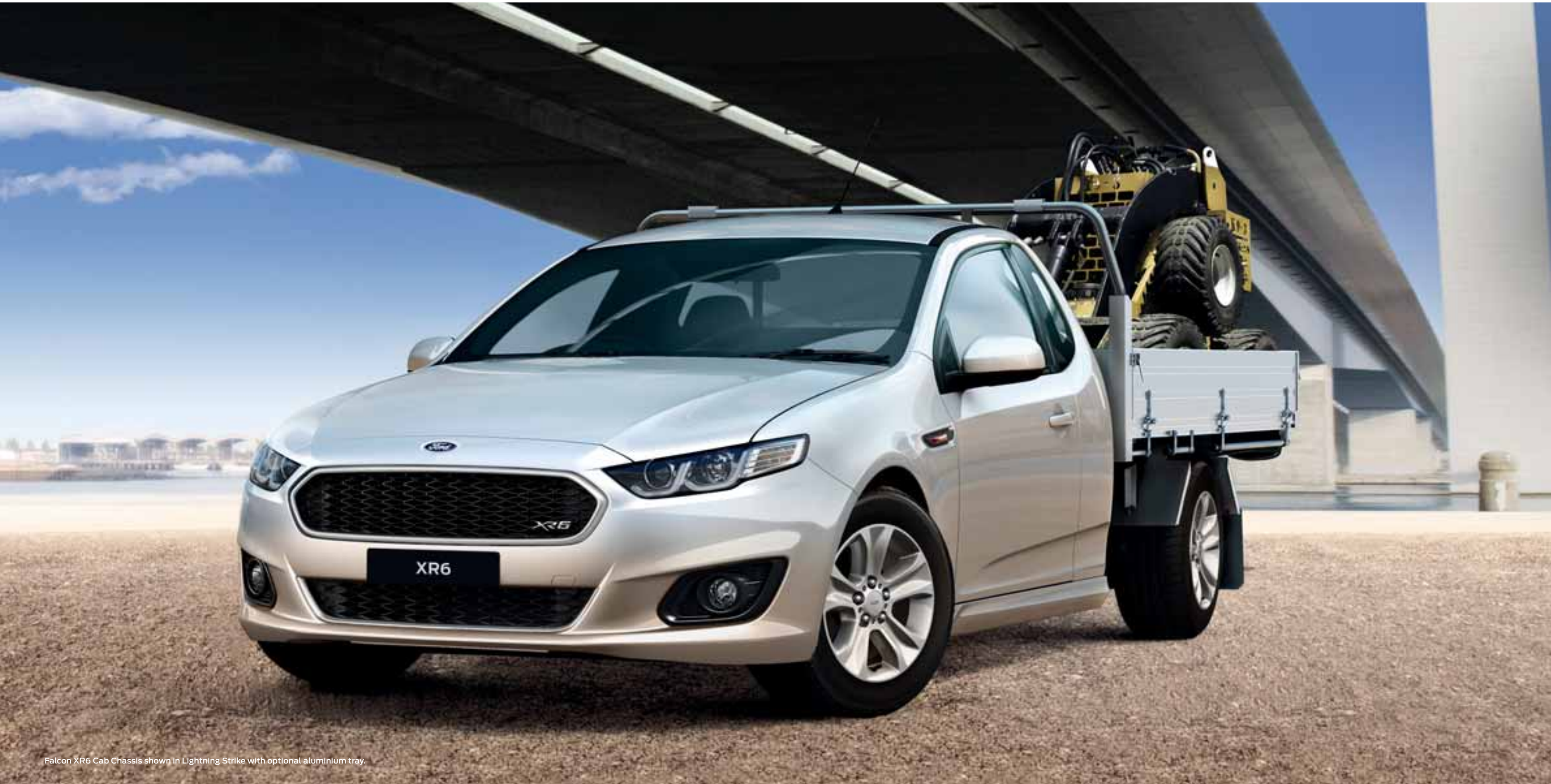
Falcon XR6 Cab Chassis shown in Lightning Strike with optional aluminium tray.

Get the job done with the Falcon Ute. Tough, powerful and always ready for work. 5