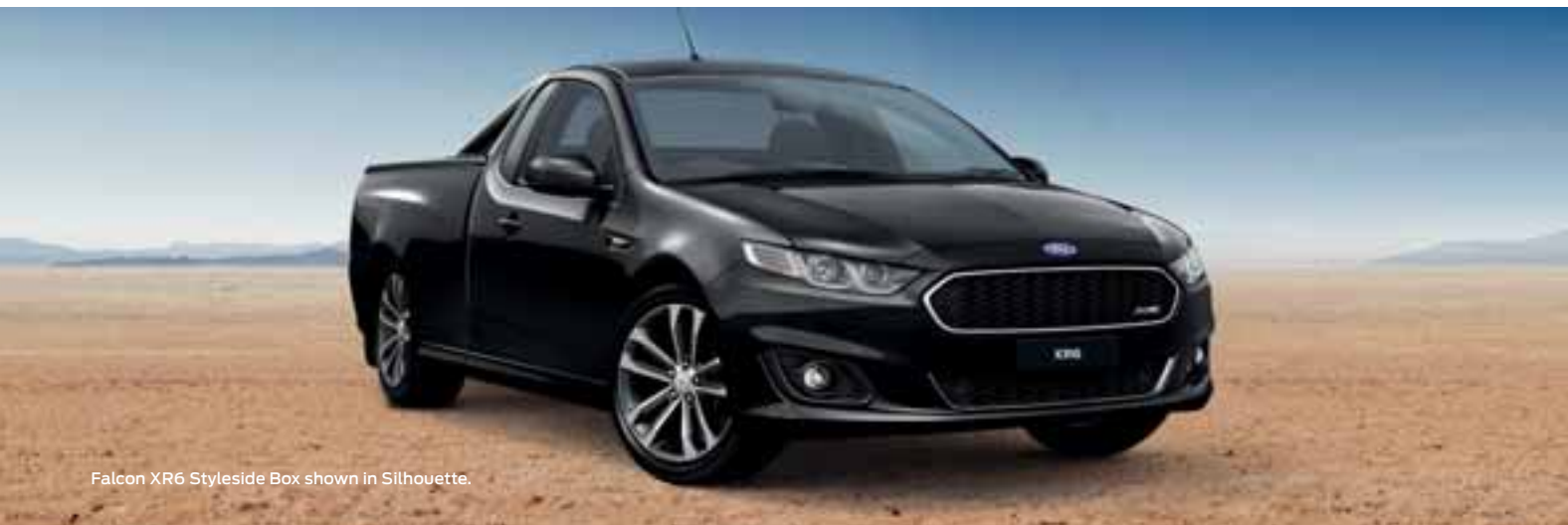
Falcon XR6 Styleside Box shown in Silhouette.