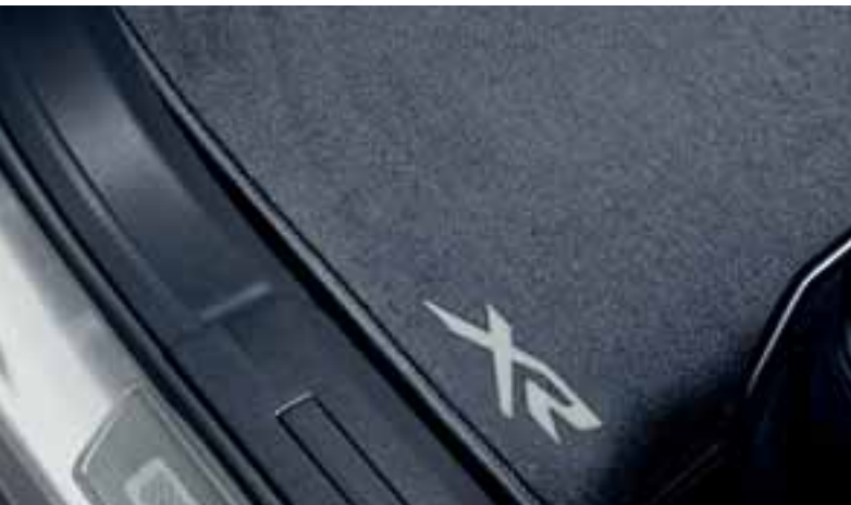
Carpet mats. ‡ Protect your passenger seating wells from dirt, mud and outdoor muck with a set of three smartly designed mats.

Get exactly what you want from your Falcon Ute, by picking the perfect features and accessories to tailor it to your needs and requirements.