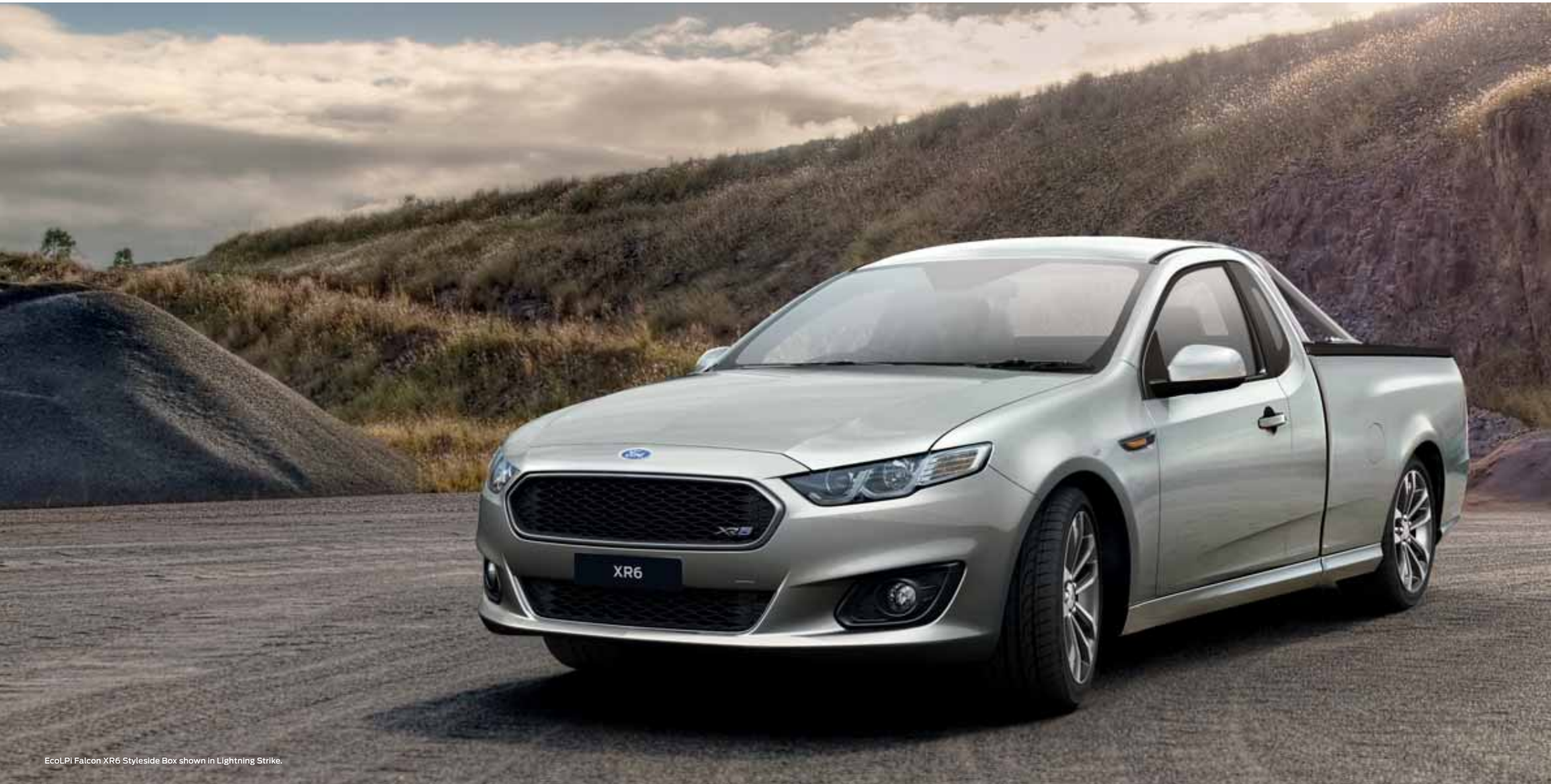
EcoLPi Falcon XR6 Styleside Box shown in Lightning Strike.

Enjoy outstanding power and torque while taking advantage of the fuel cost benefits of LPG. 15