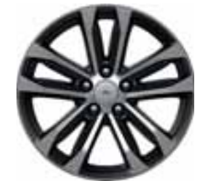
XR6 (standard) 18" x 8.0" alloy

Seat insert: Radium in Ebony Seat bolster: Relay in Ebony