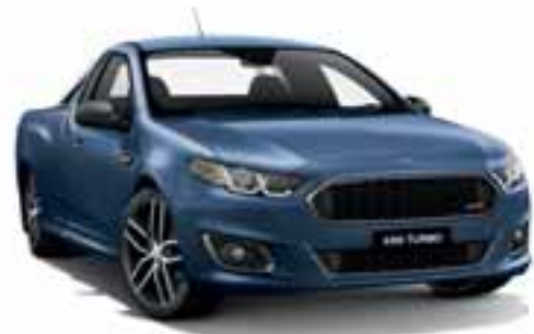
Aero Blue ^