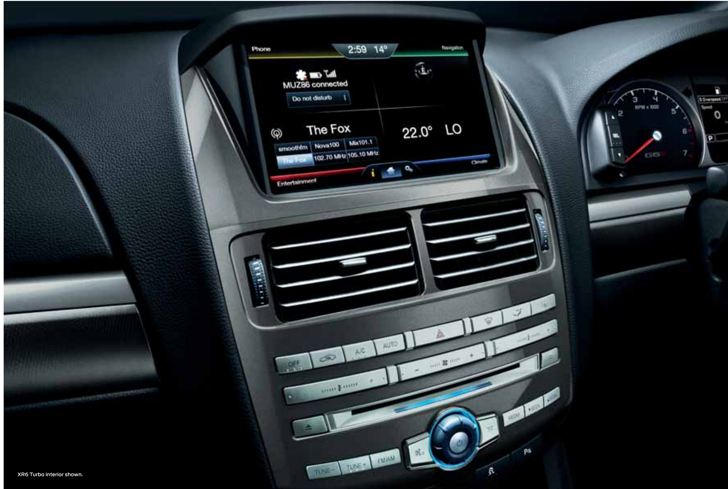
XR6 Turbo interior shown.

Hands-free voice control lets you concentrate on the road while making phone calls. SYNC® 2 can connect with your mobile phone and let you seamlessly transfer calls between your car's audio system and phone. You can call your friends and family by name, and never miss a moment.