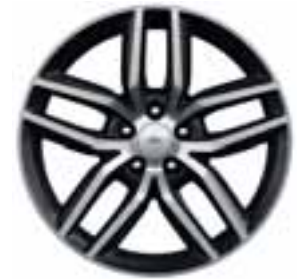
XR6 Turbo 19" x 8.0" alloy

Seat insert: Metro in Shadow Seat bolster: Jacob in Shadow