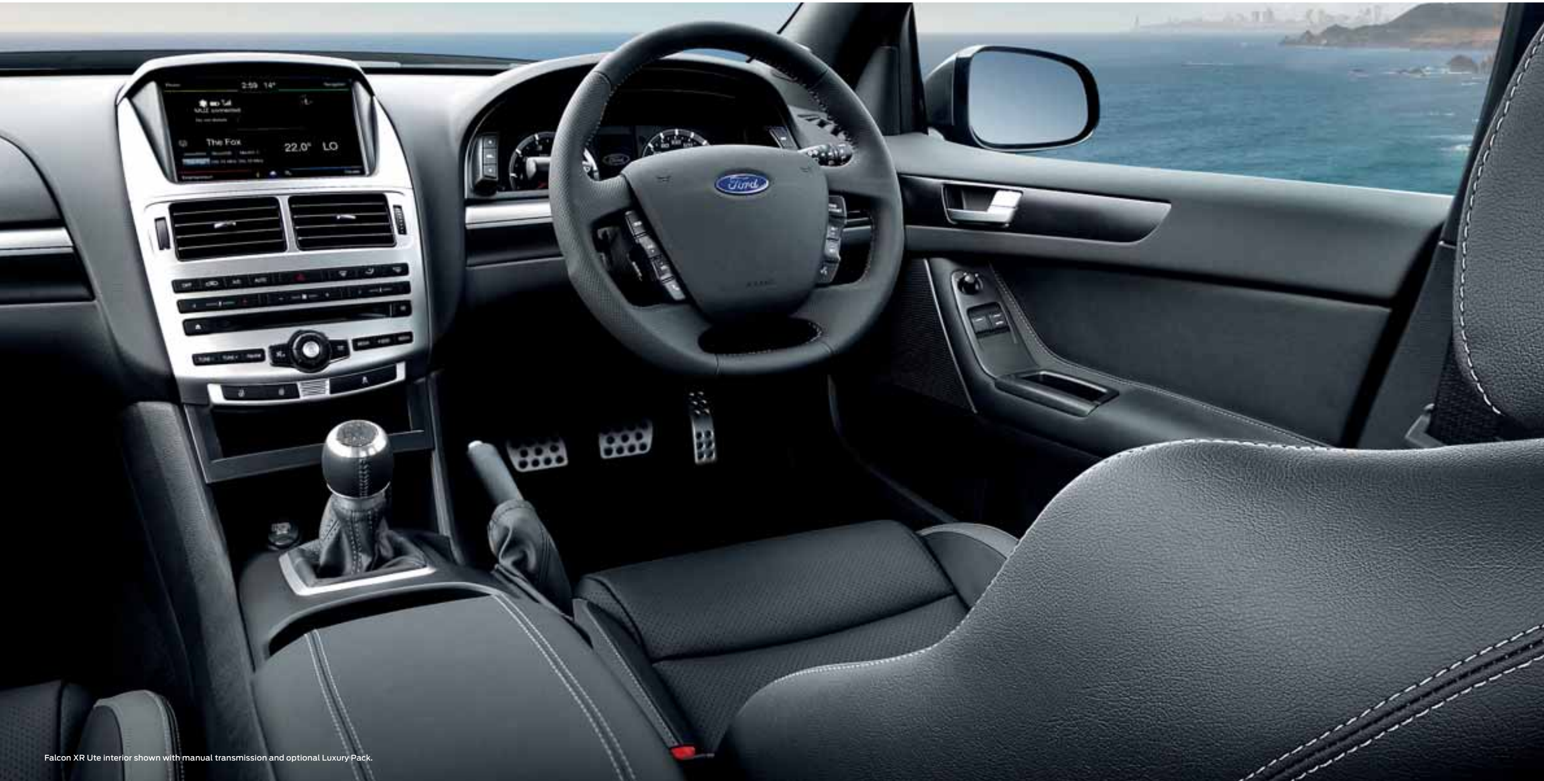
Falcon XR Ute interior shown with manual transmission and optional Luxury Pack.

The perfect antidote to a long day on the job, the Falcon Ute's interior is smart, stylish and comfortable. 9