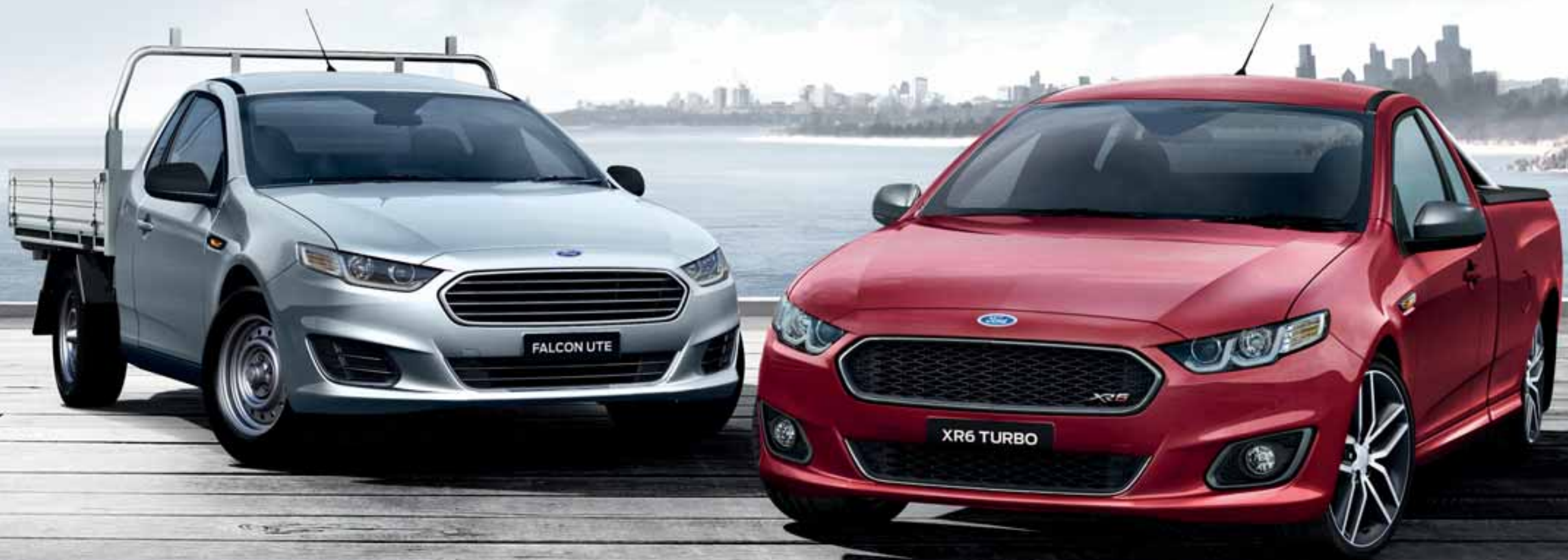
Falcon Ute Cab Chassis shown in Lightning Strike with optional aluminium tray. Falcon XR6 Turbo Ute shown in Emperor with optional Luxury Pack (includes 19" alloy wheels).

Work hard or play hard, with a Falcon Ute range that's bursting with power, performance and style. 19