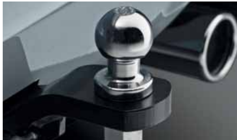
Towpack. Choose the standard towpack for a carrying capacity of up to 1,600kg, or the heavy duty towpack (including load levelling kit) for towing up to 2,300kg.*