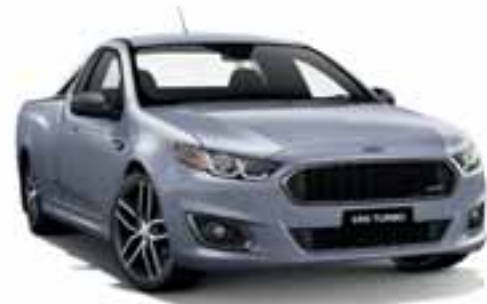
Lightning Strike ^