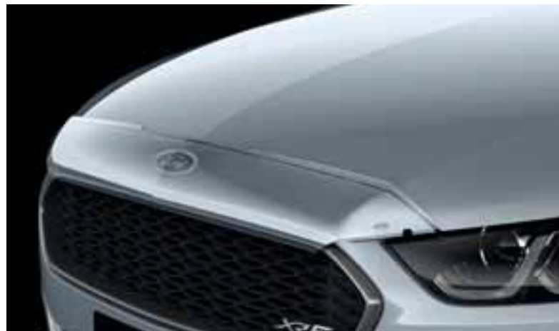
Bonnet Protector. Protect your bonnet from stones and other objects with this UV resistant acrylic bonnet protector.