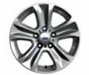
XR6 Cab Chassis 16" x 7.0" alloy

Seat insert: Natural Perforated Leather in Shadow Seat bolster: Nudo Print Leather in Shadow