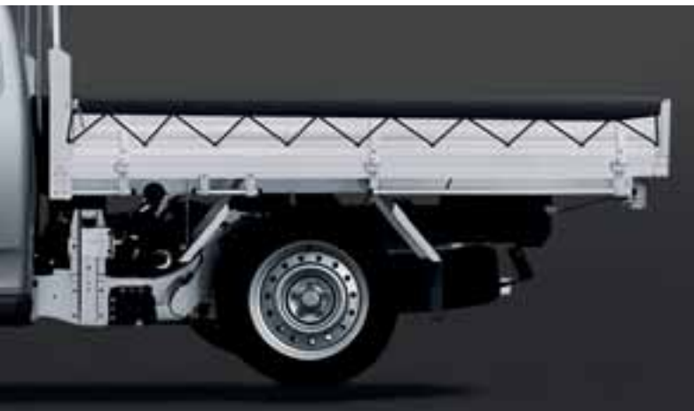
Soft tonneau cover. Helps protect equipment and valuables from rain and dust. Features elasticised bungee looping.