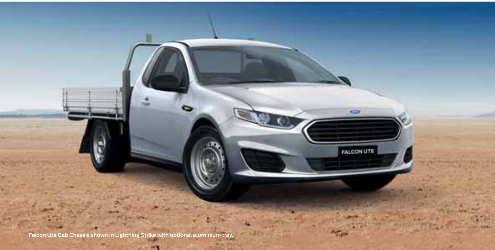
Falcon Ute Cab Chassis shown in Lightning Strike with optional aluminium tray.