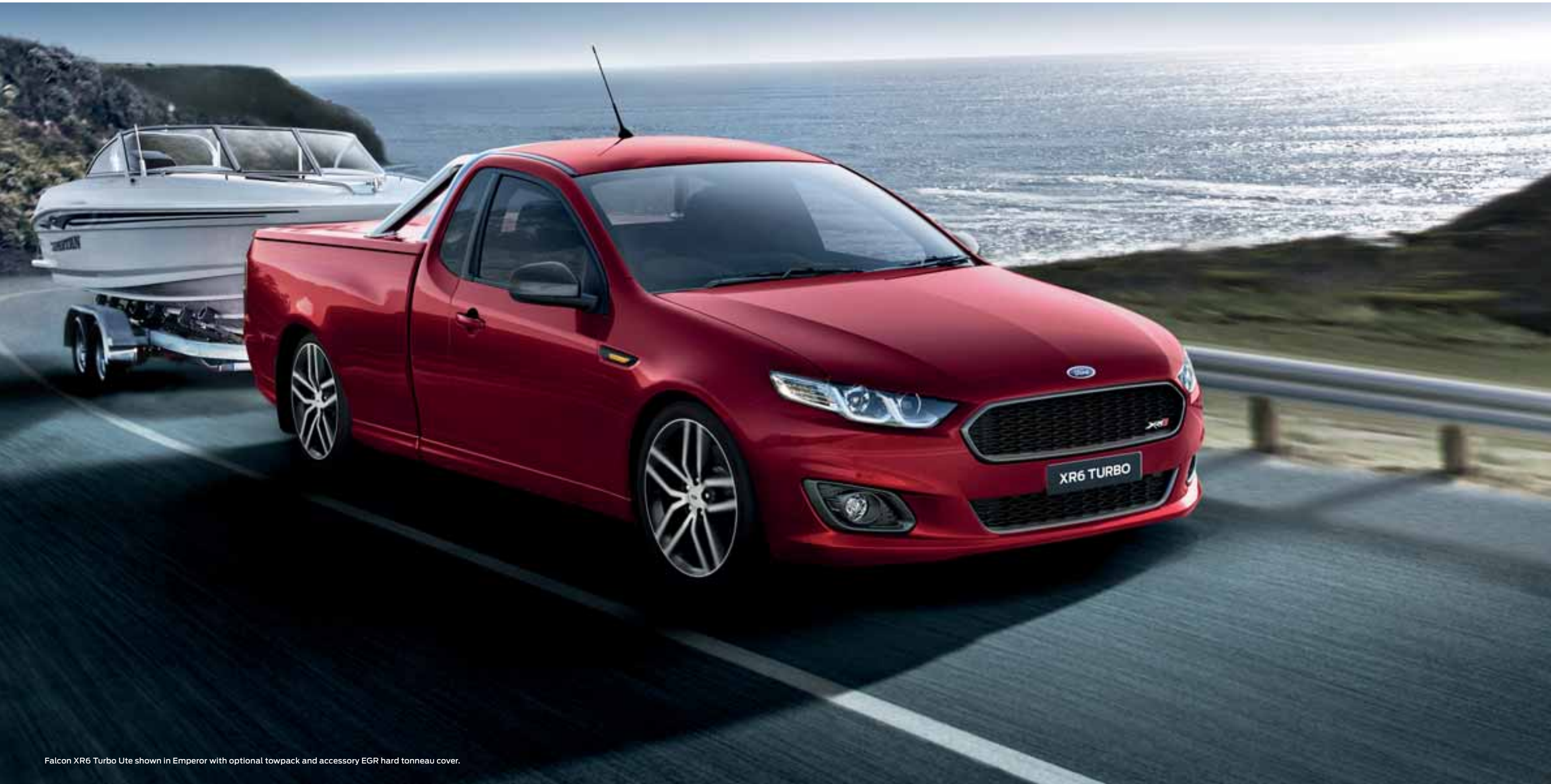
Falcon XR6 Turbo Ute shown in Emperor with optional towpack and accessory EGR hard tonneau cover.

A range of powerful engines and responsive transmissions, offer a smooth, car-like driving experience.