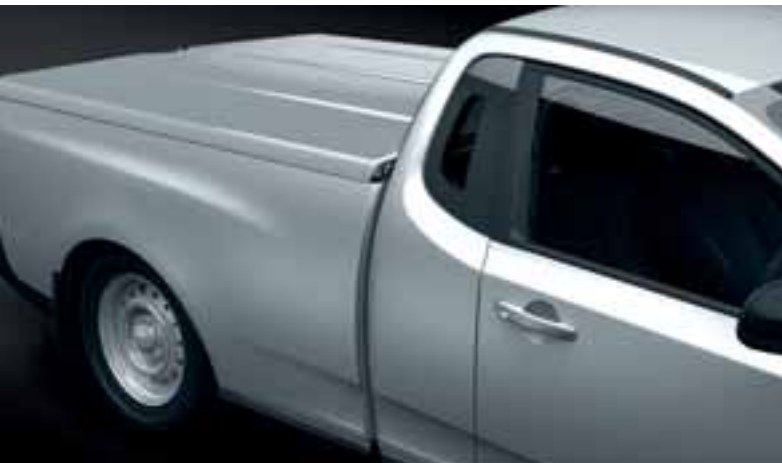
EGR hard tonneau cover. Lightweight and impact resistant, this cover helps keep your equipment secure and protected from rain and dust.