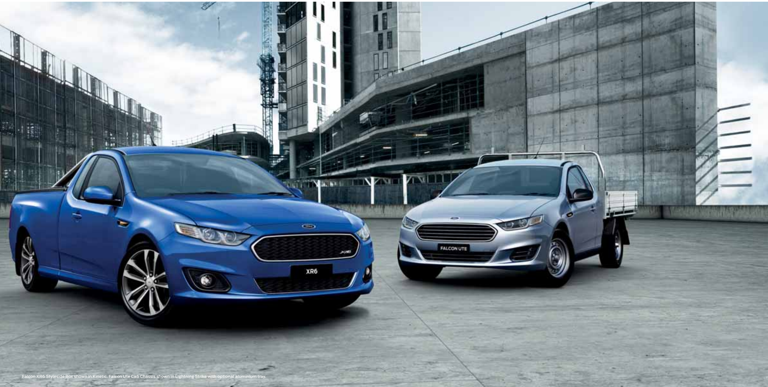
Falcon XR6 Styleside Box shown in Kinetic. Falcon Ute Cab Chassis shown in Lightning Strike with optional aluminium tray.

Built for heavy payloads and with serious towing power, the Falcon Ute means business.