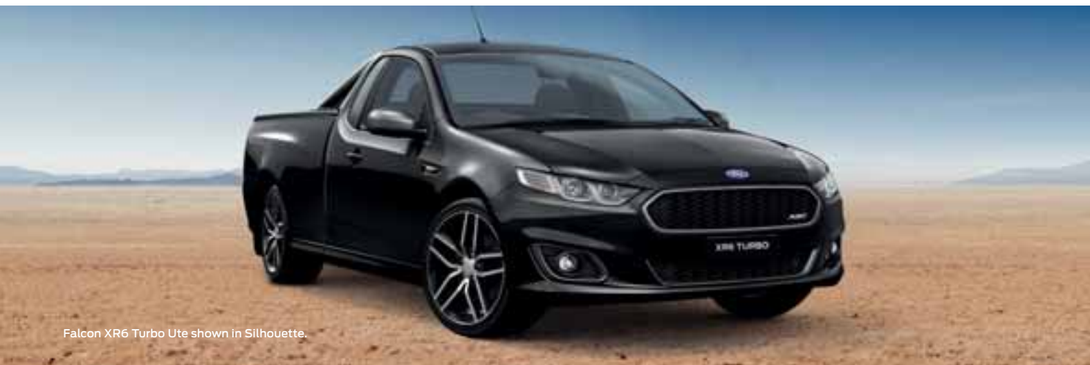
Falcon XR6 Turbo Ute shown in Silhouette.

The Falcon Ute Styleside Box is just as at home on the town as it is on the worksite. With a tough, fully integrated bedliner, it protects your work equipment from daily wear and tear. With sporty, sleek lines and commanding road presence, there's simply no mistaking the Falcon XR Ute.