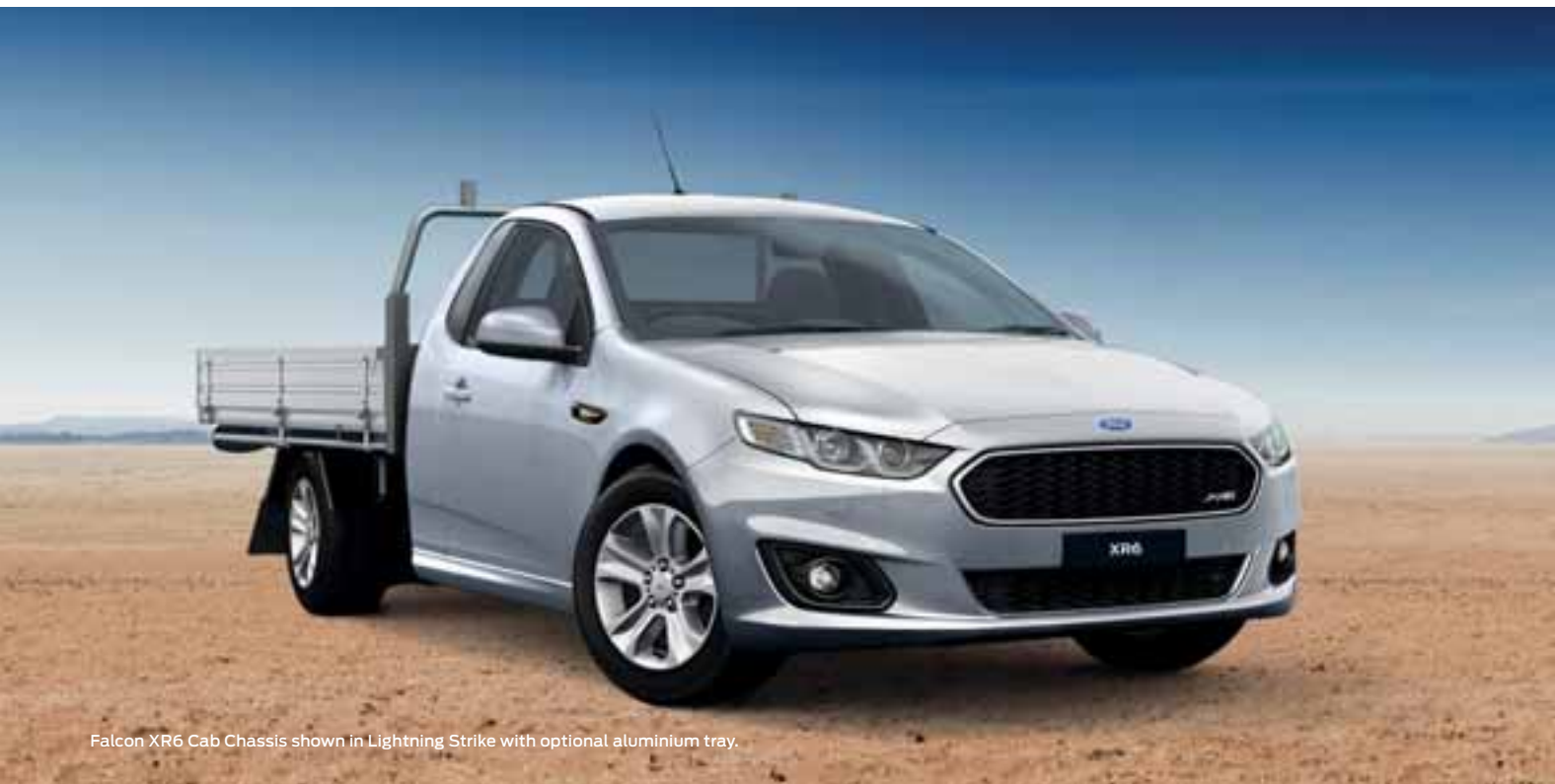
Falcon XR6 Cab Chassis shown in Lightning Strike with optional aluminium tray.