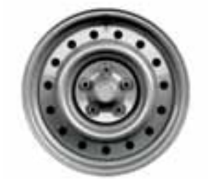
Falcon Ute 16" x 6.5" steel