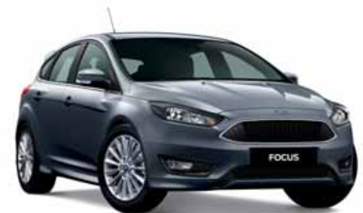
Focus Sport shown in Magnetic! 1