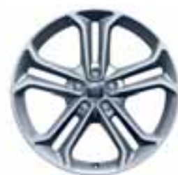
19" 5x2 spoke alloy wheel (ST only)