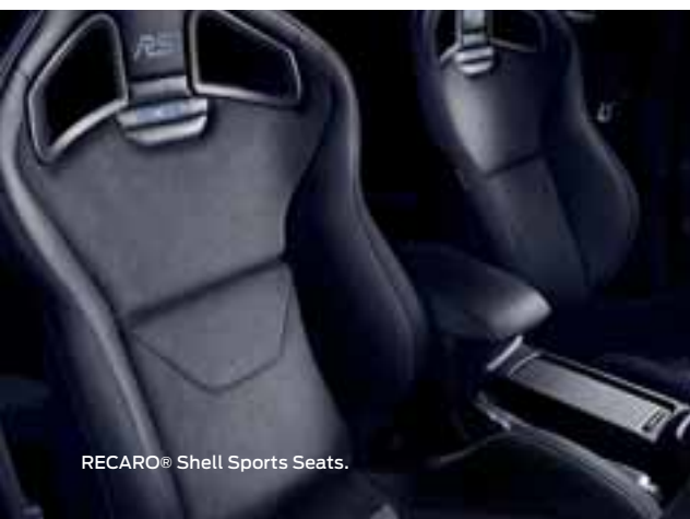
RECARO® Shell Sports Seats.