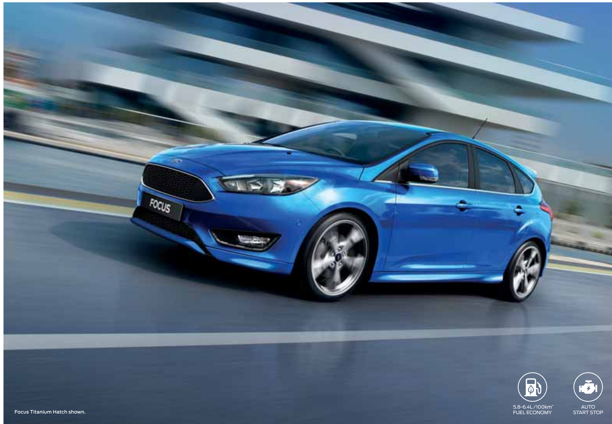
Focus Titanium Hatch shown.

Saves you money. When your Focus is at a standstill, Auto Start-Stop* automatically shuts down the engine, to reduce fuel use. Release the brake and the engine restarts.