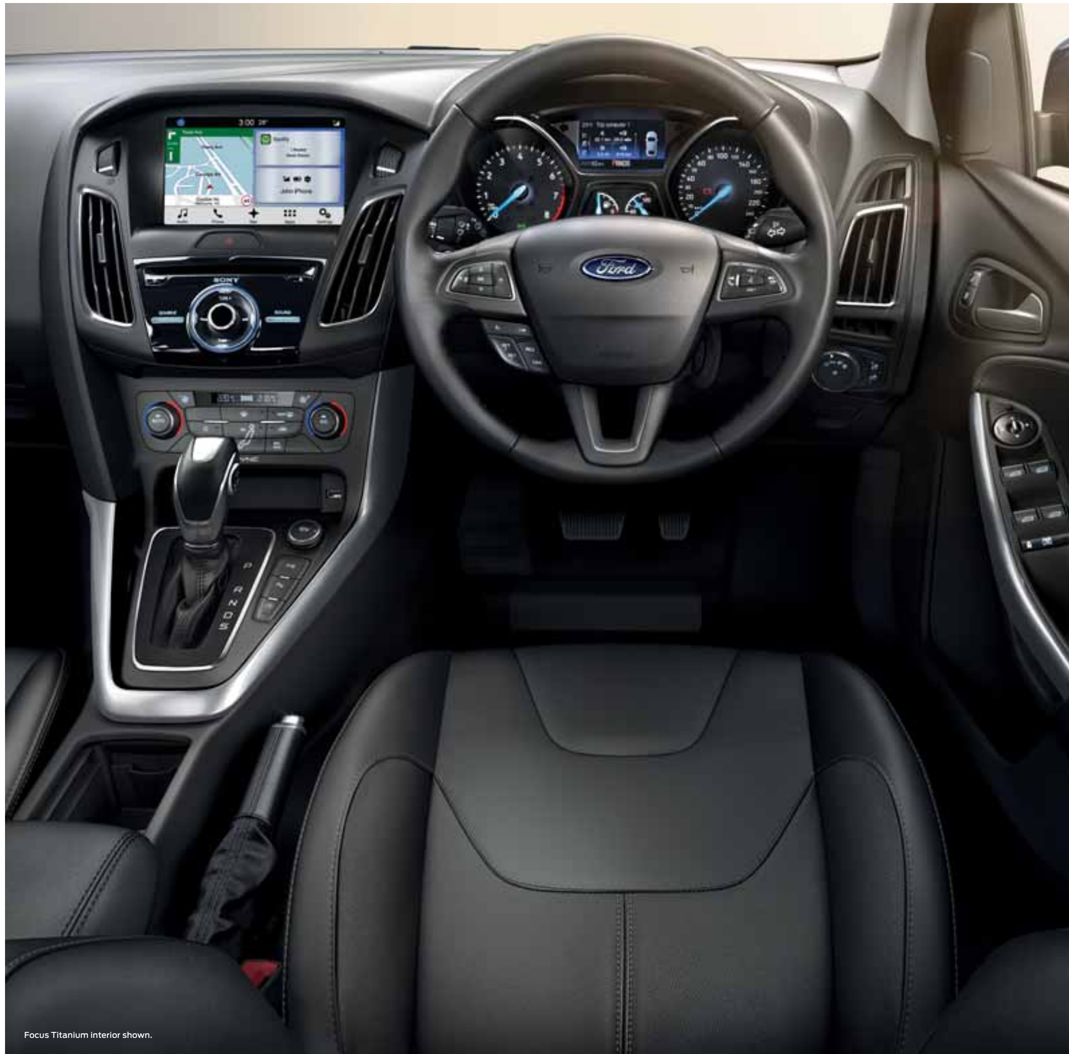
Focus Titanium interior shown.