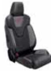
Trim colour: Smoke Storm