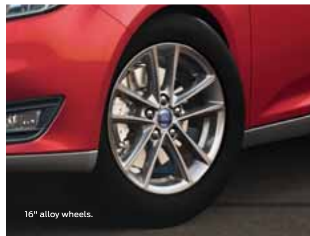
16" alloy wheels.