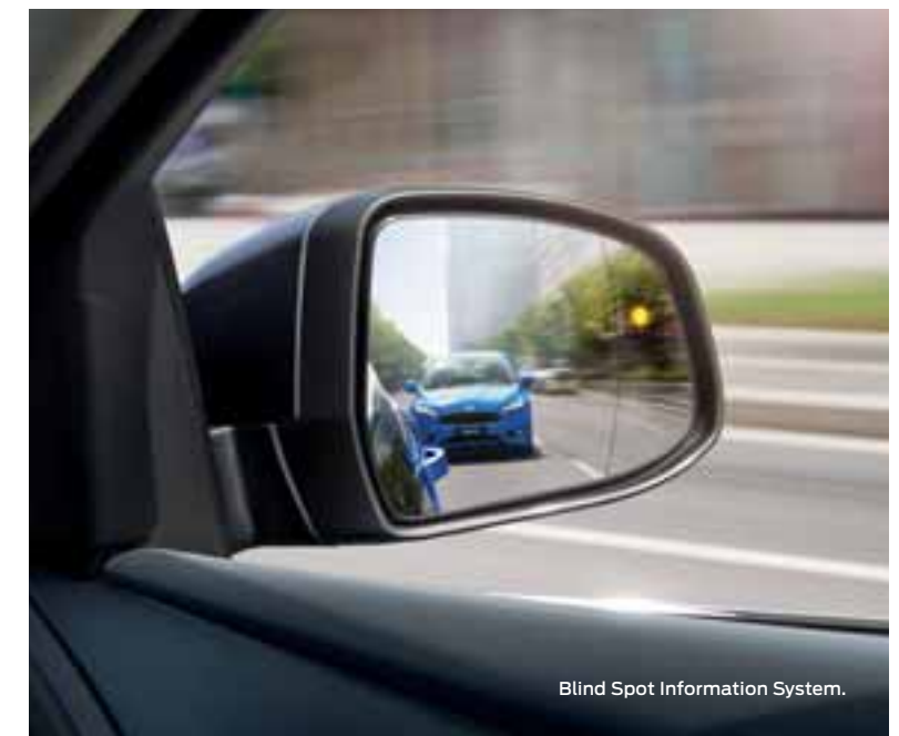
Blind Spot Information System.