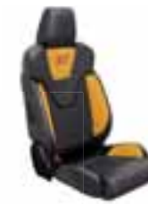
Trim colour: Tangerine Scream