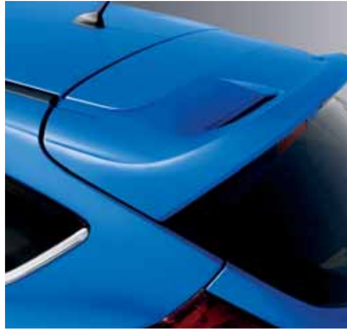
Hatch rear spoiler – large. This accessory gives an aerodynamic finish to the roof line.