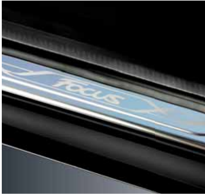
Scuff plates. Elegant polished stainless steel scuff plates, with etched 'Focus' script.