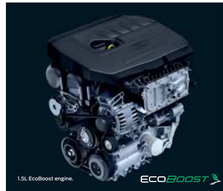
1.5L EcoBoost engine.