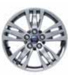
16" 5x3 spoke alloy wheel