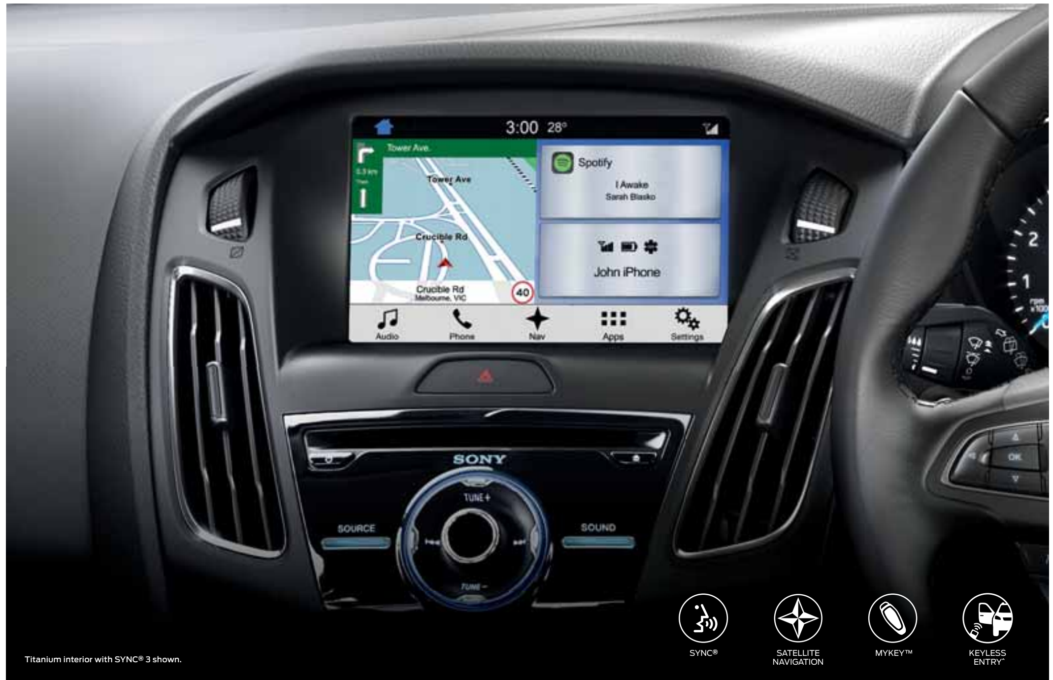
Titanium interior with SYNC® 3 shown.