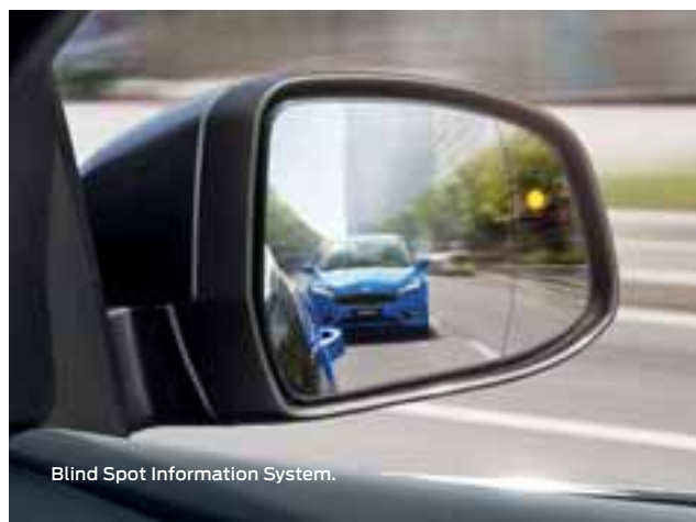
Blind Spot Information System.