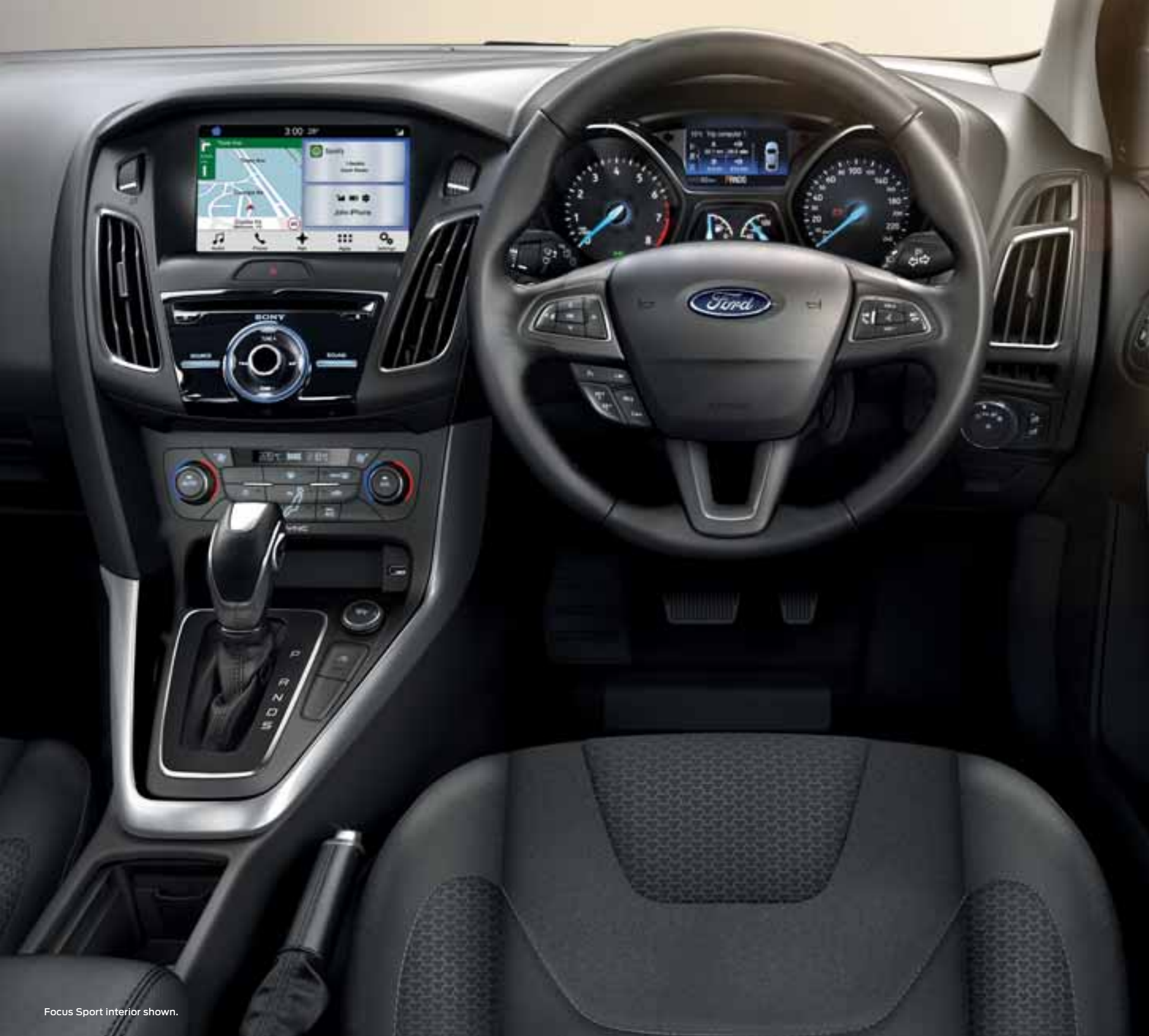
Focus Sport interior shown.