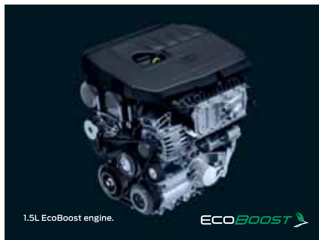
1.5L EcoBoost engine.