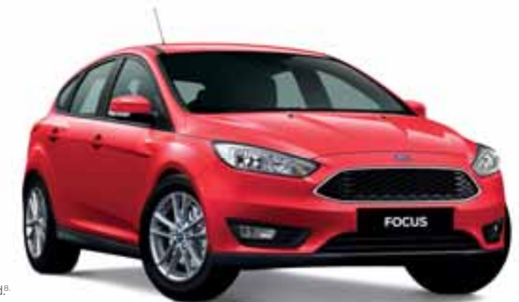
Focus Trend Hatch shown in Candy Red 8 .