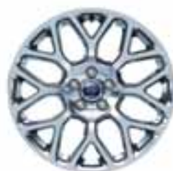
18" 8x2 spoke alloy wheel