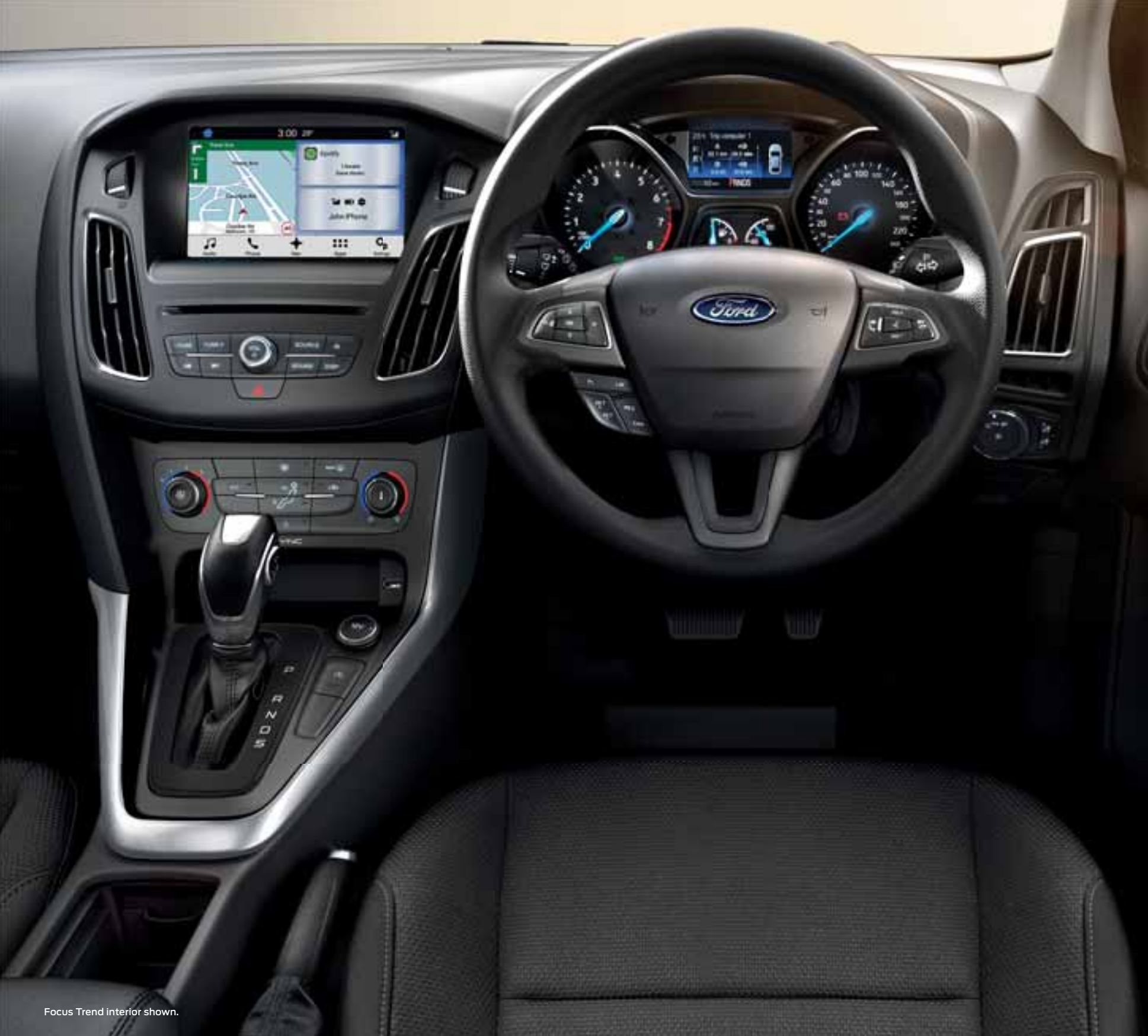
Focus Trend interior shown.