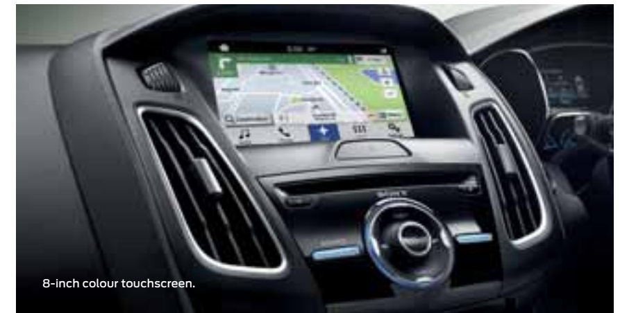
8-inch colour touchscreen.