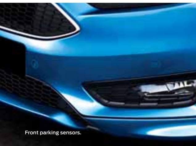
Front parking sensors.