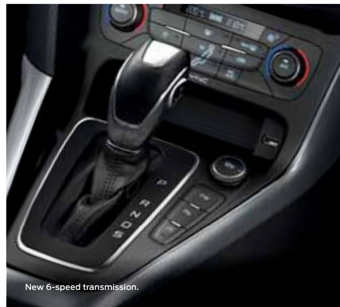
New 6-speed transmission.