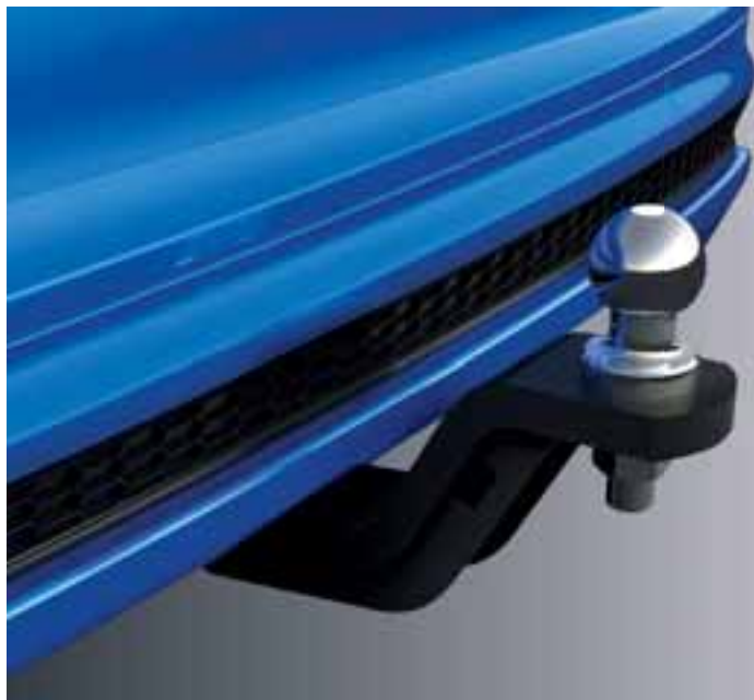
Tow pack. Whether your towing requirements are for work or play, the Genuine Ford Tow Pack will make towing a breeze.