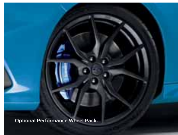
Optional Performance Wheel Pack.