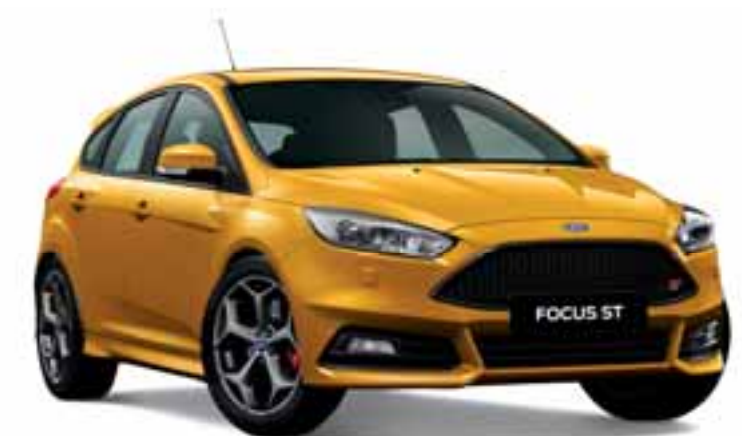
Focus ST show in Tangerine Scream. 8