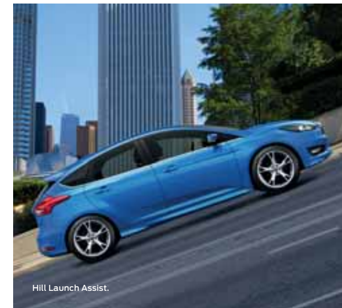
Hill Launch Assist.