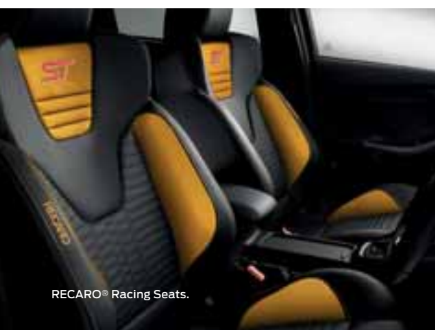
RECARO ® Racing Seats.