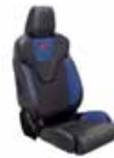
Trim colour: Spirit Blue