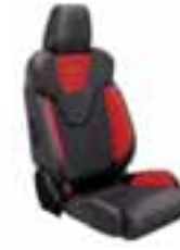
Trim colour: Race Red