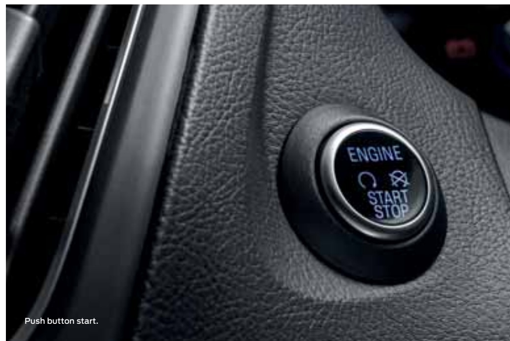
Push button start.

Be cool. On a hot day, open all your windows and cool your car quickly before you even get in. Just press and hold a button on your key fob and all the windows open automatically.†