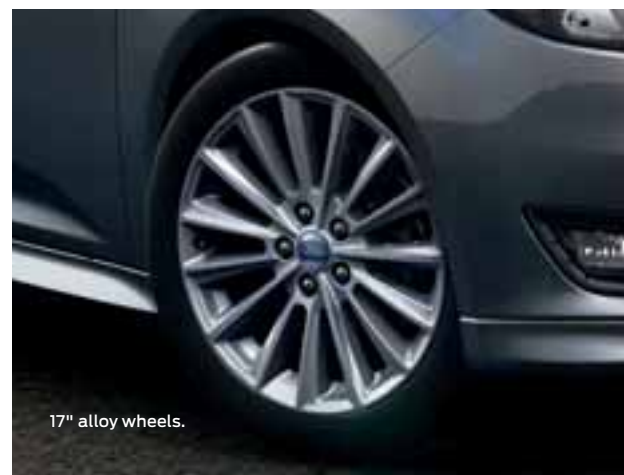
17" alloy wheels.