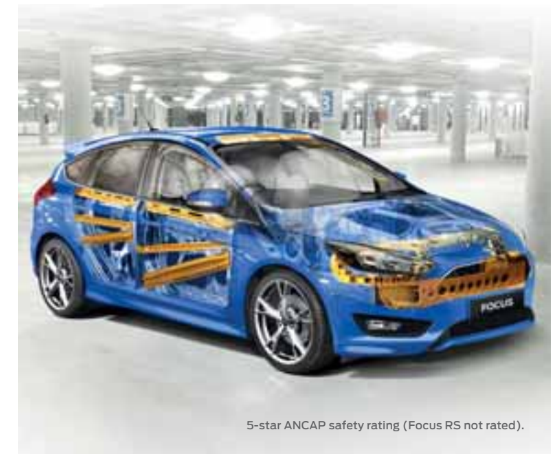
5-star ANCAP safety rating (Focus RS not rated).