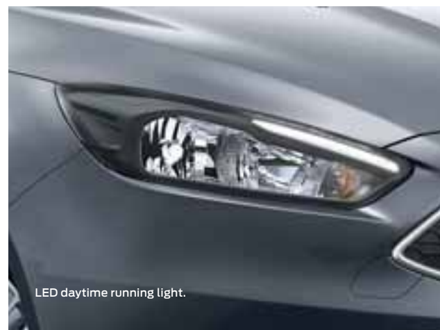
LED daytime running light.