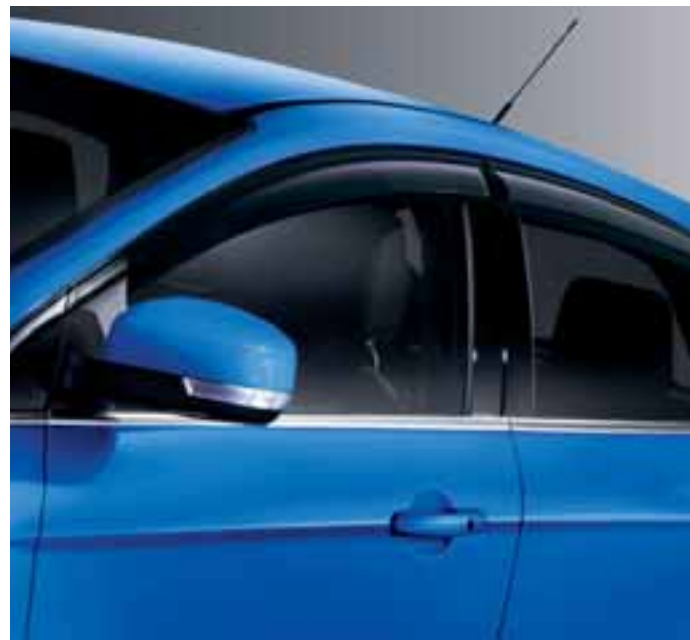
Weathershield. Reduces wind turbulence and noise, allowing you a more enjoyable drive with the windows down, even during light rain. Front and rear available.