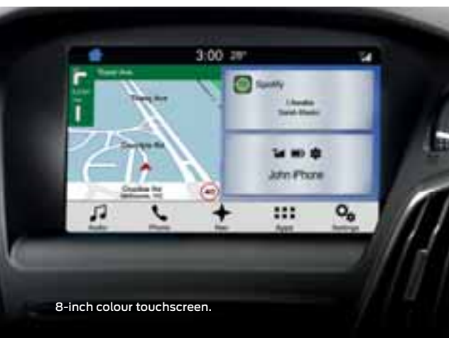
8-inch colour touchscreen.