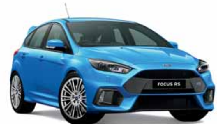
Focus RS shown in Nitrous Blue. 8