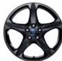
18" 5 spoke alloy wheel