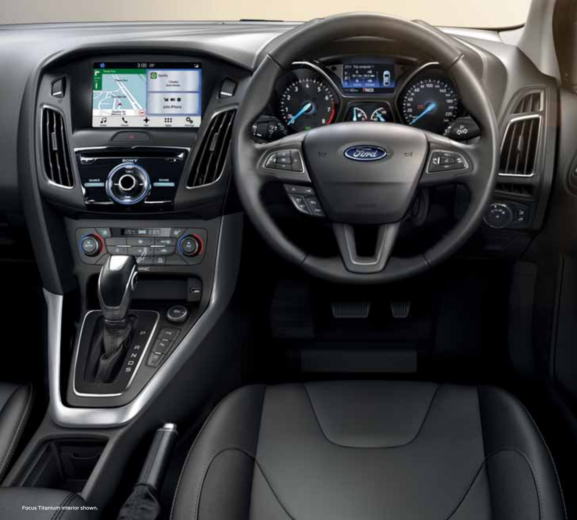
Focus Titanium interior shown.