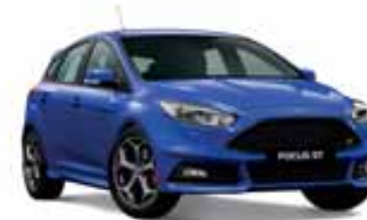
Deep Impact Blue*