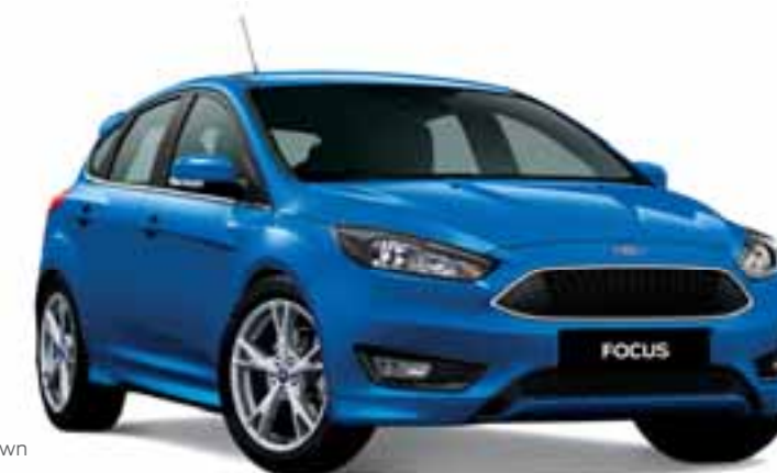
Focus Titanium shown in Winning Blue 1 .