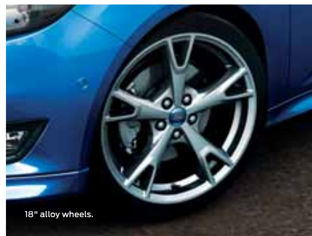
18" alloy wheels.