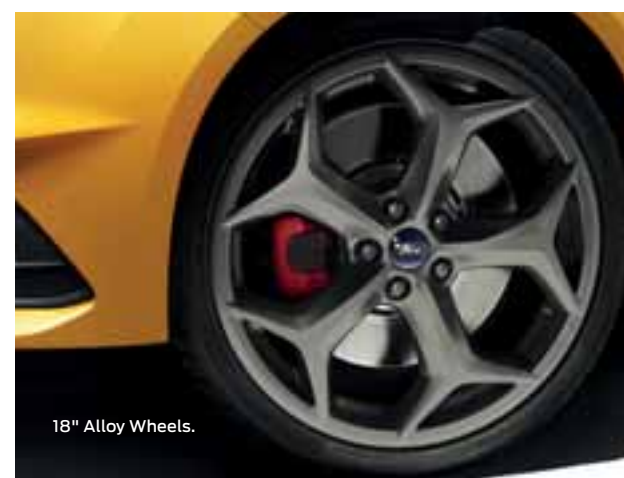
18" Alloy Wheels.