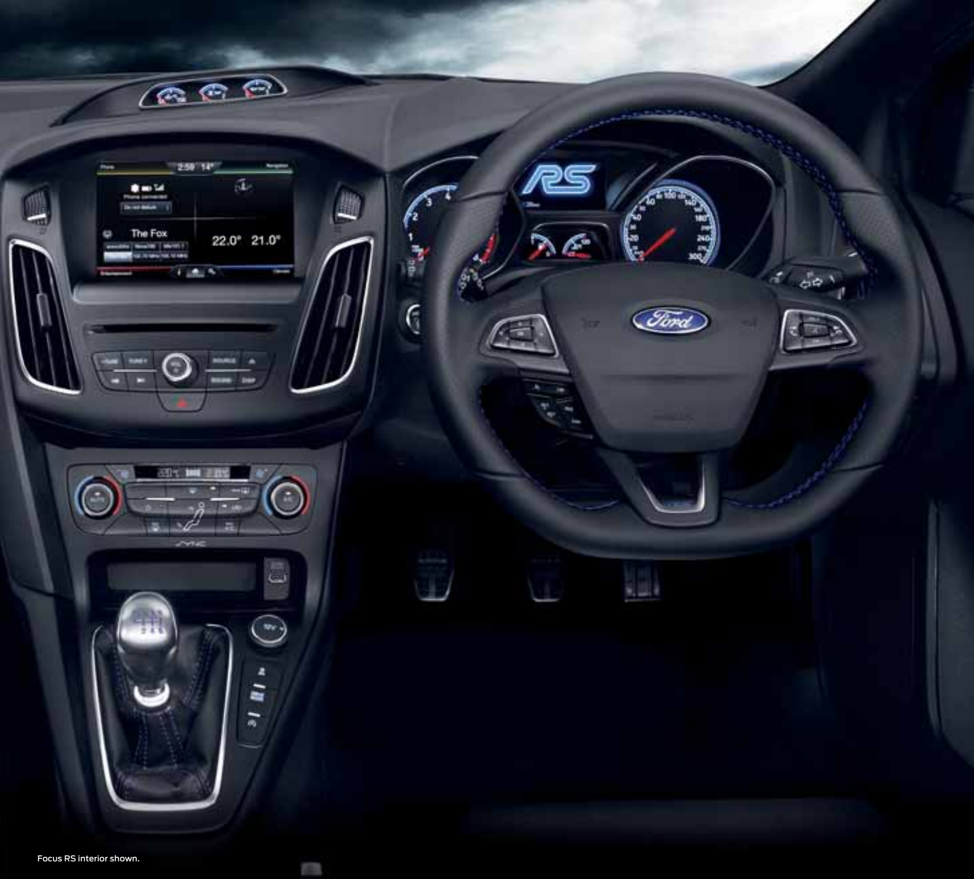
Focus RS interior shown.