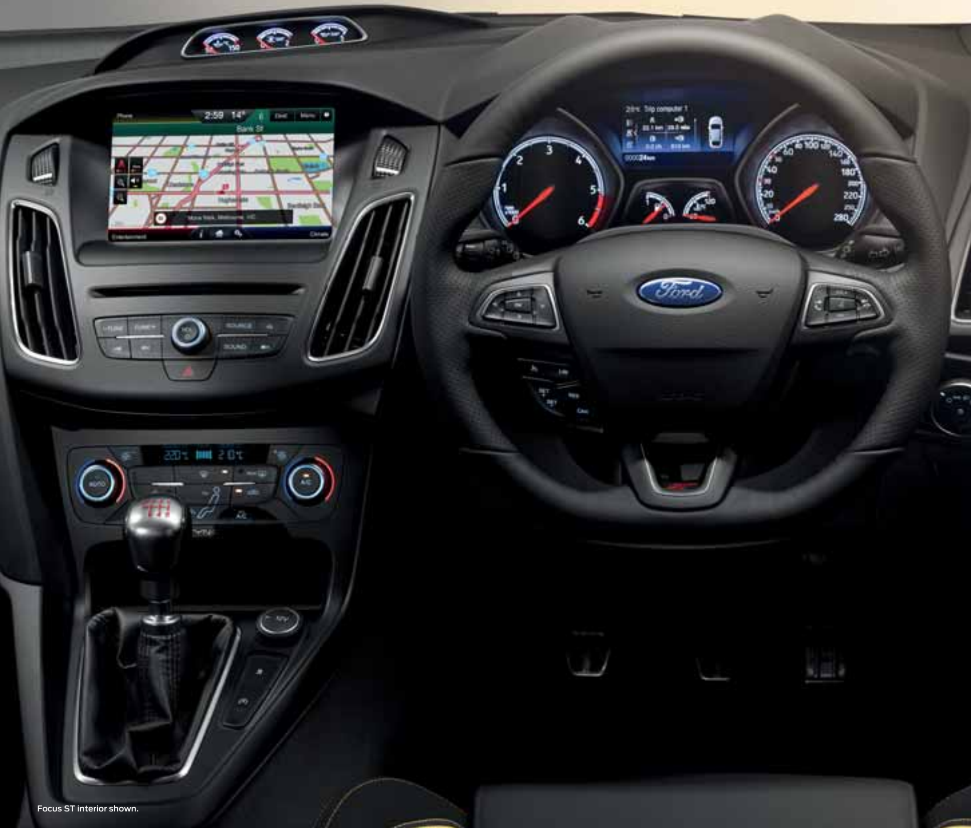
Focus ST interior shown.