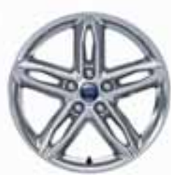
17" 5x2 spoke alloy wheel