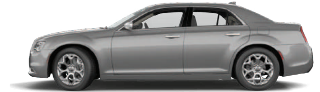
PSC - Billet Silver (Option)