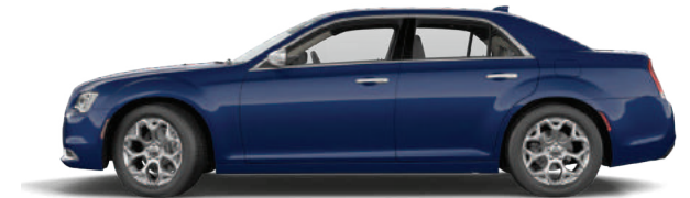
PXB - Jazz Blue (Option)