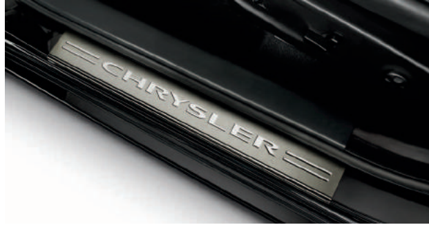
ILLUMINATED DOOR SILL GUARDS