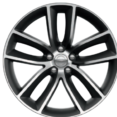
WR2 - 20-Inch Alloy Wheels (Standard on 300 SRT Core)