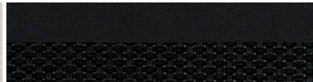
W7X9 - Black Cloth (Standard on 300 SRT Core)