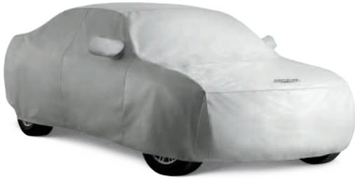
FULL VEHICLE COVER