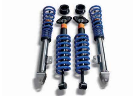
PERFORMANCE SUSPENSION KIT