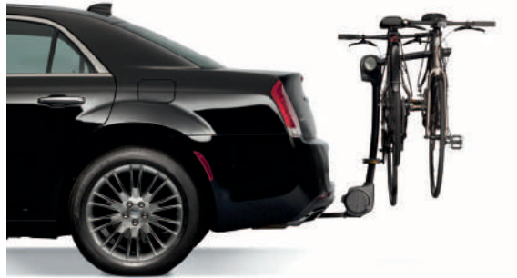
HITCH-MOUNT BIKE CARRIER