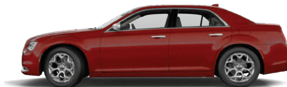
PRY - Redline Red (Option)