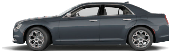
PAR - Maximum Steel (Option)