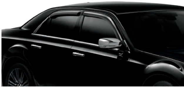
SIDE WINDOW AIR DEFLECTORS