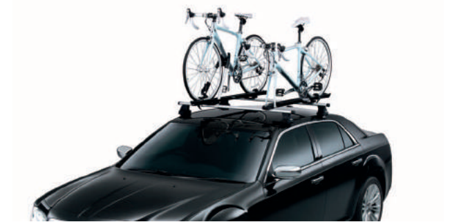
ROOF-MOUNT BIKE CARRIER