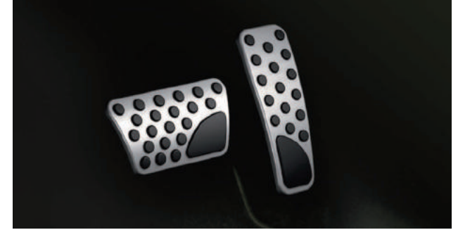
BRIGHT PEDAL KIT