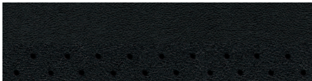
T5X9 - Black Perforated Nappa Leather and Suede (Standard on 300 SRT)