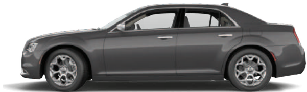
PAU - Granite Crystal (Option)