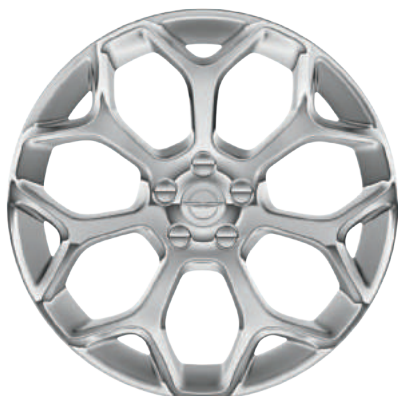
WDE - 20-Inch Alloy Wheels (Standard on 300C Luxury)