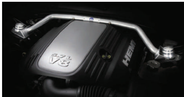
STRUT TOWER BRACE