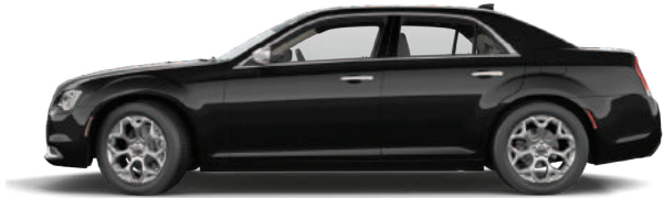
PX8 - Gloss Black (Standard)