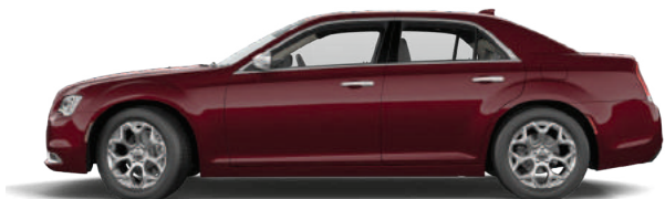
PRV - Velvet Red (Option)