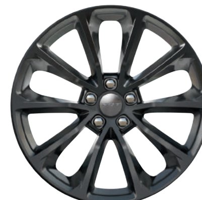
WSM - 20-Inch Forged Alloy Wheels (Standard on 300 SRT)