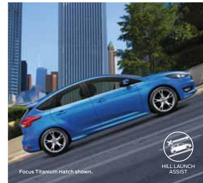
Focus Titanium Hatch shown.