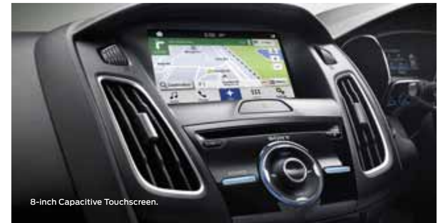
8-inch Capacitive Touchscreen.