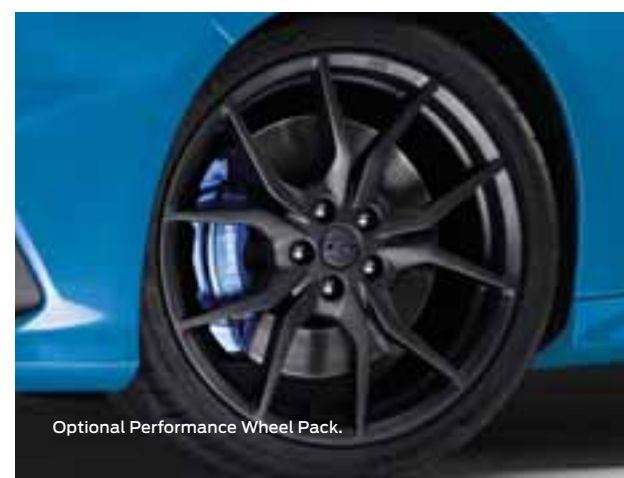
Optional Performance Wheel Pack.