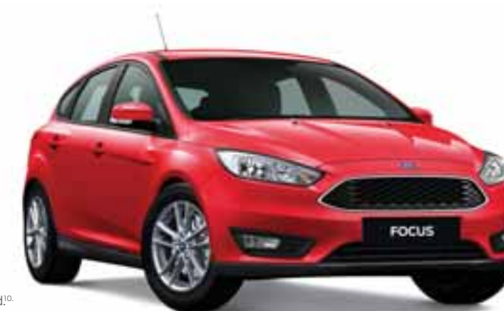
Focus Trend Hatch shown in Candy Red 10 .