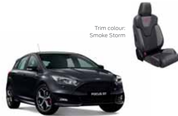
Trim colour: Smoke Storm