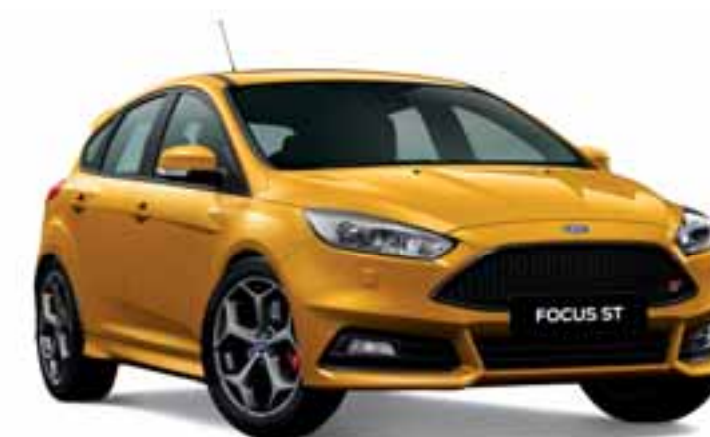
Focus ST show in Tangerine Scream 11 .