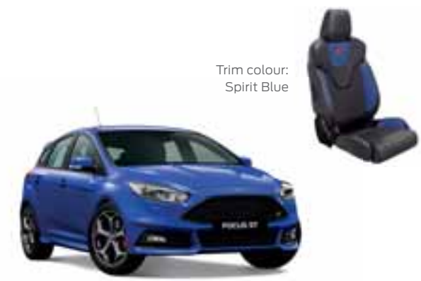
Trim colour: Spirit Blue