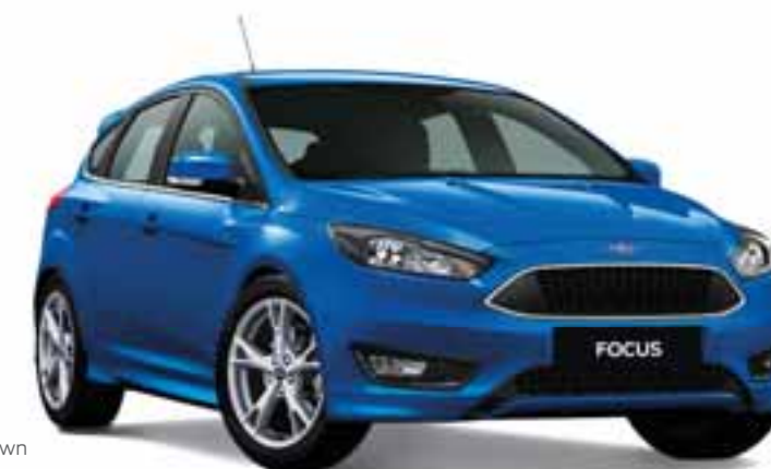
Focus Titanium shown in Winning Blue 5 .