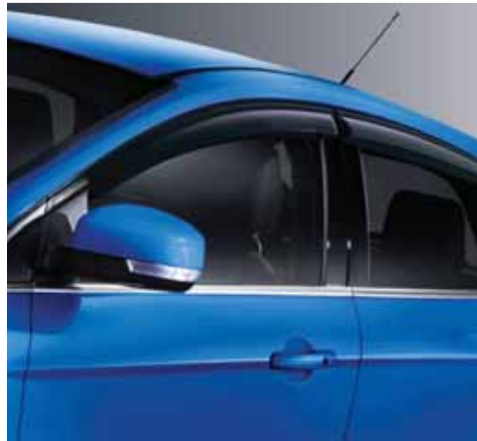
Weathershield. Reduces wind turbulence and noise, allowing you a more enjoyable drive with the windows down, even during light rain. Front and rear available.