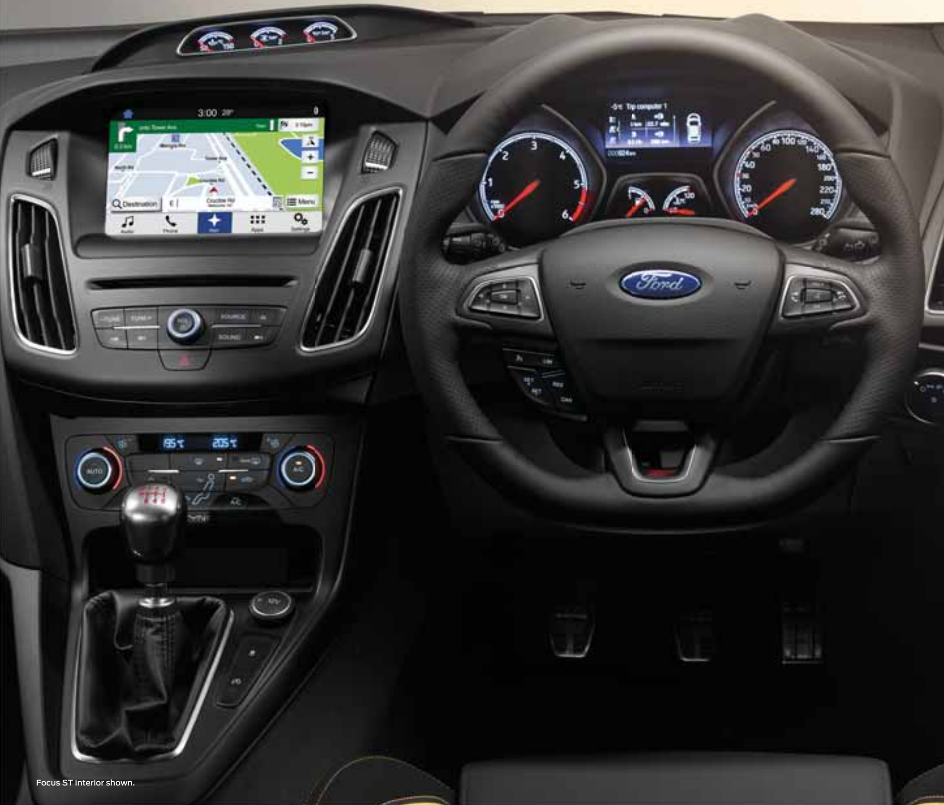
Focus ST interior shown.