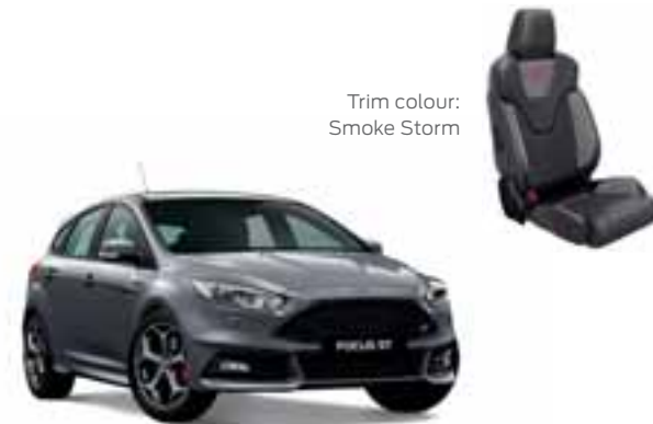
Trim colour: Smoke Storm