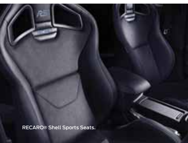
RECARO® Shell Sports Seats.