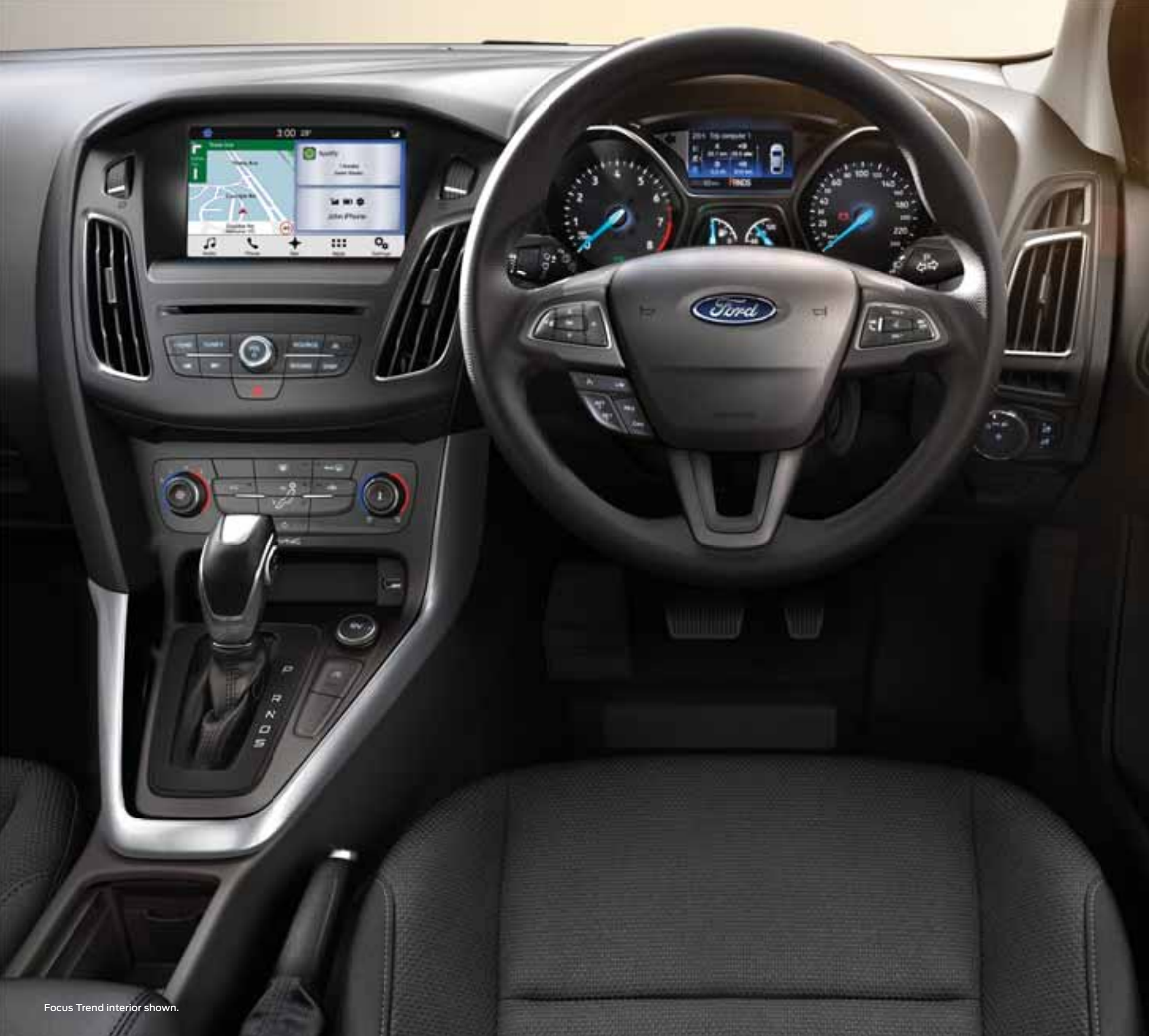
Focus Trend interior shown.