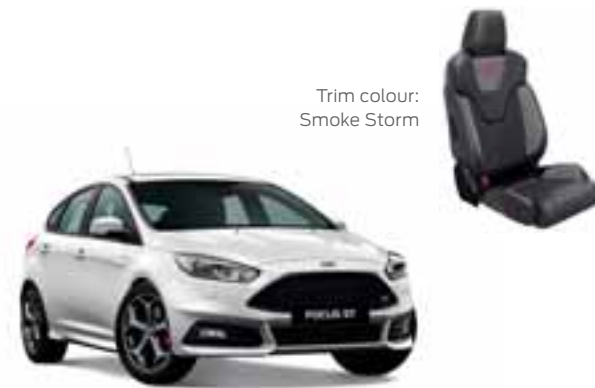
Trim colour: Smoke Storm