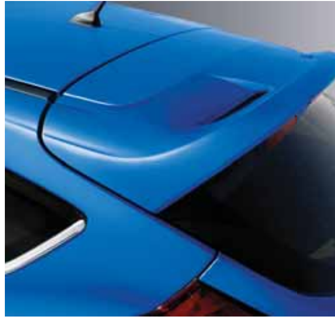
Hatch Rear Spoiler – large. This accessory gives an aerodynamic finish to the roof line.