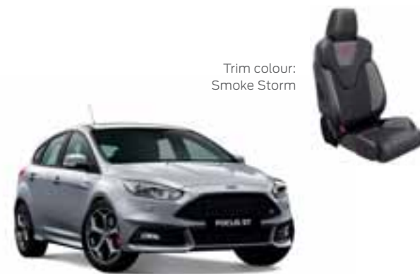
Trim colour: Smoke Storm