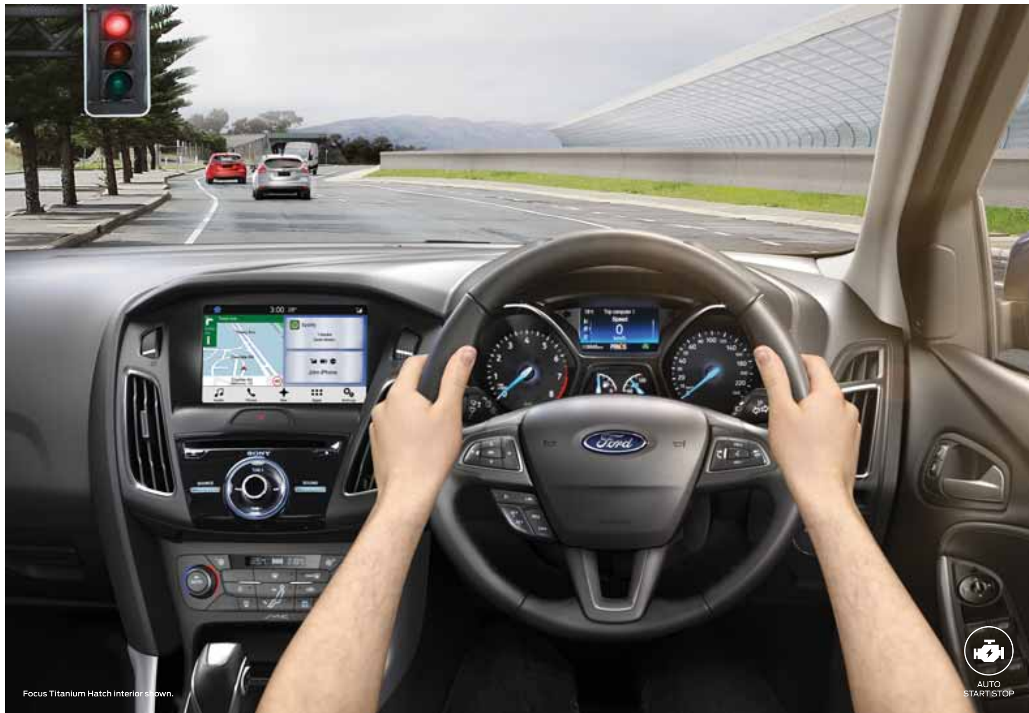
Focus Titanium Hatch interior shown.

Saves you money. With Auto Start-Stop Focus knows when you're stopped in traffic and shuts down the engine automatically. 2 Simply lift your foot off the brake and the engine restarts.