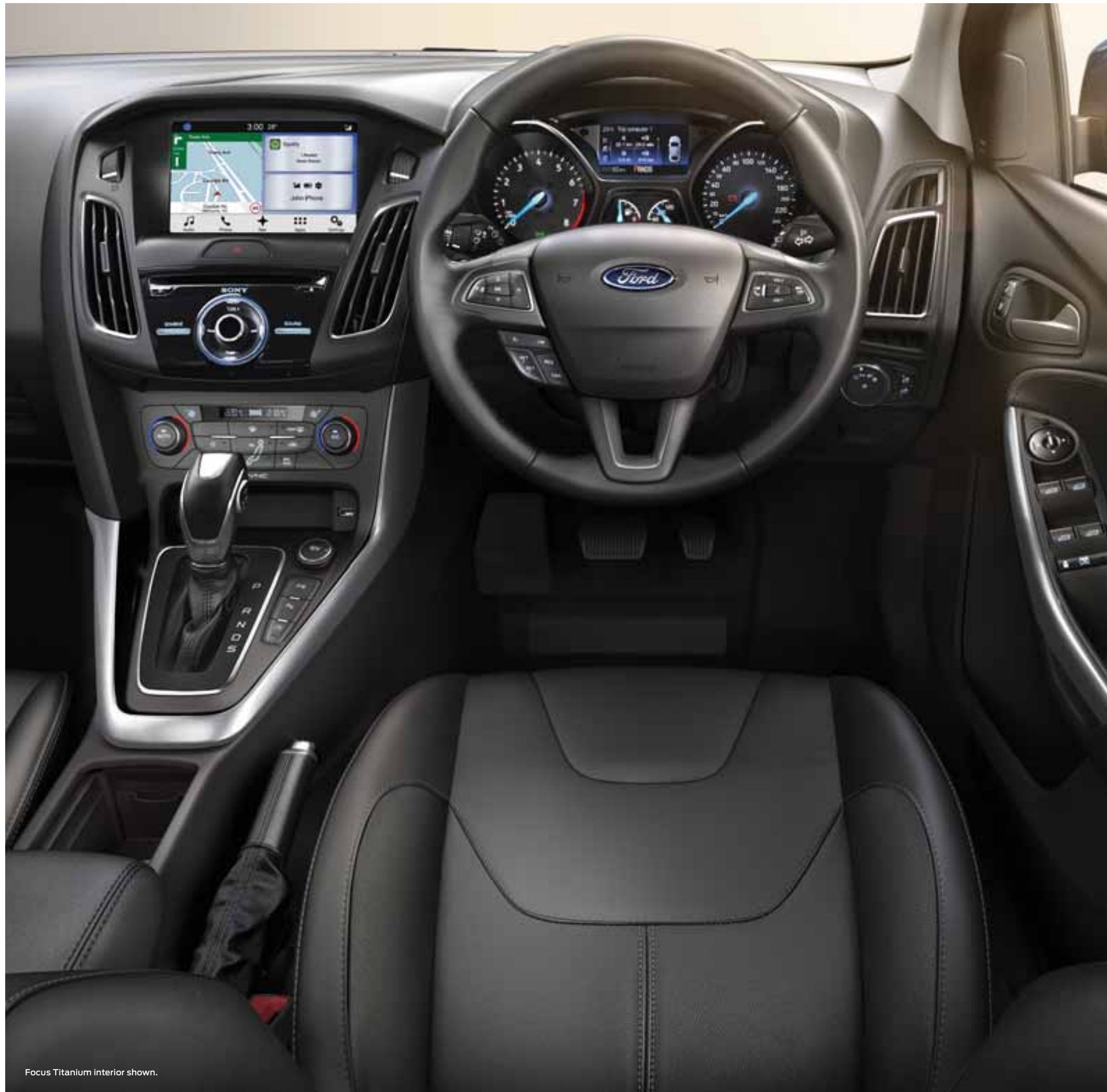
Focus Titanium interior shown.