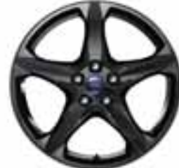
18" 5 spoke alloy wheel