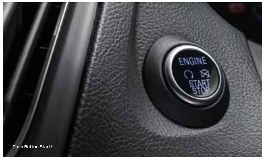
Push Button Start 4