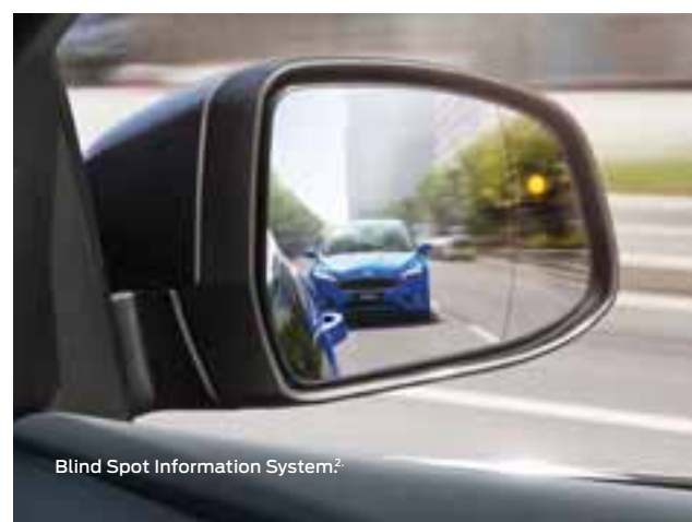
Blind Spot Information System 2 .