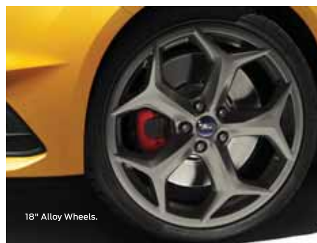
18" Alloy Wheels.