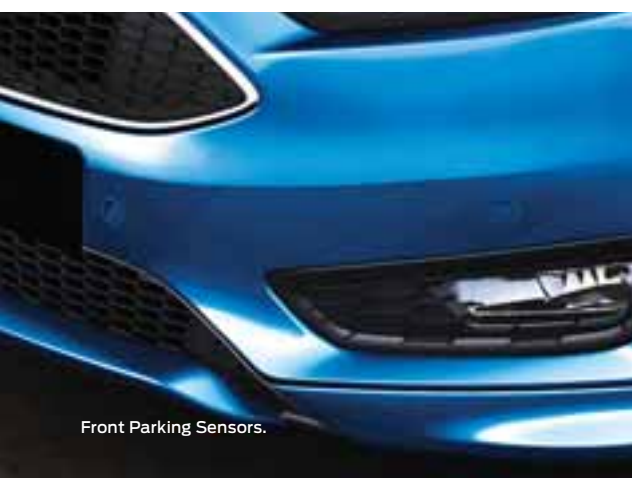
Front Parking Sensors.