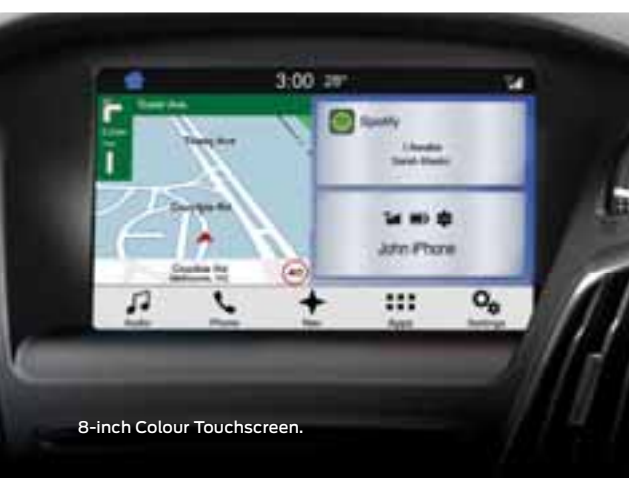
8-inch Colour Touchscreen.