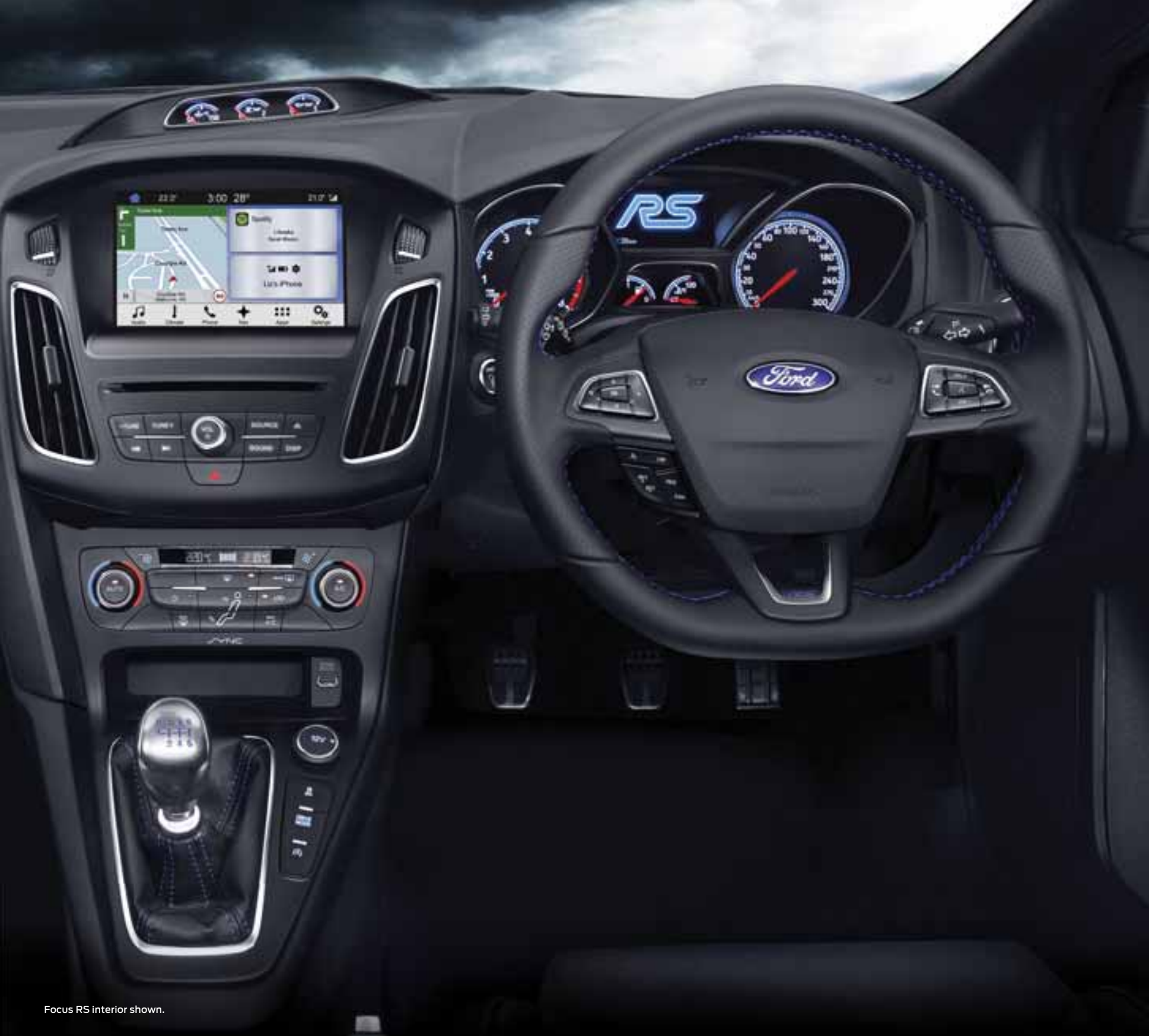
Focus RS interior shown.