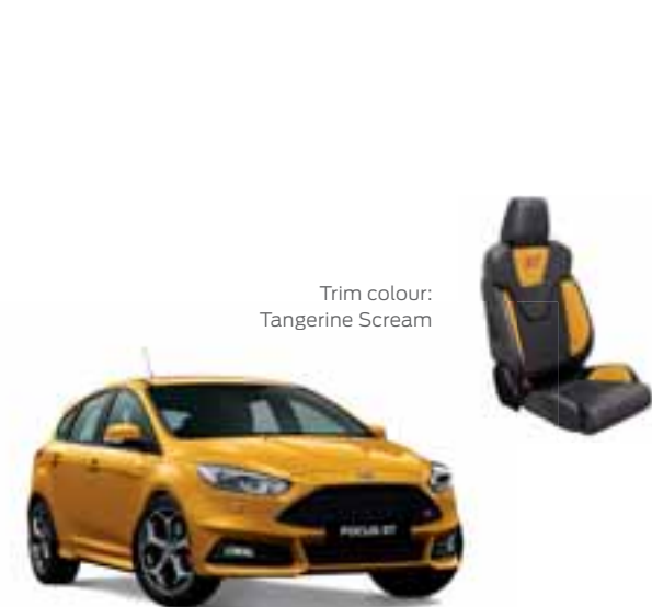
Trim colour: Tangerine Scream