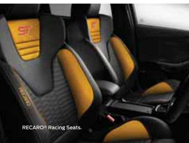
RECARO® Racing Seats.