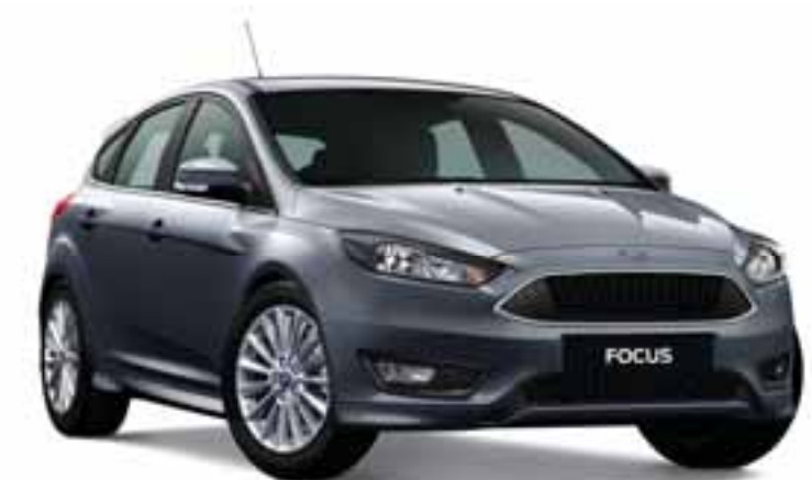
Focus Sport shown in Magnetic 5 .