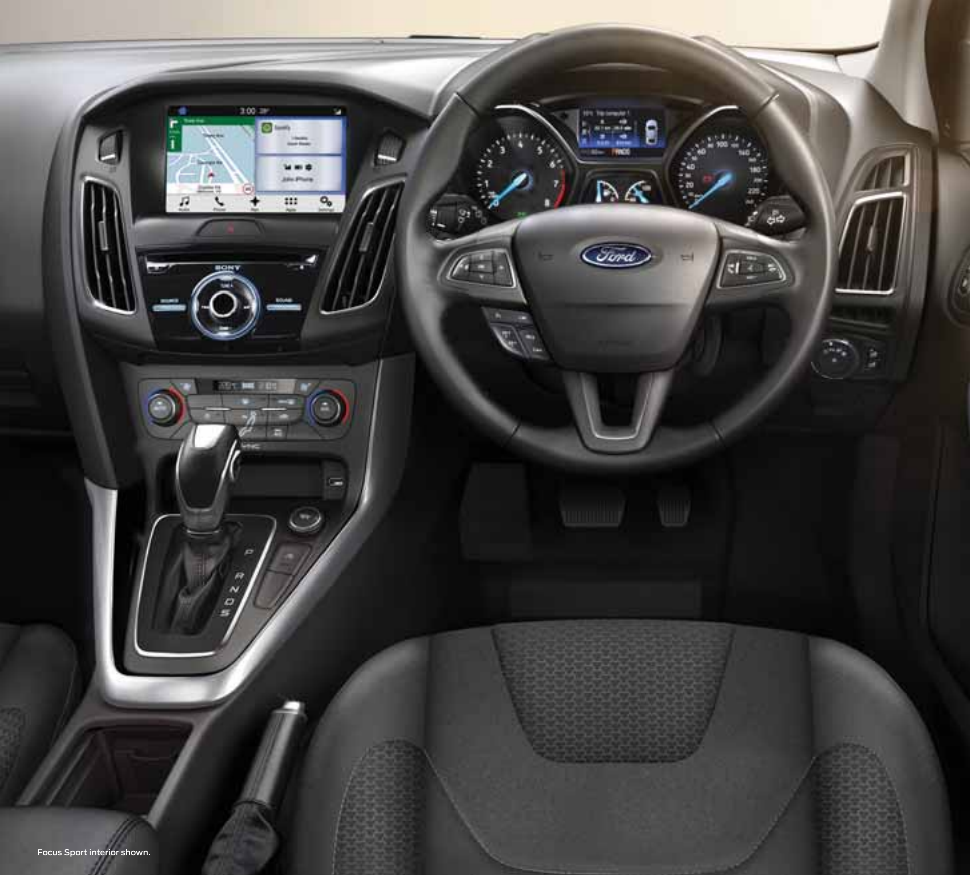
Focus Sport interior shown.