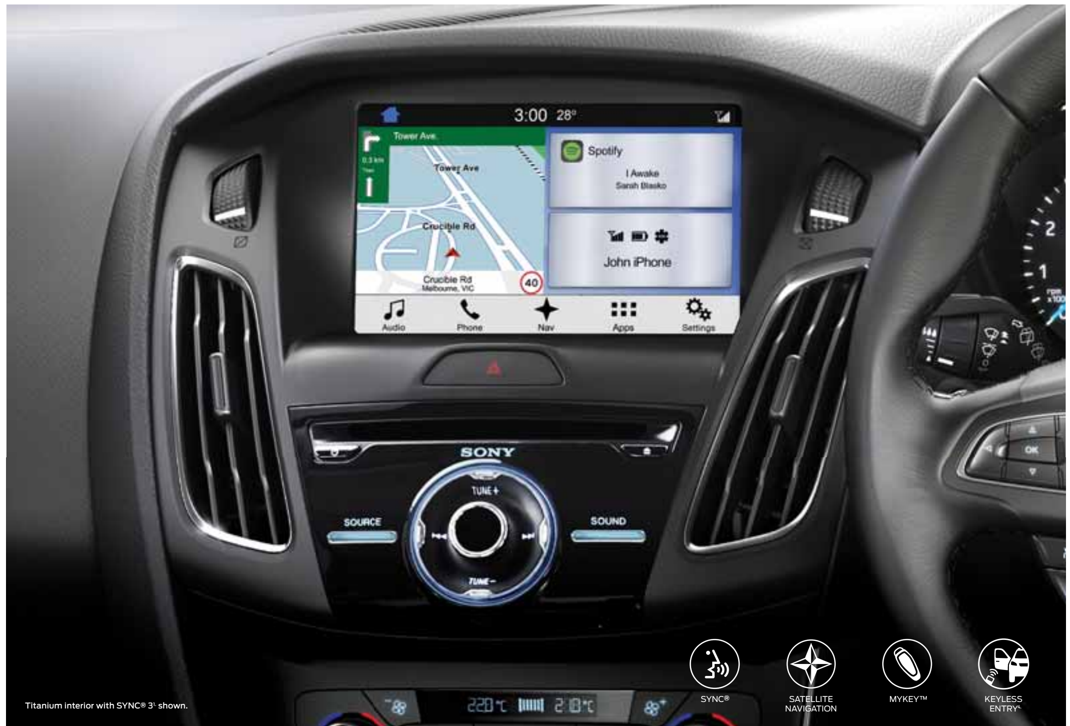
Titanium interior with SYNC® 3 1 shown.