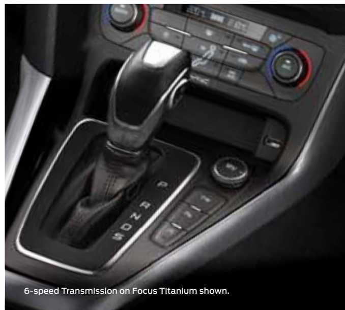
6-speed Transmission on Focus Titanium shown.