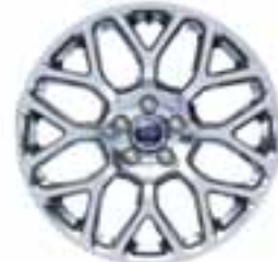
18" 8x2 spoke alloy wheel