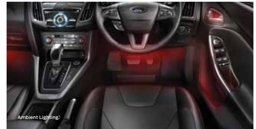
Ambient Lighting 1 .