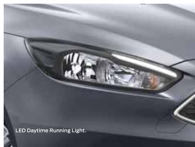
LED Daytime Running Light.