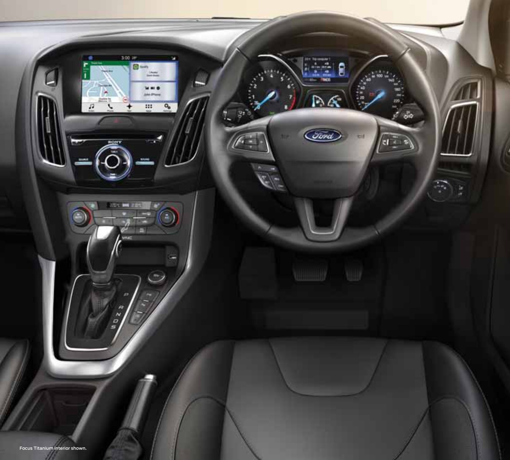
Focus Titanium interior shown.