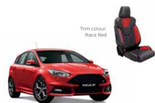
Trim colour: Race Red