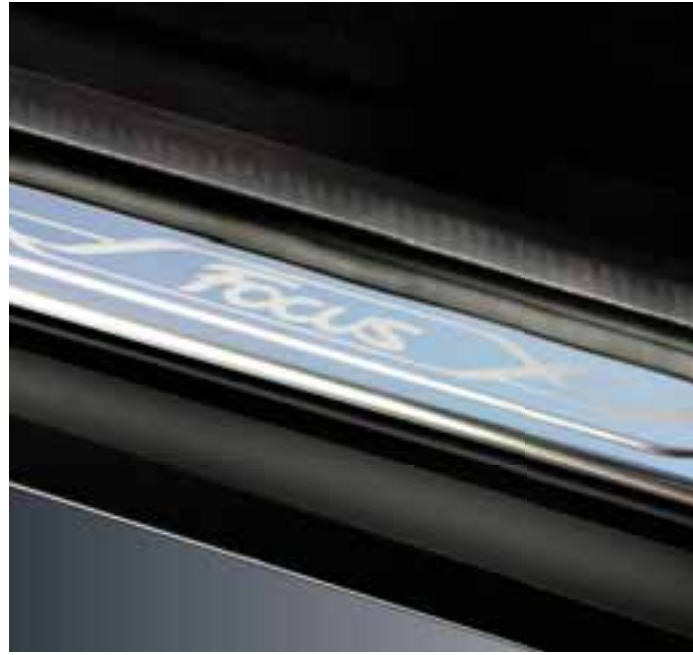
Scuff Plates. Elegant polished stainless steel Scuff Plates, with etched 'Focus' script.