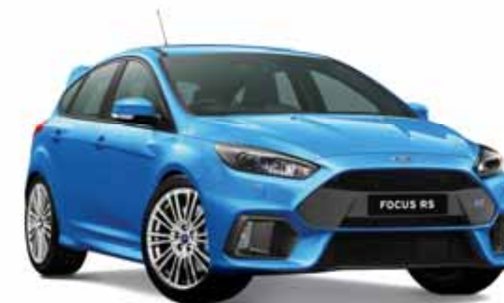
Focus RS shown in Nitrous Blue 8