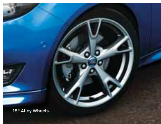
18" Alloy Wheels.