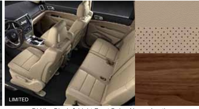
DLXL - Black & Light Frost Beige Nappa Leather (Option - Limited)