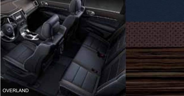
GLUC - Indigo Blue & Jeep Brown Nappa Leather (No Cost Option - Overland)