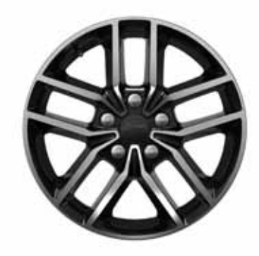
WCV - 18-Inch Off-Road Alloy Wheels (Standard - Trailhawk)