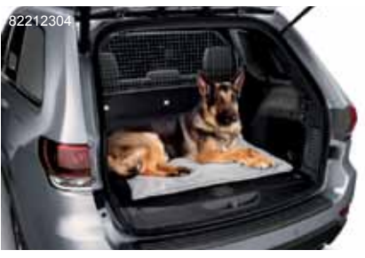
CARGO BARRIER. Minimize distractions when you travel and keep your four-footed family member safely restricted to the rear cargo area of your Grand Cherokee. This adjustable, low-glare, black steel barrier is customfitted and ready to install.