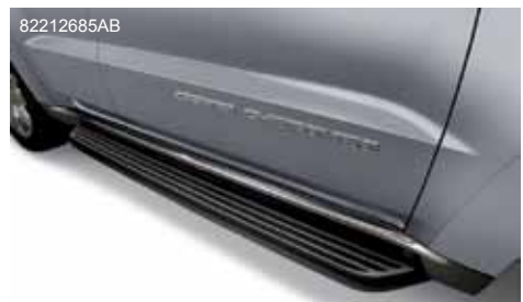
running boards are constructed of heavy-gauge steel, touch of stainles ssteel style to your vehicle while protect- add bold brightwork to your footwell. Rubber inserts on aiding in safe, easy entry and exit from your vehicle. ing its interior door sills from scratches. The Jeep® Brand pedals provide positive traction. No drilling required. Boards feature a Black outer cover with chrome accents. logo illuminates when the door is opened. Designed to