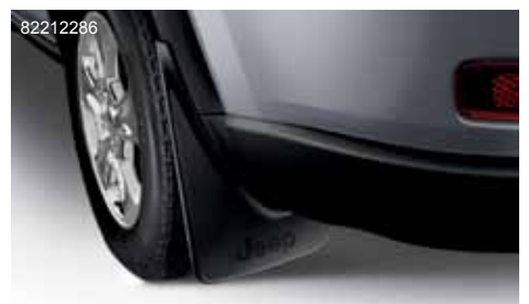
MOLDED SPLASH GUARDS. Designed to help protect your Grand Cherokee's body panels by deflecting gravel, salt and other road debris. Guards feature the Jeep® Brand logo.