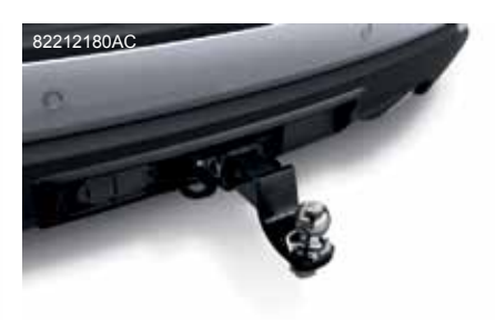
REVERSIBLE CARGO MAT. This non-slip, custom- HITCH RECEIVER. Receiver features a two-inch CHROME EXHAUST. Enhance the appearance of 3.6L engine), 3500kg (4x4 3.0L engine) & 2949kg (6.4L and touch of class. engine). Please refer to Owner's Manual for safe use.