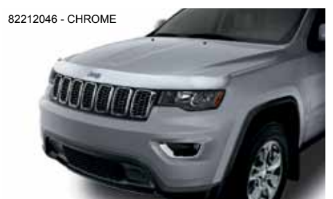
CHROME FRONT AIR DEFLECTOR. Deflect road HITCH-MOUNT BIKE CARRIER. Hitch-mount debris, dirt and insects away from your vehicle's hood and windshield with this easily installed accessory. The wraparound style creates an air stream to help direct develocle's liftgate to open without having to remove bikes. safely and easily, and is compatible with all Mopar® Sport to the Sport Utility Bars or Removable Roof Rack Kit. bris up and away from the hood.