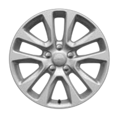
WST - 20-Inch Alloy Wheels (Standard - Limited)