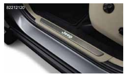
enhance Limited, Overland® and Summit® models.