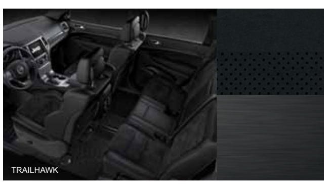
THXC - Black Nappa Leather with Suede & Red Accent Stitch (Standard - Trailhawk)