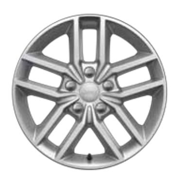
WCT - 18-Inch Alloy Wheels (Standard - Laredo)