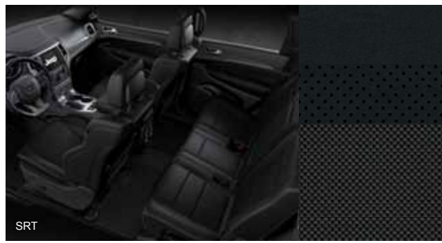
DZX9 - Black Leather with Suede (Standard - SRT)