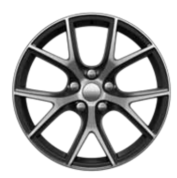
WRM - 20-Inch Light-Weight Forged Alloy Wheels (Option - SRT)