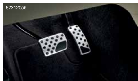
MOLDED RUNNING BOARDS. These premium ILLUMINATED DOOR SILL GUARDS. Add a BRIGHT PEDAL KIT. Stainless steel pedal covers