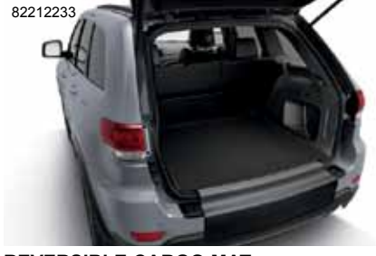
fit cargo mat features a rubberized side to prevent cargo opening and, when properly equipped with weight-dis-your vehicle's existing exhaust system with this easily infrom sliding and a soft fabric side to protect your vehicle's tributing equipment, allows it to tow up to 2812kg (4x4 stalled accessory. The chrome tip adds a polished finish interior carpet. The mat is easy to remove for cleaning.