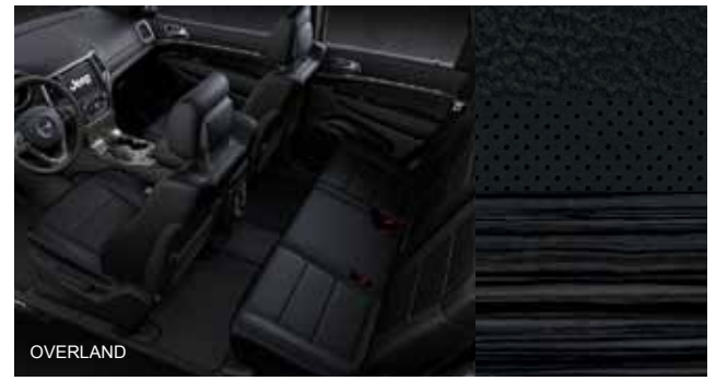
GLX9 - Black Nappa Leather (Standard - Overland)