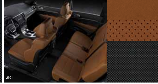
DZVX - Black & Sepia Leather with Suede (Option - SRT)