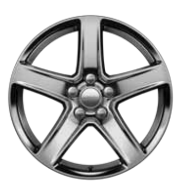
WSH - 20-Inch Forged Alloy Wheels (Standard - SRT)