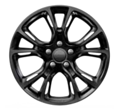
WPM - 20-Inch Satin Carbon Forged Alloy Wheels (Option - SRT)