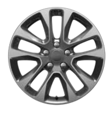
WSP - 20-Inch Alloy Wheels (Standard - Overland)