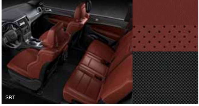
LSX6 - Black & Dark Ruby Red Laguna Leather (Option - SRT)