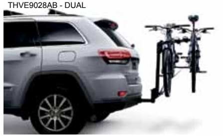
Carrier features carrying clamps and security cable.