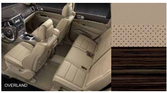
GLUL - Jeep Brown & Light Frost Beige Nappa Leather (No Cost Option - Overland)