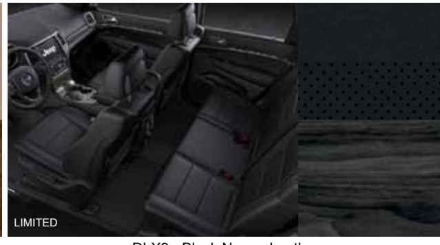
DLX9 - Black Nappa Leather (Option - Limited)