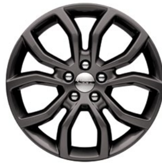
18-INCH HIGH-GLOSS GRANITE CRYSTAL WHEEL