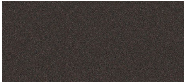
PMA - Bronze Metallic Option (Late Availability)