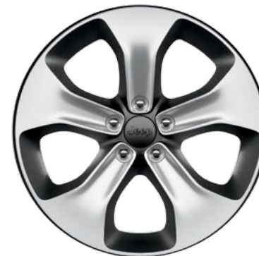
WPW - 18-Inch Alloy Wheels (Standard on Limited)