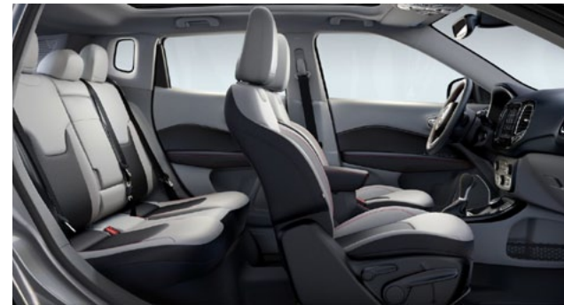
ALXS - Black and Ski Gray Leather (No Cost Option - Limited)