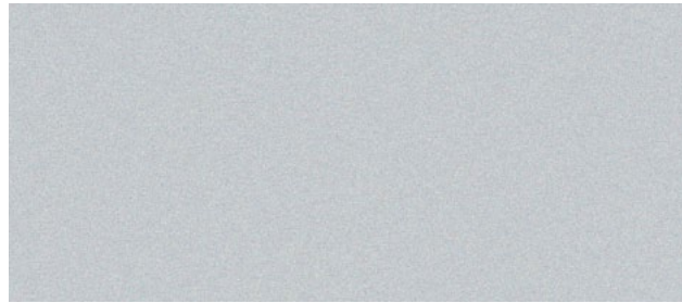
PAF - Minimal Grey Option