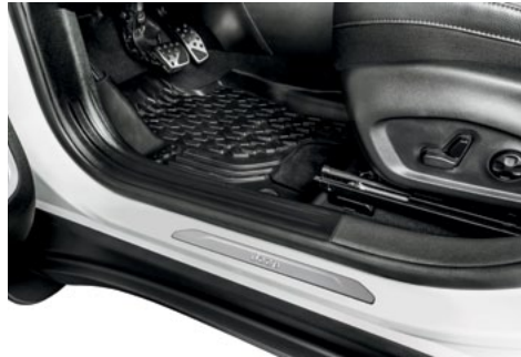
DOOR SILL GUARDS