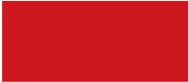
PRX - Colorado Red Standard