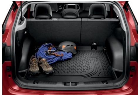
MOULDED CARGO TRAY