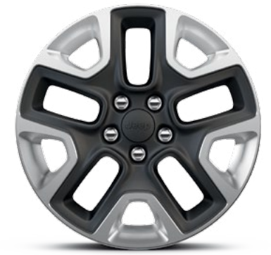
WFC - 17-Inch Off-Road Alloy Wheels (Standard on Trailhawk)