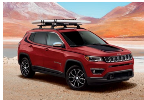
ROOF-MOUNT SKI AND SNOWBOARD CARRIER