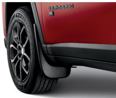
CUSTOM BONNET AND BODY SIDE GRAPHICS