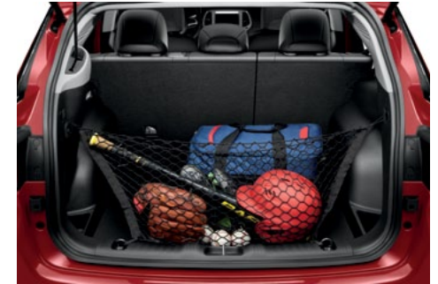
ENVELOPE CARGO NET