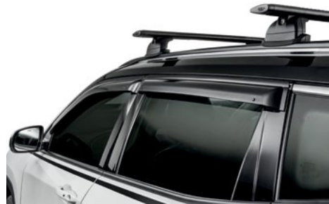
SIDE WINDOW AIR DEFLECTORS