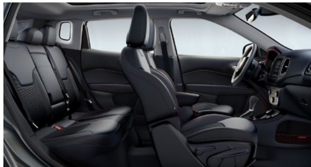
Q6XC - Black Cloth and Leather (Standard - Trailhawk)