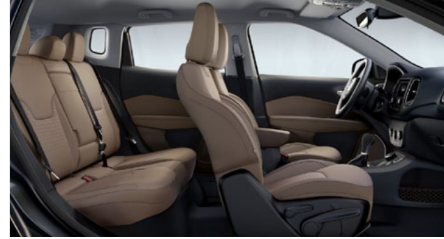
A7XU - Sandstorm Cloth (No Cost Option - Sport & Longitude)