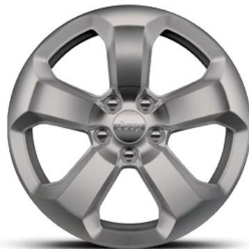
WAC - 17-Inch Alloy Wheels (Standard on Longitude)