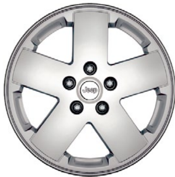
WK1 - 18-Inch 5-Spoke Alloy Wheel (Standard on Sport)