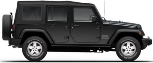
PX8 - Black (Standard)