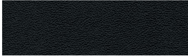
NLX9 - Black Moab Leather (Standard - Overland)