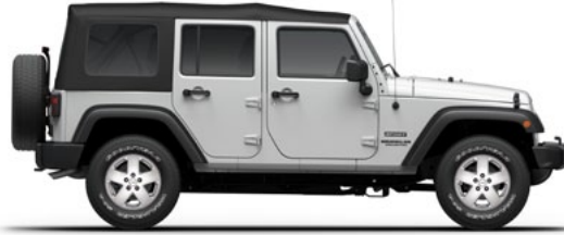
PW7 - Bright White (Standard)