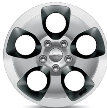
WFC - 18-Inch Alloy Wheel (Standard on Overland)