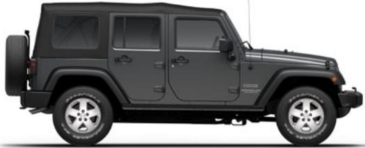
PAU - Granite Crystal (Option)