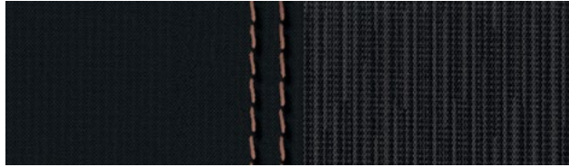
A7XV - Black Cloth with Tan (No Cost Option - Rubicon)