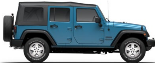
PQB - Chief (Limited Availability) (Option)