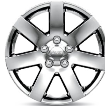
WPT - 18-Inch 7-Spoke Alloy Wheel (Option on Overland)