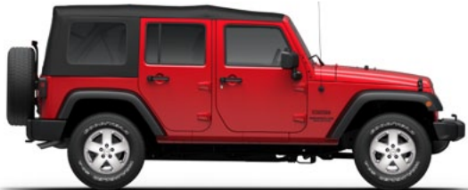
PRC - Firecracker Red (Option)