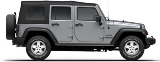
PSC - Billet Silver (Option)