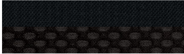
A7X9 - Black Cloth (Standard - Sport)