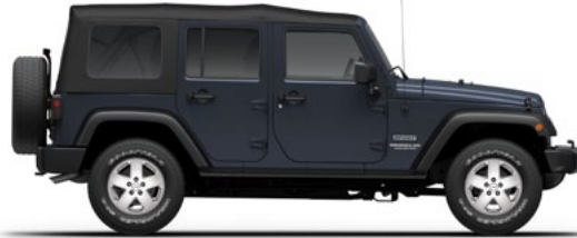
PSQ - Rhino (Option)