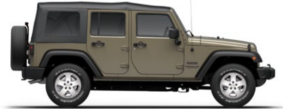
PUA - Gobi (Option)