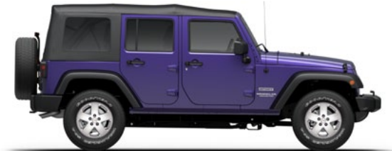
PHG - Xtreme Purple (Limited Availability) (Option)