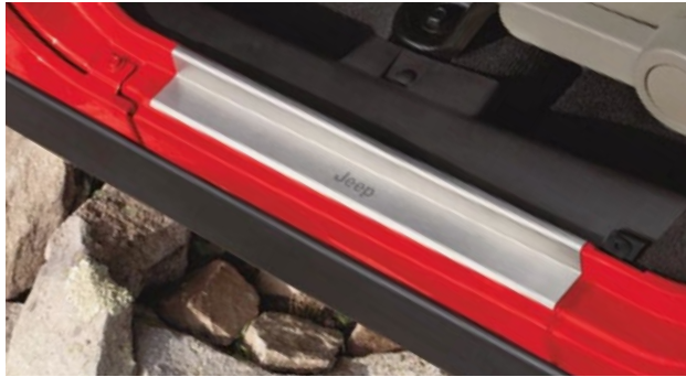
STAINLESS STEEL DOOR SILL GUARDS