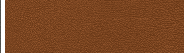
ALXV - Black & Tan McKinley Leather with Tan (Option - Rubicon)