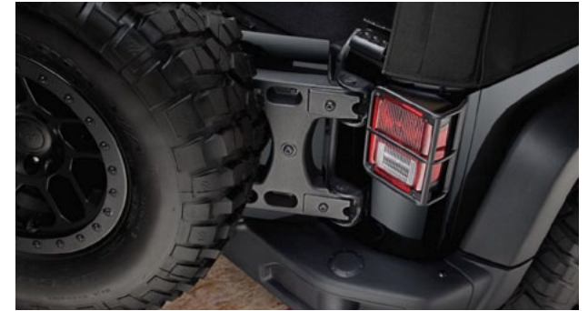
TAILGATE REINFORCEMENT ASSEMBLY