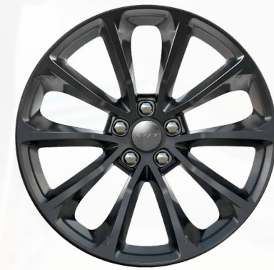
WSM - 20-Inch Forged Alloy Wheels (Standard on 300 SRT)