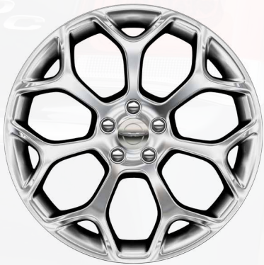
WDE - 20-Inch Alloy Wheels (Standard on 300C Luxury)

Option (O) Standard (S) Not Available (-) Must Have (m/h) Not Available With (NAW)