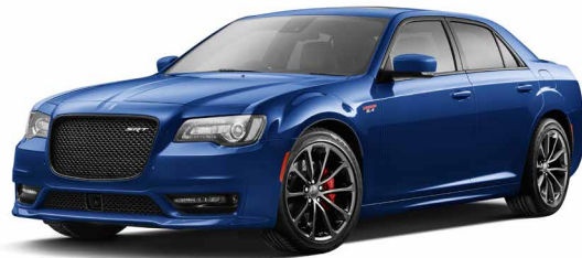
PBM - Ocean Blue (Customer Order Only)