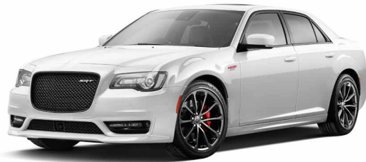
PW7 - Bright White (Standard)