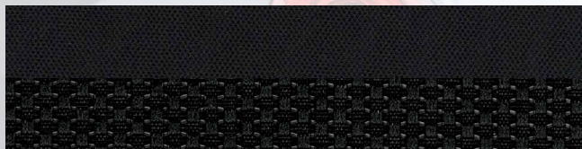
A7X9 - Black Cloth (Standard on 300 SRT Core)