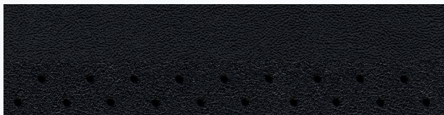
T5X9 - Black Perforated Nappa Leather and Suede (Standard on 300 SRT)