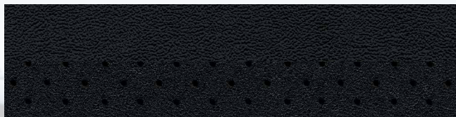
ELX9 - Black Quilted and Perforated Nappa Leather (Standard on 300C Luxury)