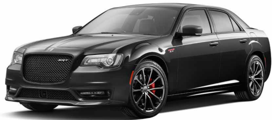
PAU - Granite Crystal (Option)