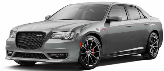
PSE - Silver Mist (Option)