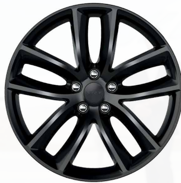
WRW - 20-Inch Black Noise Alloy Wheels (Standard on 300 SRT Core)