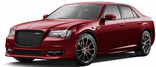
PRV - Velvet Red (Option)