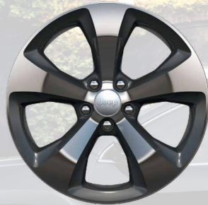
WP5 - 18-Inch Diamond Cut Grey Wheels with Painted Pockets (Option on Limited)