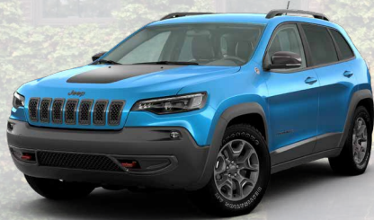
PBJ - Hydro Blue (Option)