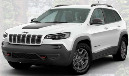
PW7 - Bright White (Standard)