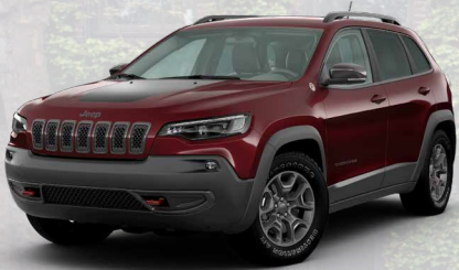
PRV - Velvet Red (Option)