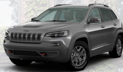
PSC - Billet Silver (Option)