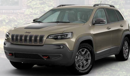
PT6 - Light Brownstone (Option)