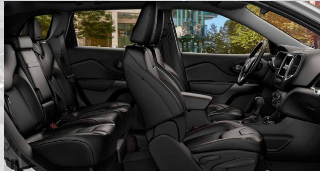
BLX9 - Black Leather with Red Accent Stitch (Option on Trailhawk)