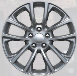
WFM - 17-Inch Alloy Wheels (Standard on Sport)

Option (O) Standard (S) Not Available (-) Not Available With (NAW)