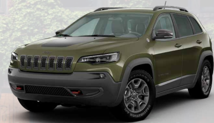
PFP - Olive Green (Option)