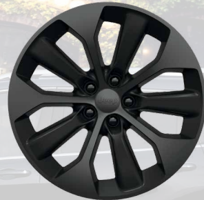
WPX - 19-Inch Granite Crystal Alloy Wheels (Standard on S-Limited)