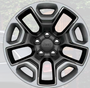
WBR - 17-Inch Diamond Cut Alloy Wheels (Standard on Trailhawk)