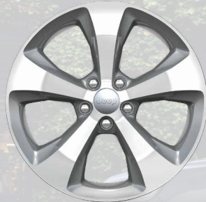
WPD - 18-Inch Satin Chrome Painted Alloy Wheels (Standard on Limited)