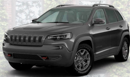
PAU - Granite Crystal (Option)