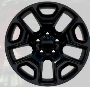
WBG - 17-Inch Black Painted Alloy Wheels (Option on Trailhawk with Trailhawk Premium Package)