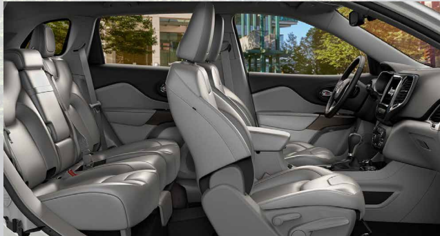
DLXS - Black & Ski Grey Leather (Option on Limited)