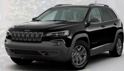
PXJ - Diamond Black (Option)