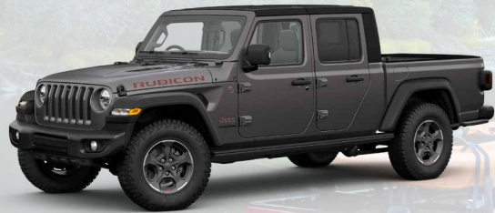
PAU - Granite Crystal (Option)