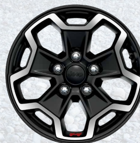
WFN - 17-Inch Polished Black Alloy Wheels (Option on Rubicon)