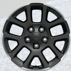
WPT - 18-Inch Granite Crystal Alloy Wheels (Standard on Overland)