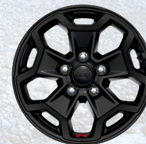
WBG - 17-Inch Black Alloy Wheels (Standard on Launch Edition)