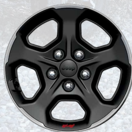
WFJ - 17-Inch Granite Crystal Alloy Wheels (Standard on Rubicon)