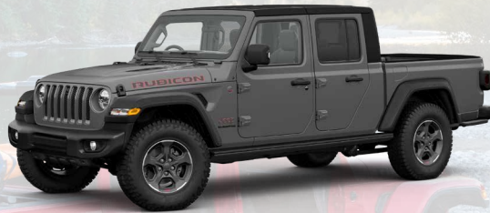
PDN - Sting Grey (Option)