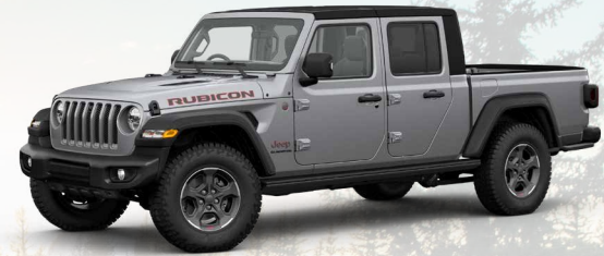
PSC - Billet Silver (Option)