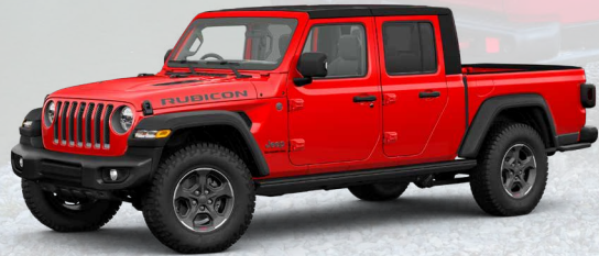
PRC - Firecracker Red (Option)