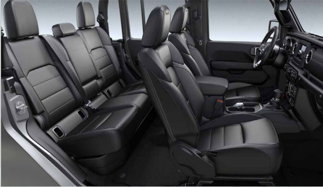
MLX9 - Black McKinley Leather with Overland Logo (Standard - Overland)