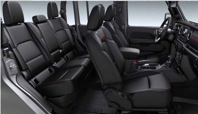
ALX9 - Black Leather Trimmed Bucket Seats with Rubicon Red Stitching (Standard - Launch Edition)