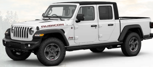
PW7 - Bright White (Standard)