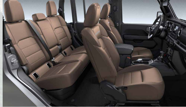
MLTV - Black/Dark Saddle McKinley Leather with Overland Logo (Option - Overland)