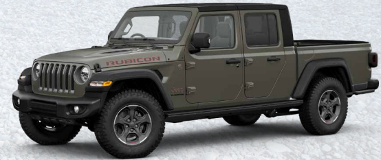
PGV - Gator (Option)