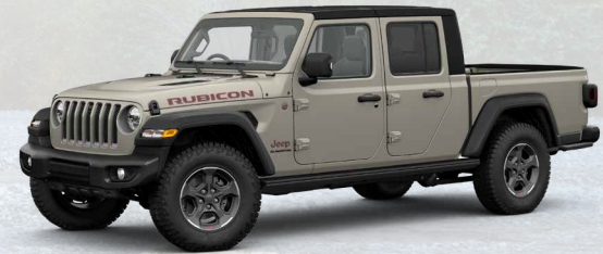
PUA - Gobi (Option)