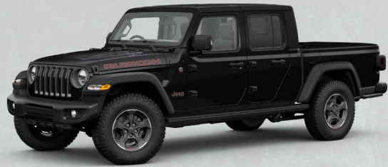
PX8 - Black (Standard)