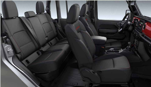
D5X9 - Black Premium Cloth Low-Back Bucket Seats (Standard - Rubicon)