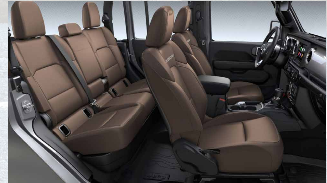
ALTV - Dark Saddle Leather Trimmed Bucket Seats (Option - Rubicon)