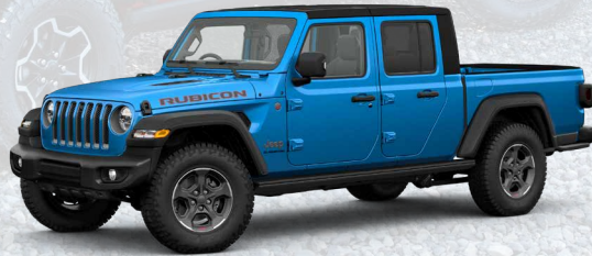
PBJ - Hydro Blue (Option)