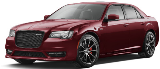
PRV - Velvet Red (Option)