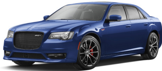
PBM - Ocean Blue (Customer Order Only)