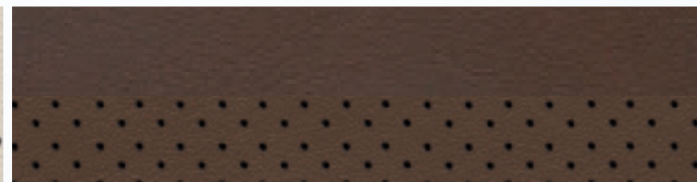
ELX8 - Deep Mocha Quilted and Perforated Nappa Leather (Option on 300C Luxury)