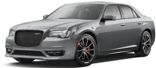
PSE - Silver Mist (Option)