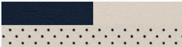
ELC3 - Indigo & Linen Quilted and Perforated Nappa Leather (Option on 300C Luxury)