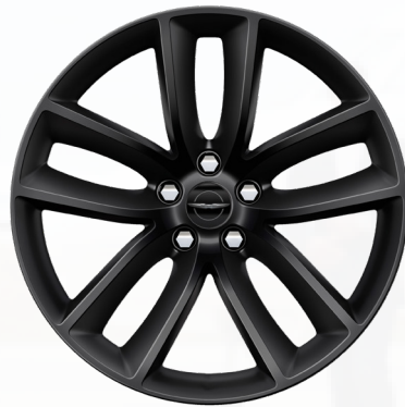
WHF - 20-Inch Low Gloss Black Noise Alloy Wheels (Standard on 300 SRT Core & 300 SRT)