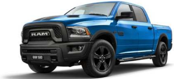
Hydro Blue (P)