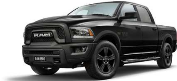
Diamond Black (P)