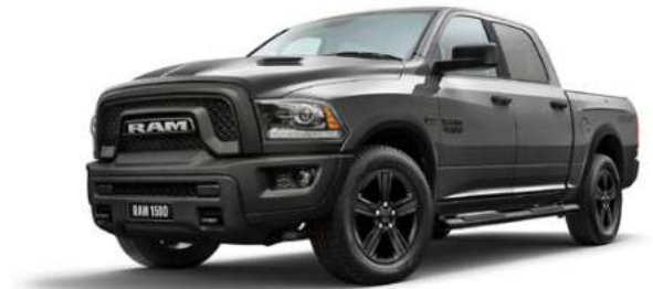
Granite Crystal (M)