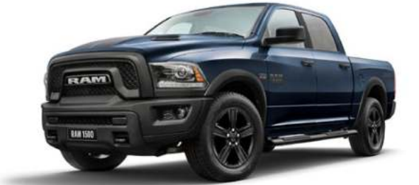
Patriot Blue (P)

M = Metallic, P = Pearlescent. Colours have been reproduced as faithfully as possible, however actual colours may vary due to screen settings.