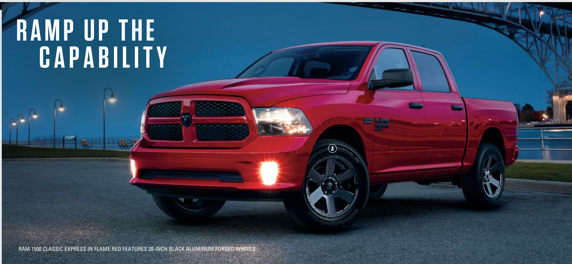
RAM 1500 CLASSIC EXPRESS IN FLAME RED FEATURES 20-INCH BLACK ALUMINUM FORGED WHEELS