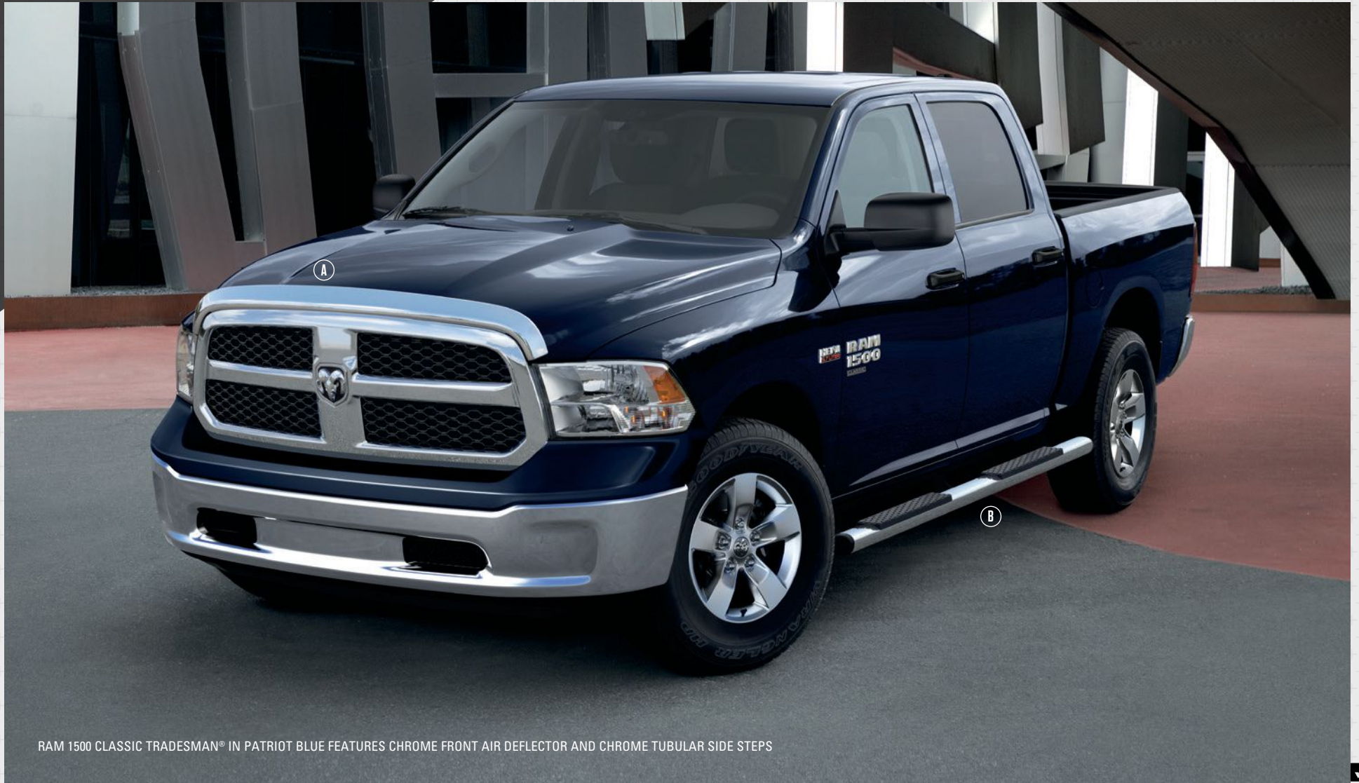
RAM 1500 CLASSIC TRADESMAN® IN PATRIOT BLUE FEATURES CHROME FRONT AIR DEFLECTOR AND CHROME TUBULAR SIDE STEPS

B. CHROME TUBULAR SIDE STEPS. Add functionality and style to your Ram 1500 Classic. These aluminum steps are polished and then chromed for durability, with tough rubber step pads on each side for sure footing. Available for all cab lengths. [82213588AE - Regular Cab] [82213589AE - Quad Cab®] [82213591AE - Crew Cab]