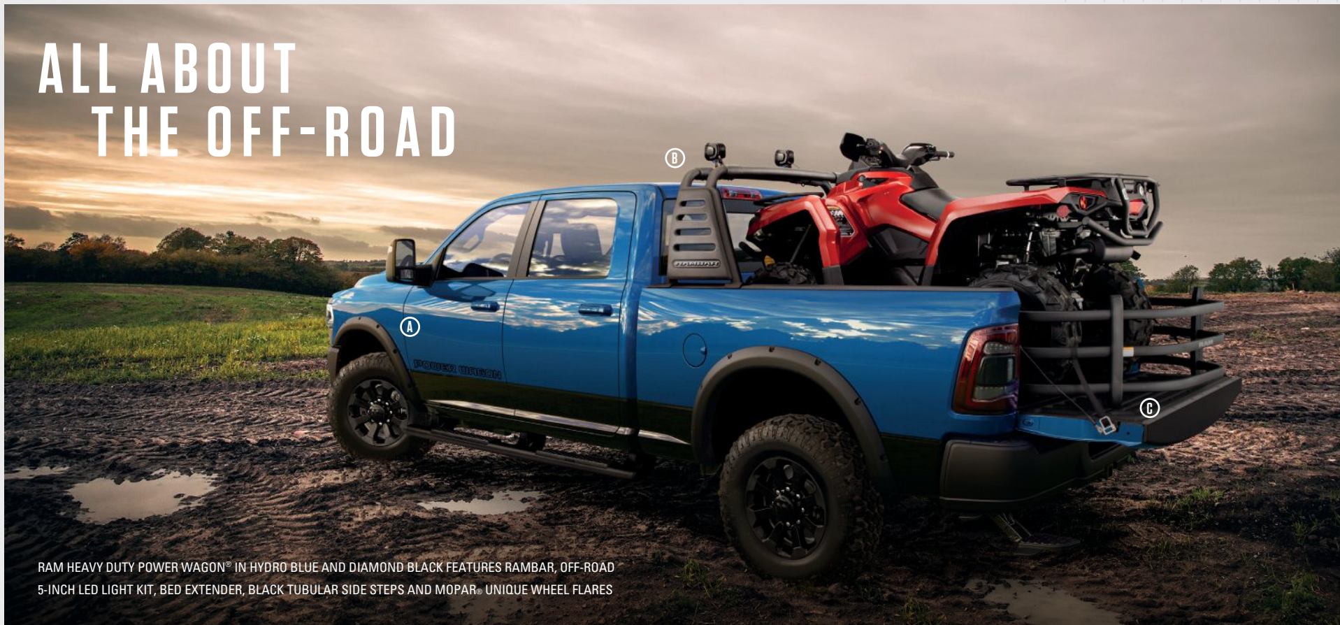
RAM HEAVY DUTY POWER WAGON® IN HYDRO BLUE AND DIAMOND BLACK FEATURES RAMBAR, OFF-ROAD 5-INCH LED LIGHT KIT, BED EXTENDER, BLACK TUBULAR SIDE STEPS AND MOPAR® UNIQUE WHEEL FLARES