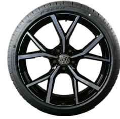
19" Estoril black, diamond-turned alloy wheels 8J x 19