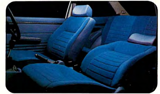
Inside the Hatchback - Space with luxury

Accord luxury, Accord style - Honda excellence