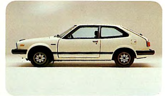
Hatchback - Sports style, wagon function