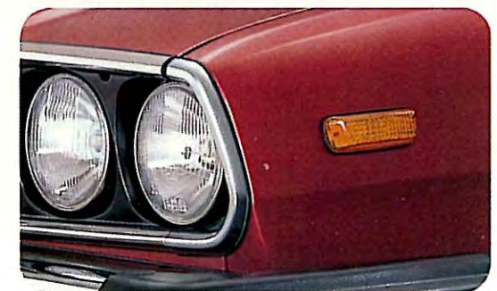
Quartz halogen headlights