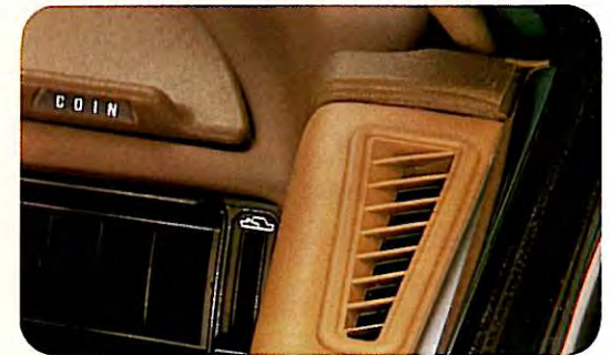
Side window demisting