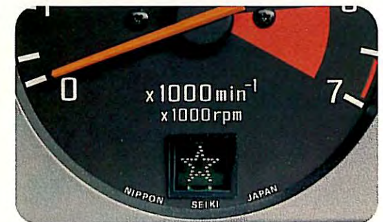
Hondamatic ratio indicator