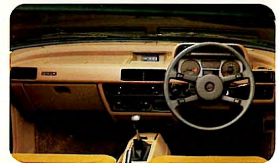
From the driver's seat