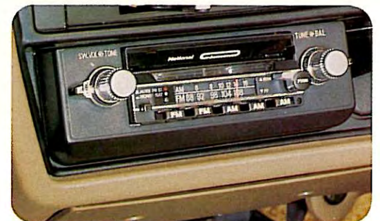
The Saloon's AM/FM radio/tape-player