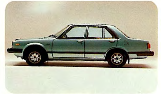
Accord Saloon - Elegance par excellence