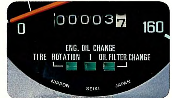
Accord tells you when it needs service