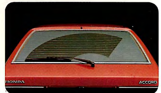
The Hatchback's standard rear wiper