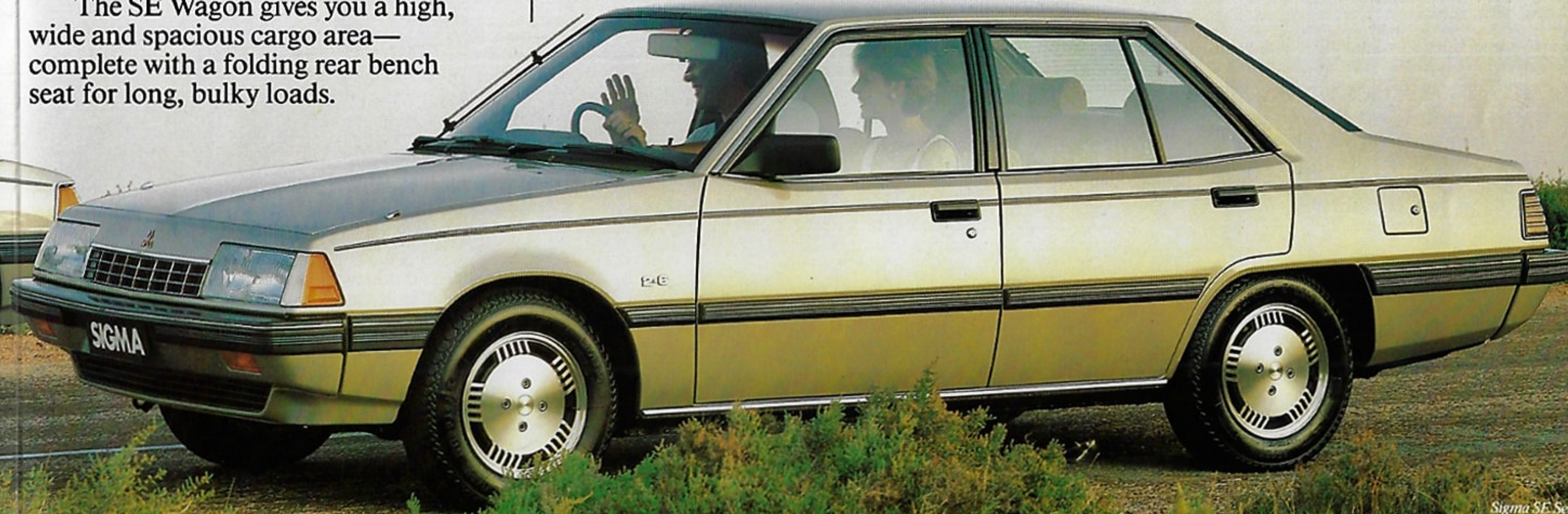
Sigma SE Sedan