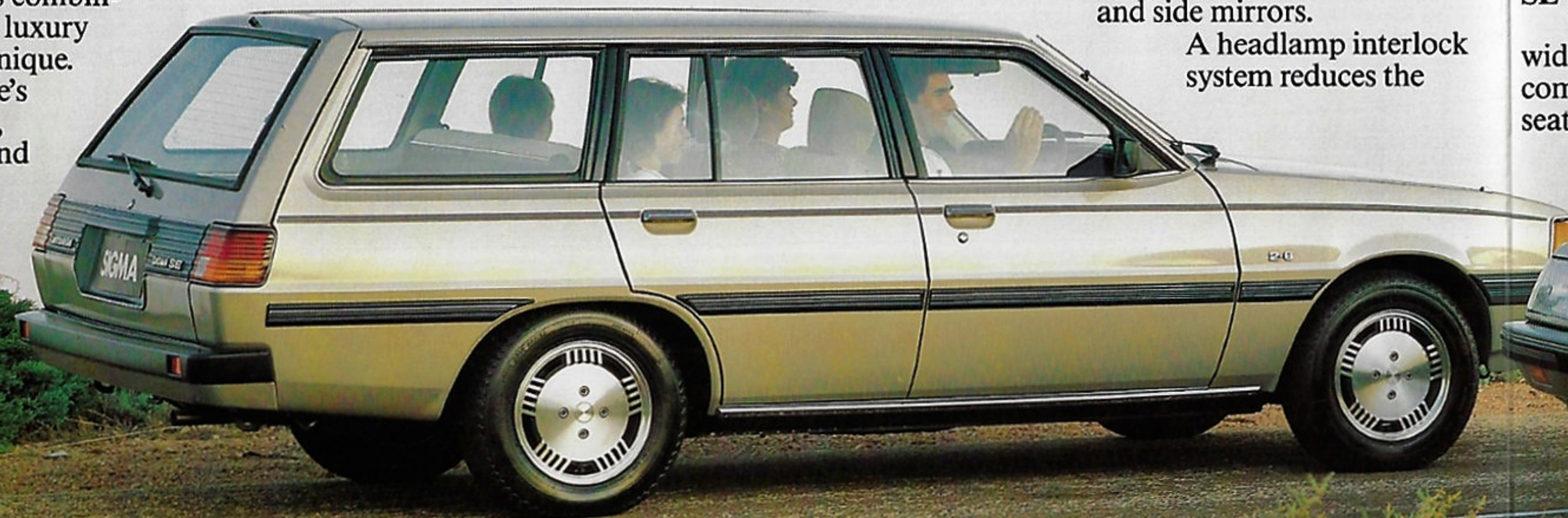
Sigma SE Wagon

*Mitsubishi fully-integrated air-conditioning —dealer fitment.