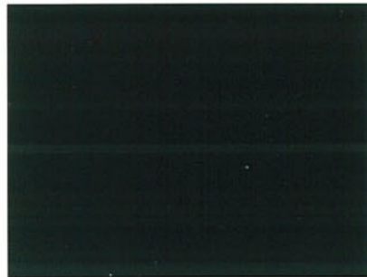
GRANADA BLACK PEARL