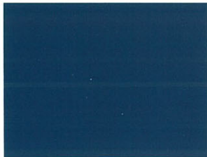
HARVARD BLUE PEARL