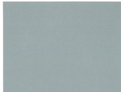
VOGUE SILVER METALLIC