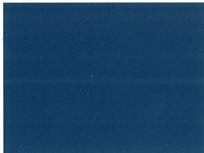
HARVARD BLUE PEARL