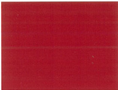
TORINO RED PEARL