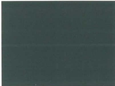
THUNDER GREY METALLIC