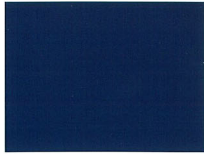
SUPER MARINE BLUE PEARL