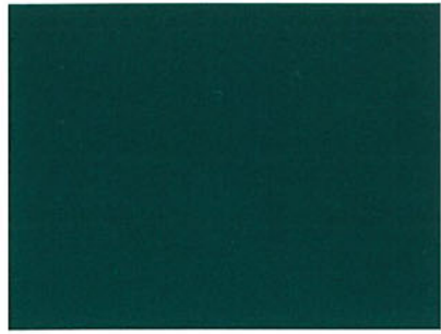
CYPRESS GREEN PEARL