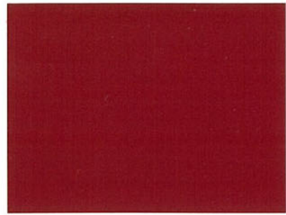
RUBY RED PEARL