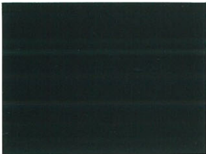
STARLIGHT BLACK PEARL