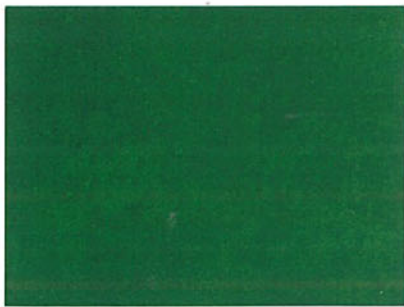
CLOVER GREEN PEARL