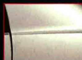
Satellite Silver (M) A69