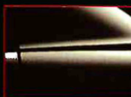
Pyrenees Black (P) X08