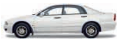
Mawson White \Delta \diamond \infty