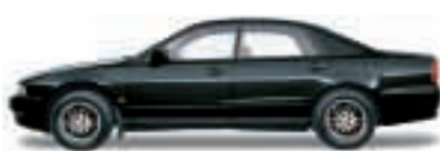
Sable (P) \Delta \diamond \infty