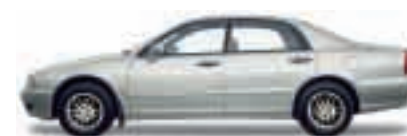
Kashmir (P) \Delta \infty