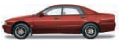
Burra (P) \Delta \infty