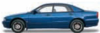
Sapphire Blue (P) \Delta \diamond \infty