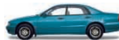
Pacific Blue (M) \Delta \diamond \infty