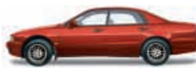
Sienna Red (M) \Delta \diamond \infty

\Delta Magna AWD \diamond Magna Sports AWD \infty Verada AWD. M = Metallic P = Pearlescent. Skirting and mirrors colour coded.