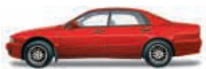
Flame Red \Delta \diamond \infty