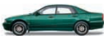
Daintree Green (P) \Delta \diamond \infty