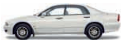
Cocoon White (P) \Delta \infty