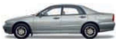
Pewter (M) \Delta \diamond \infty