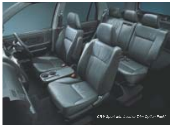
CR-V Sport with Leather Trim Option Pack*

The spacious cabin of the CR-V can accommodate everyone's needs. For instance, the driver has a commanding panoramic view of the road, the instrument panel is well laid out and easy to read at a glance, and the centre console has large, easy to adjust controls. Roomy seating allows passengers to relax in comfort and hold a conversation or listen to the 4 speaker stereo CD player in a well insulated quiet environment. Heat-blocking green glass and a powerful air conditioning system keeps all occupants comfortably cool.