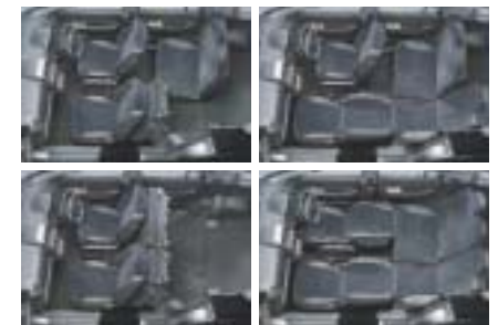
The new CR-V gives you a vast choice of ways to arrange seating and cargo space. For example, split 60:40 rear seats fold down separately so you can lower one or both rear seatbacks, or fold both away to create extra cargo space. Both front and rear seats recline fully and independently. You can also fold down the front and rear seats on one side of the cabin to accommodate long items. And all seating positions can be altered in seconds.

With Sport models you can also choose a new level of luxury and elegance with the Leather Trim Option Pack*. Supple leather abounds throughout the interior. From the orthopedically contoured heated bucket seats to the steering wheel to the door inserts.