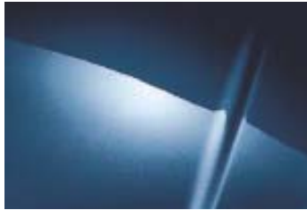
ETERNAL BLUE PEARL*