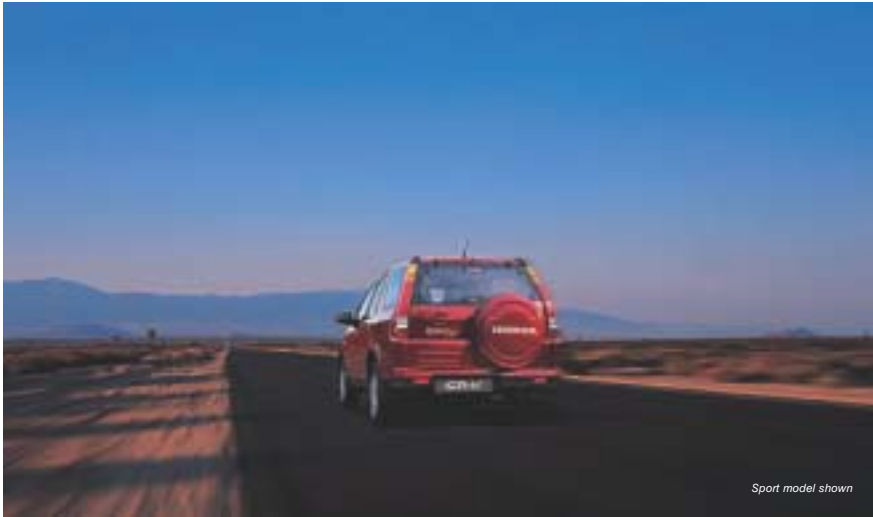
Sport model shown

At Honda, providing the world's finest after sales service is just as important as building the world's finest cars. So, as a new CRV owner, you're entitled to access our exclusive after sales website, HondaONE. Updating you with an on-line service history, personalised service reminders and vehicle maintenance tips, HondaONE allows you to view your vehicle records with the simple click of a mouse button.