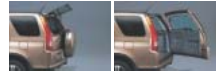
The two-way tailgate is an open and shut matter of convenience.