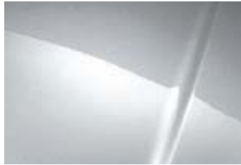
SATIN SILVER METALLIC*