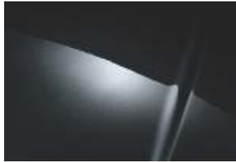
NIGHTHAWK BLACK PEARL*