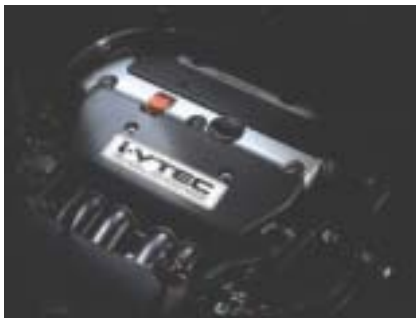
To create the revolutionary i-VTEC engine, Honda combined Valve Timing Control (VTC) – which allows the camshaft timing to be varied on all engine speeds for smoother, stronger acceleration, with the renowned performance of VTEC engineering. (VTEC electronically switches valve timing and valve lift to match low and high speed ranges). It is this unique combination of VTC and VTEC technologies that provides an ideal balance of high power and fuel economy with excellent emissions control.