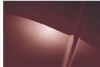
CHIANTI RED PEARL*