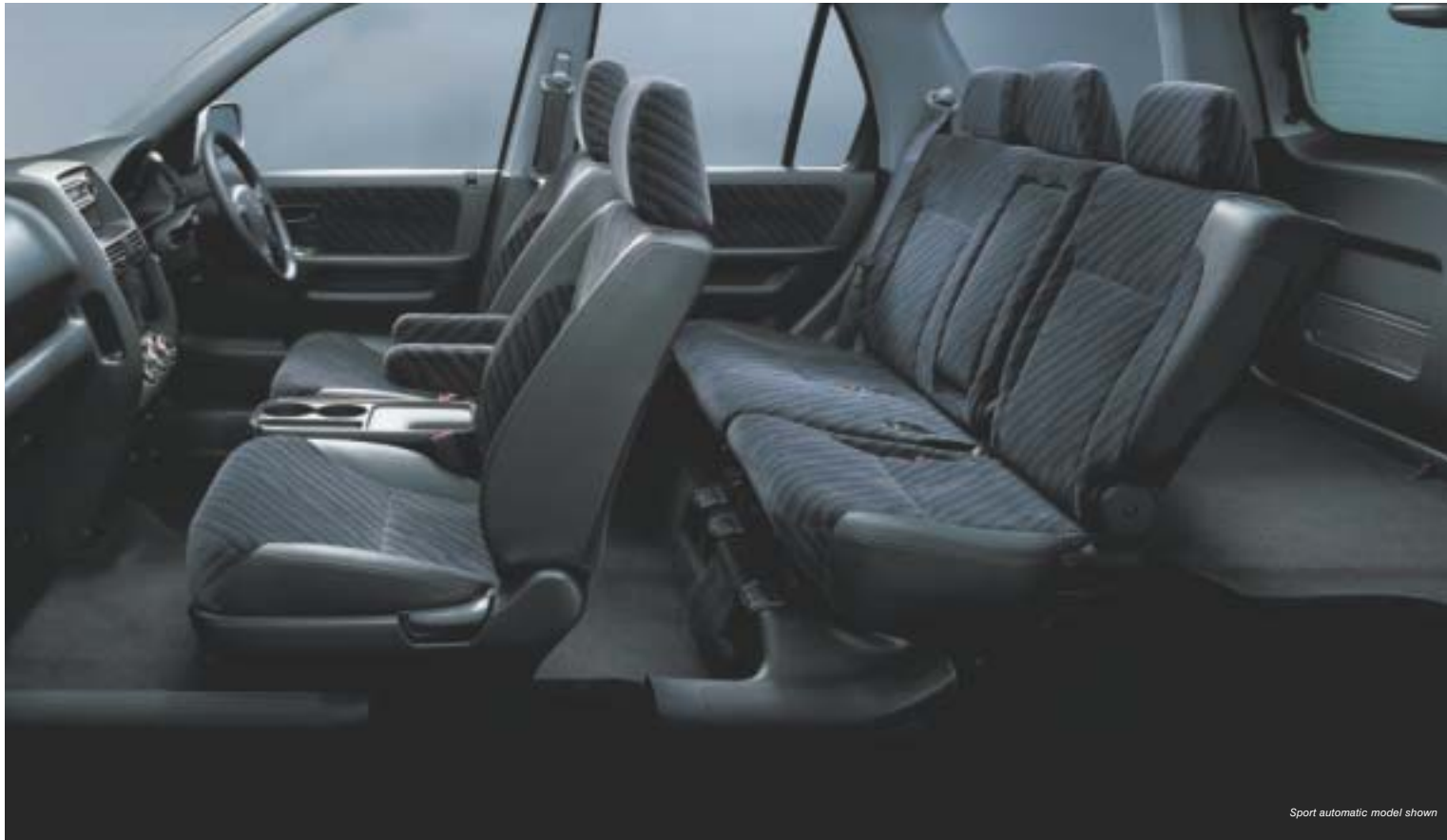
Sport automatic model shown