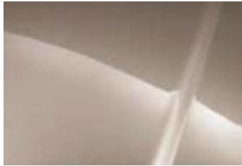
MOJAVE MIST PEARL*