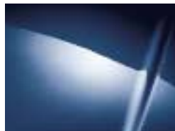
ETERNAL BLUE PEARL