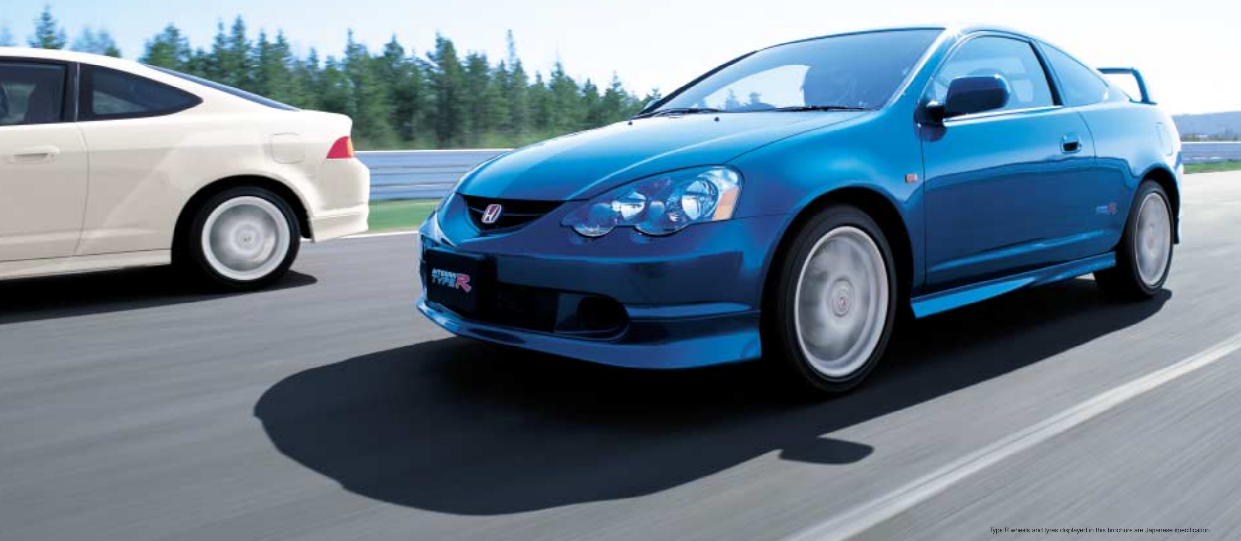
Type R wheels and tyres displayed in this brochure are Japanese specification.