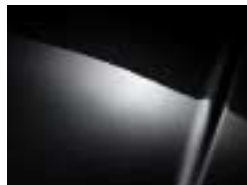
NIGHTHAWK BLACK PEARL