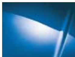
ARCTIC BLUE PEARL