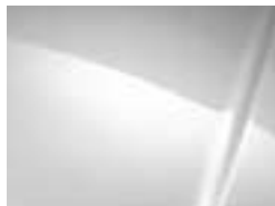
SATIN SILVER METALLIC