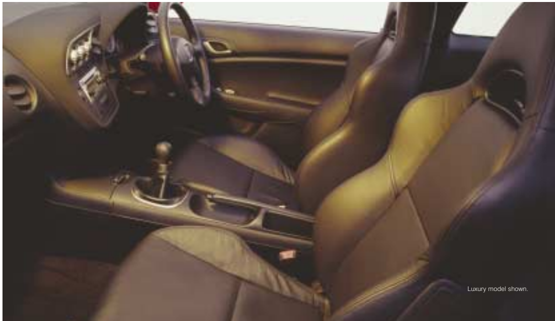
Luxury model shown.