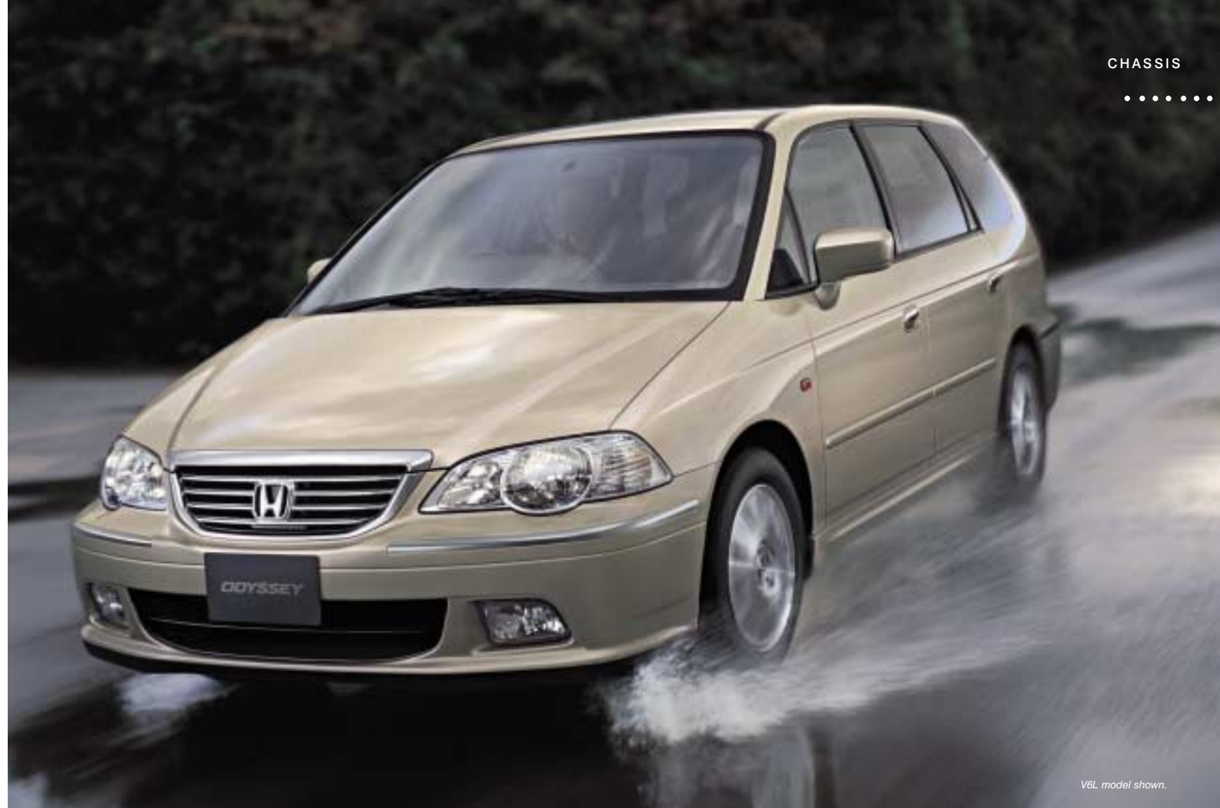
V6L model shown.