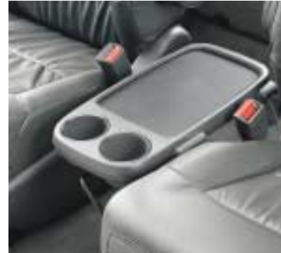
The driver and front passenger share a convenient fold-up tray with a non-slip surface.