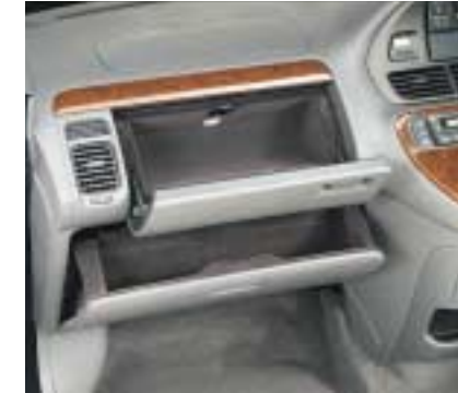
Personal space abounds, with a large dual-level glove box, ample cupholders, and plenty of pockets for large or small gear.