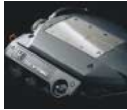
The 3.0 litre V6 SOHC-VTEC engine rules the road with high power, high efficiency and low emissions. While the sporty 2.3 litre 4 cylinder SOHC-VTEC engine reflects the evolution of super-efficiency, low emissions and high enjoyment.

The exhilaration of high-performance driving is an unforgettable experience. Honda determined to bring this incomparable feeling of irresistible power and command to the new Odyssey. At low or high speeds... in city streets or on highways...whatever the conditions, the Odyssey delivers peerless performance beyond your wildest expectations. Honda's V6 or 4 cylinder VTEC engines offer a rare combination of high energy and efficiency from low to high rpm. The net result is aggressive acceleration, exceptional fuel economy, low emissions and virtually silent running.