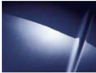
INDIGO BLUE PEARL