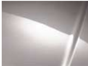
SIGNET SILVER METALLIC