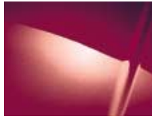
ROYAL RUBY RED PEARL