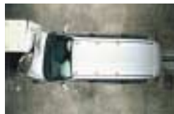
G-Force Control in action Computer-designed and reinforced through extensive crash testing, the Odyssey's monocoque body helps control gravity forces generated by a collision.

Just as Honda pursues high performance for your pleasure, we seek the most advanced safety and environmental protection for your conscience. Because we recognise that nothing is more important than the safety of your passengers.