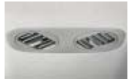
Powerful dual air conditioning provides rear overhead vents and independent controls.