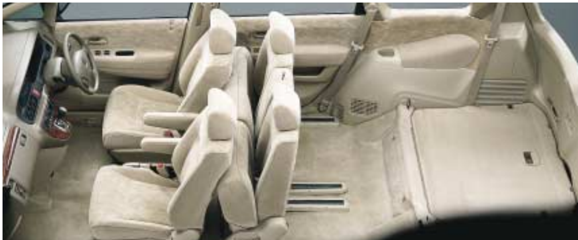
The third row 'sofa' retracts into the floor for flat cargo space. The spare tyre is underneath.