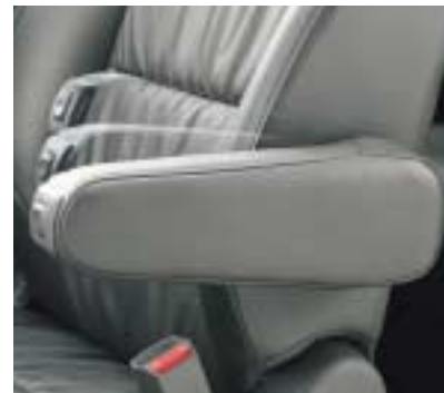
Front and second row seats all have adjustable arm-rests for extra comfort. (V6 and V6L model only.)