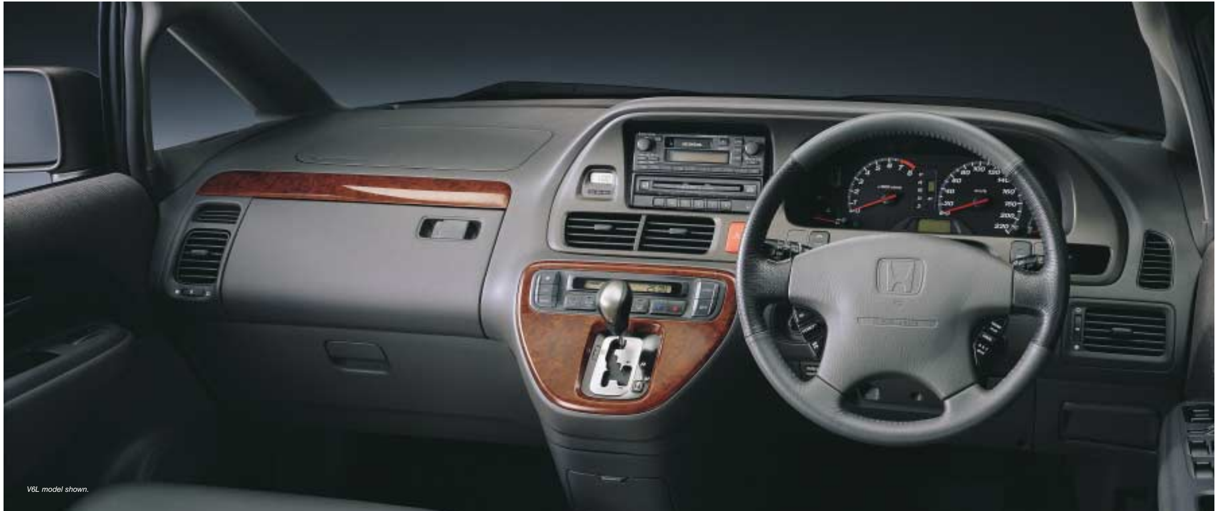
V6L model shown.