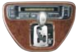
The race-bred S-Matic gear lever is mounted on the instrument console panel rather than the floor or steering column for superior driver comfort and control.

simple-to-operate controls. Switch to Cruise Control - standard on both models - and let the Odyssey become the pilot while you enjoy your cockpit. The whole atmosphere is one of elegance and refinement. From the rich walnut woodgrain trim to the leather-covered steering wheel (V6 and V6L) and vanity mirrors, the new Odyssey really is a driver's car disguised as a passenger vehicle.