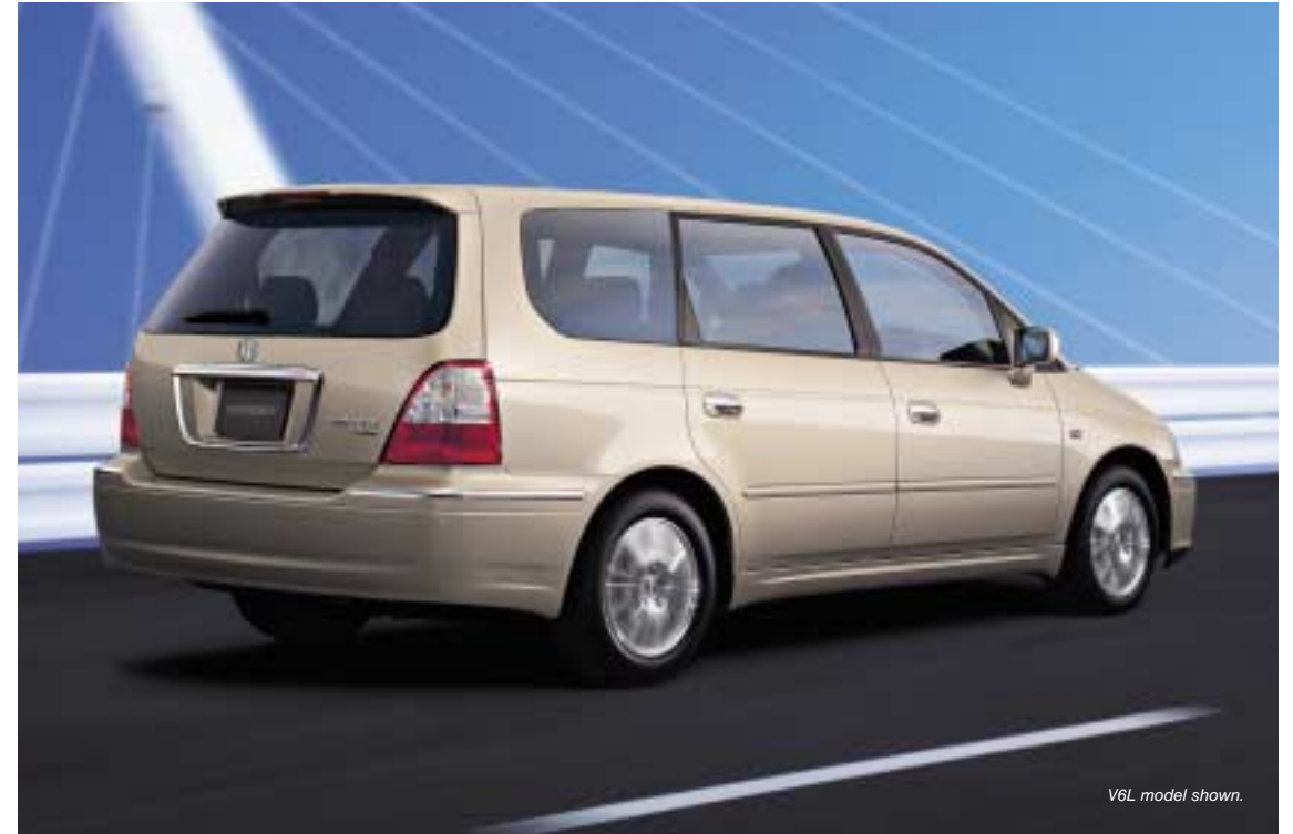
V6L model shown.