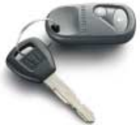
Remote keyless entry locks for all doors and the boot.

Leather trim is only available in V6L model.