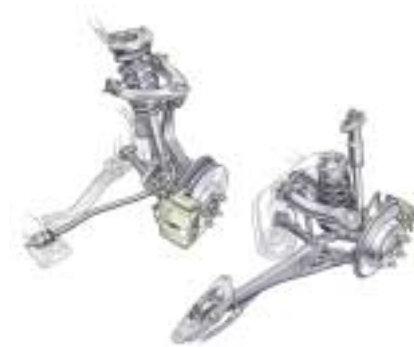
A newly refined four-wheel double wishbone suspension (including a 5-link rear configuration) contributes to a superb ride, smooth handling and great stability. A low centre of gravity increases linear and cornering control.

and secure driveability. Similarly, its distinctive rear aspect and brilliant rear lights show painstaking attention to premium styling and safety protection. Streamlined in its exterior proportions, expansive in its cabin dimensions, the Odyssey truly exemplifies our insistence on effortless handling. Every element of polished performance - assured footwork, agile manoeuvrability, turning ease, precision braking control and cabin tranquillity - contributes to peace of mind and lasting pride of ownership.