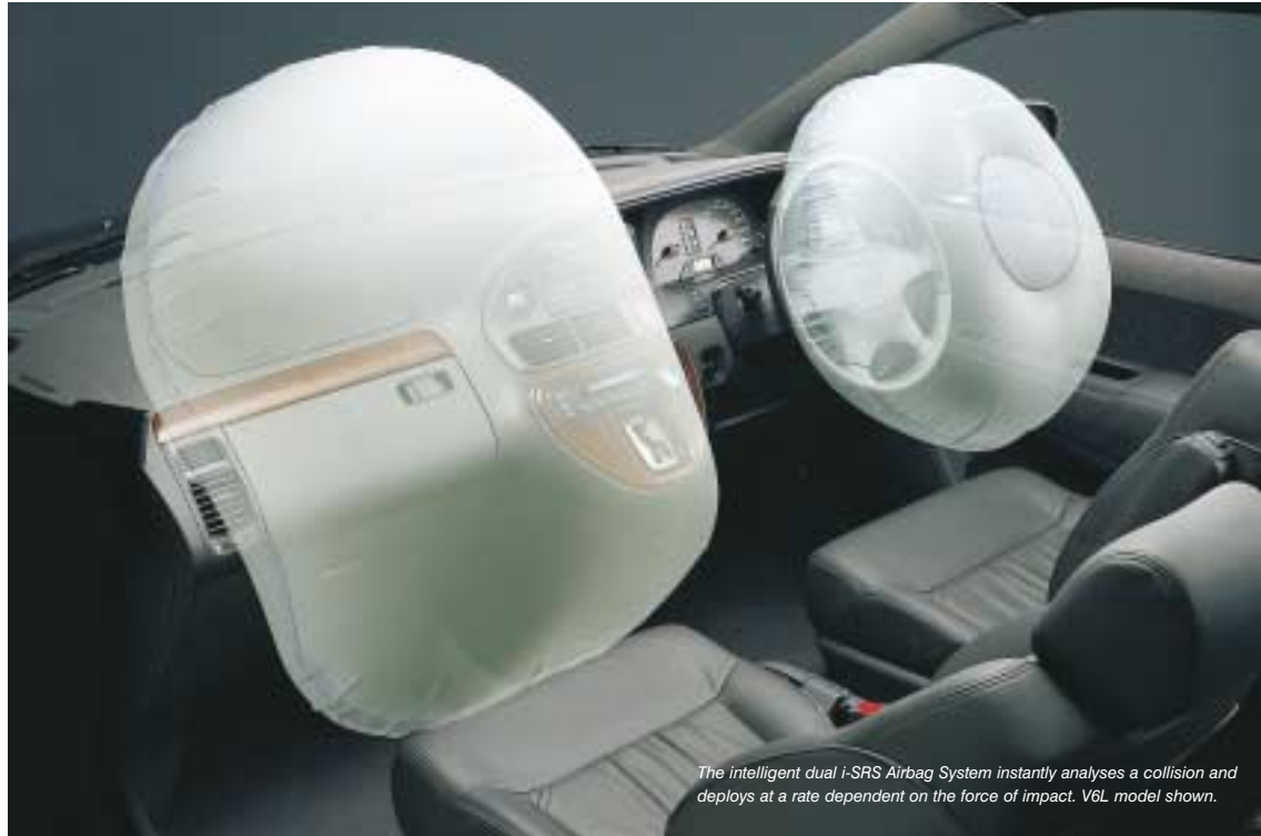
The intelligent dual i-SRS Airbag System instantly analyses a collision and deploys at a rate dependent on the force of impact. V6L model shown.