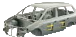
From its highly rigid reinforced frame to its strengthened tailgate, the new Odyssey is engineered for solid driveability and near-silent running.