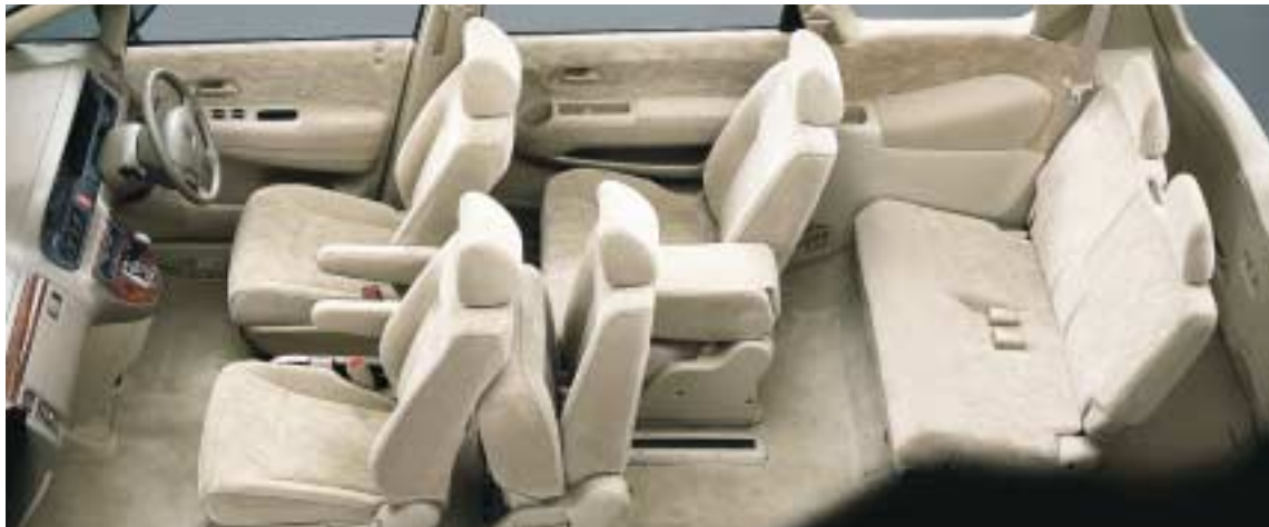
'Easy chairs' in the second row slide separately for easy access and convenience.