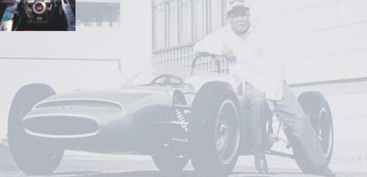
Cover: V6L model shown.