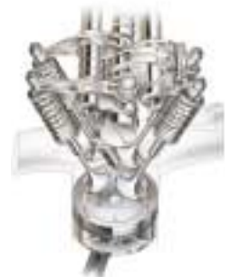
VTEC (Variable Valve Timing and Lift Electronic Control System) switches between two combustion environments - one for high torque in the low-to-mid-range rpm, the other for ultra-high power at high rpm. The result is responsive performance through the entire rpm range.

In addition, the Odyssey is equipped with recyclable parts and eco-friendly air conditioning. So it's apparent Honda's never-ending quest for technological improvement is also a search for a better, cleaner world.