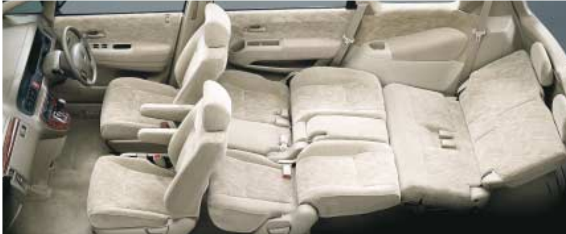
Making up a bed is easy. Simply fold down the seat backs in the second and third rows.