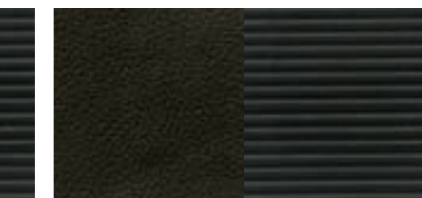
Black Leather interior