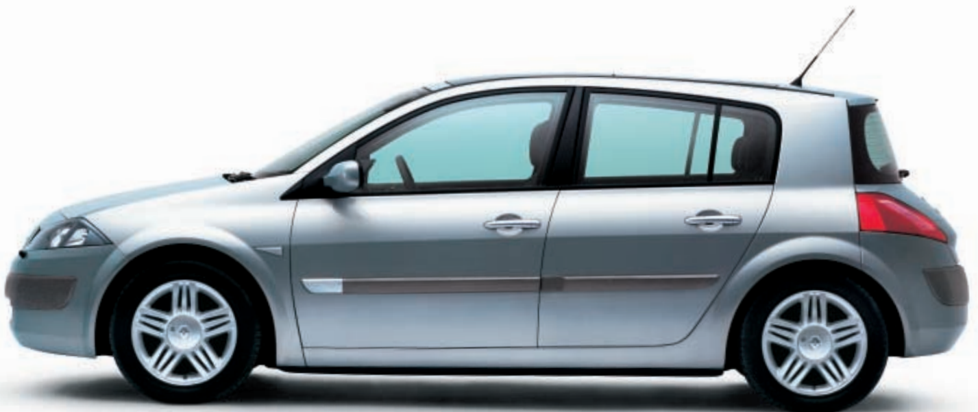
5 door Dynamique model shown.

Indeed, they knew what they were talking about, for within a year of being launched the Megane became the biggest selling range in Europe.