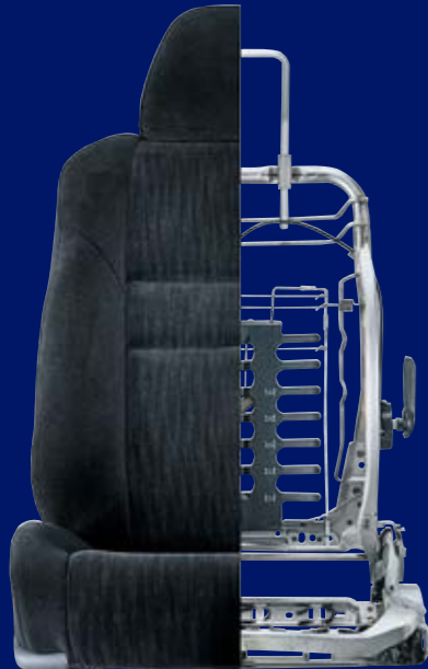
Driver's seat shown

Once you've experienced the comfort of the driver's (or passenger's) seat you'll feel like you may have been there before. The Accord Euro Luxury's advanced seat technology can be programmed to mould to your body shape - embracing you like it embraces corners. It pulls your hips into the seat for full spinal support and reduces shoulder and hip movement. To ensure the perfect driving posture, the armrest can even be adjusted to the nearest millimetre.