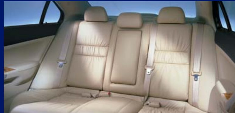
Above: Accord Euro Luxury's sumptuous leather interior* and woodgrain look trim console.