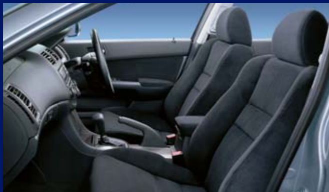
Left: Accord Euro with plush black cloth seats and metallic look console trim.

It's not just the Accord Euro's racing-inspired exterior that's sure to turn heads. It's also what's inside that will leave you (and your onlookers) lost for words.