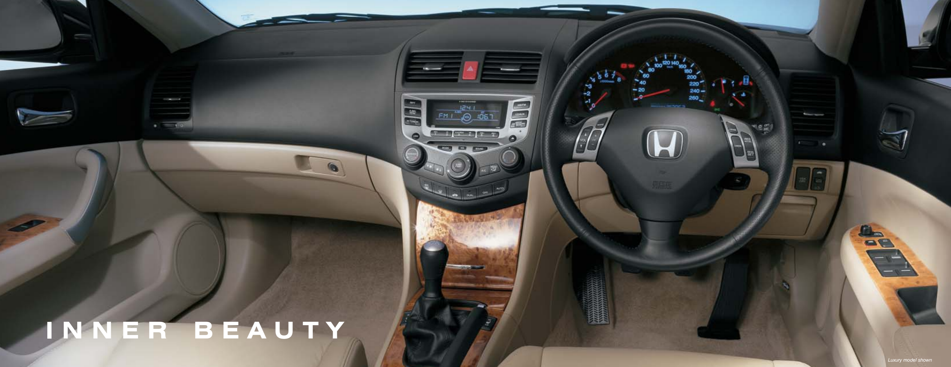
Luxury model shown