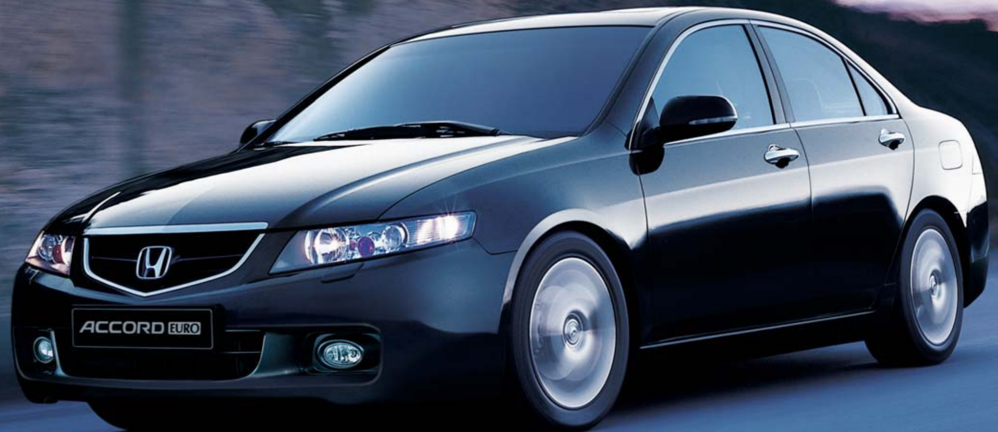
Luxury model shown

But it won't just be you who'll enjoy the ride. Your back seat drivers will enjoy more headroom, width and legroom and will experience a superior level of comfort and support.