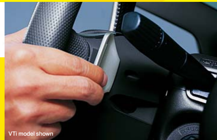
VTi model shown

Wherever you go in the Jazz, you're assured of superb performance, handling and stability – and the choice of two exciting engines. Press the accelerator and the GLi's four cylinder, fuel injected 1.3 L i-DSI (intelligent Dual and Sequential Ignition) engine responds with a surge of power. This engine generates 61 kW of power at 5700 rpm and maximum torque of 119 Nm at only 2800 rpm, which is great for city and highway driving.