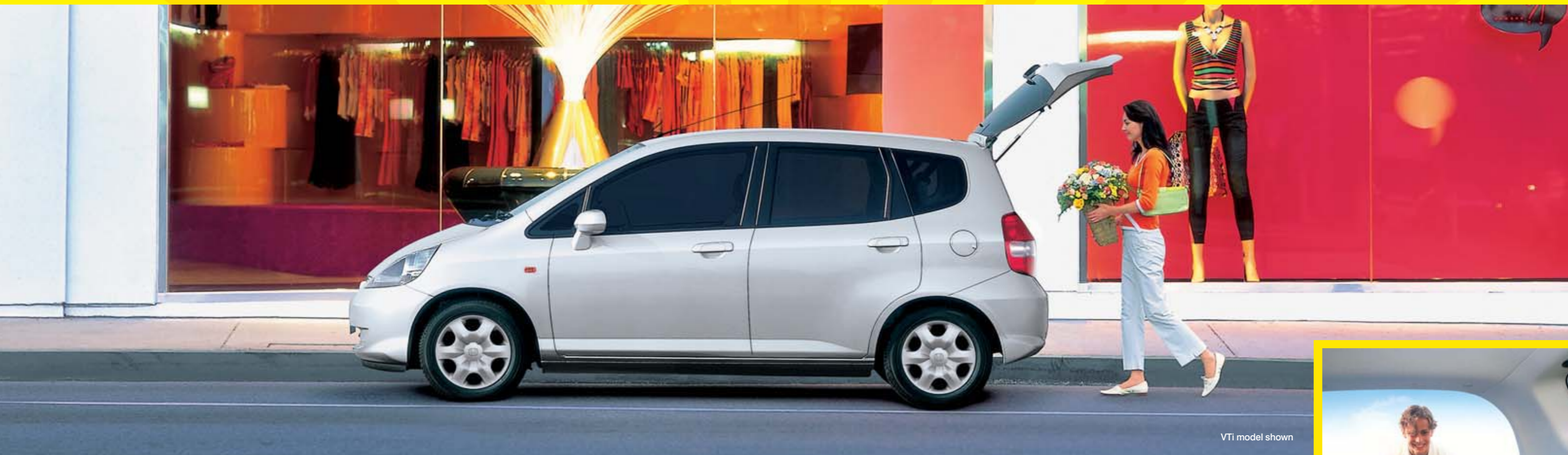
VTI model shown

When it comes to getting things moving, you can fit almost anything in a Jazz. With its revolutionary 'Magic Seat' system, you can open up a huge range of loading possibilities in seconds. With three seat configurations to choose from (utility, tall and long mode), a simple fold of a seat will see you transporting mountain bikes, suitcases or other bulky items in no time. Jazz in tall mode with the back seat cushion raised, creates enough