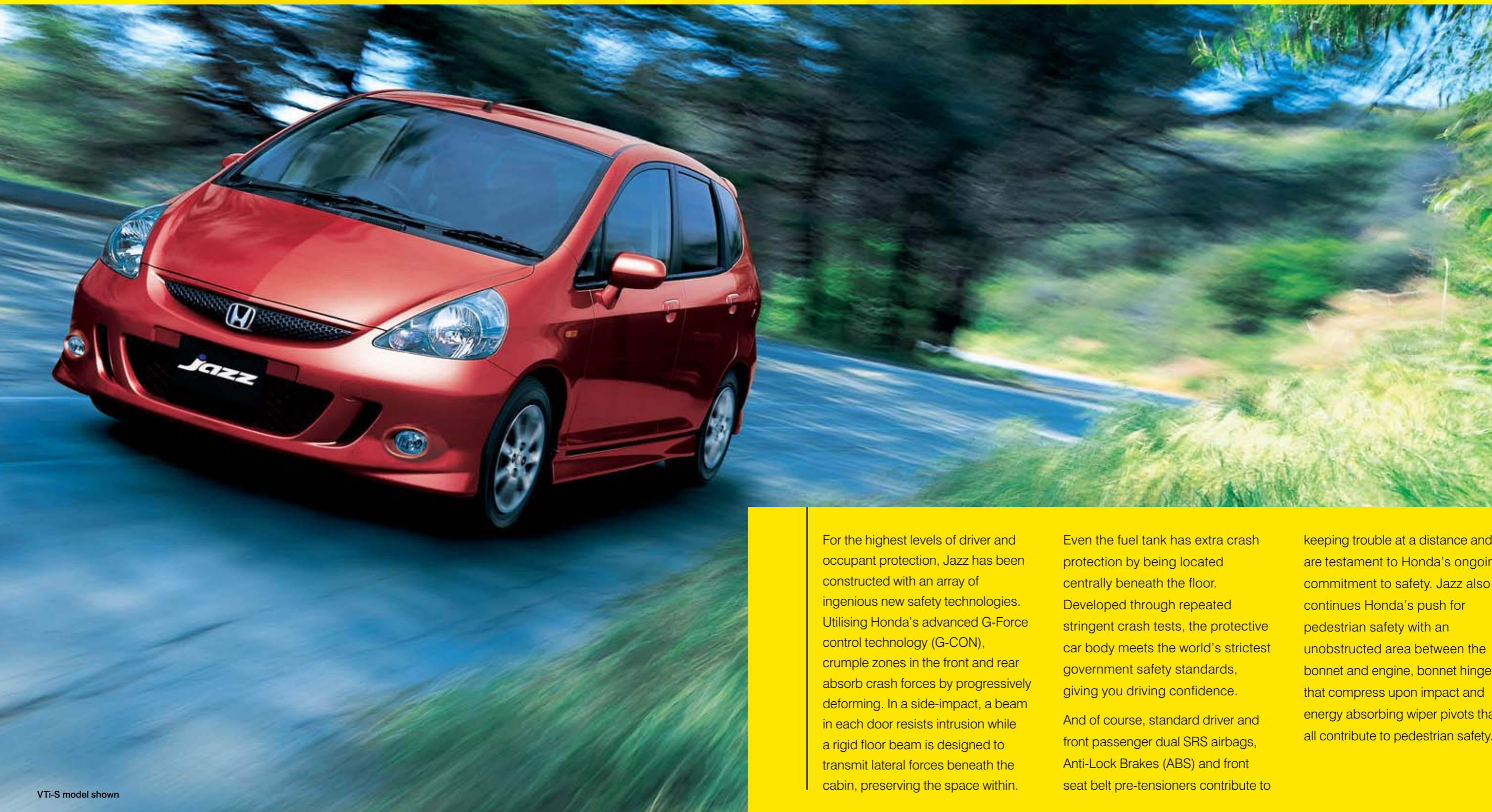
VTI-S model shown

For the highest levels of driver and occupant protection, Jazz has been constructed with an array of ingenious new safety technologies. Utilising Honda's advanced G-Force control technology (G-CON), crumple zones in the front and rear absorb crash forces by progressively deforming. In a side-impact, a beam in each door resists intrusion while a rigid floor beam is designed to transmit lateral forces beneath the cabin, preserving the space within.