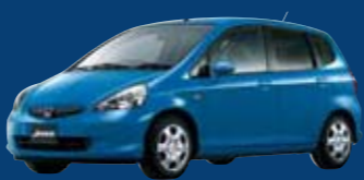
Sirius Blue Metallic†