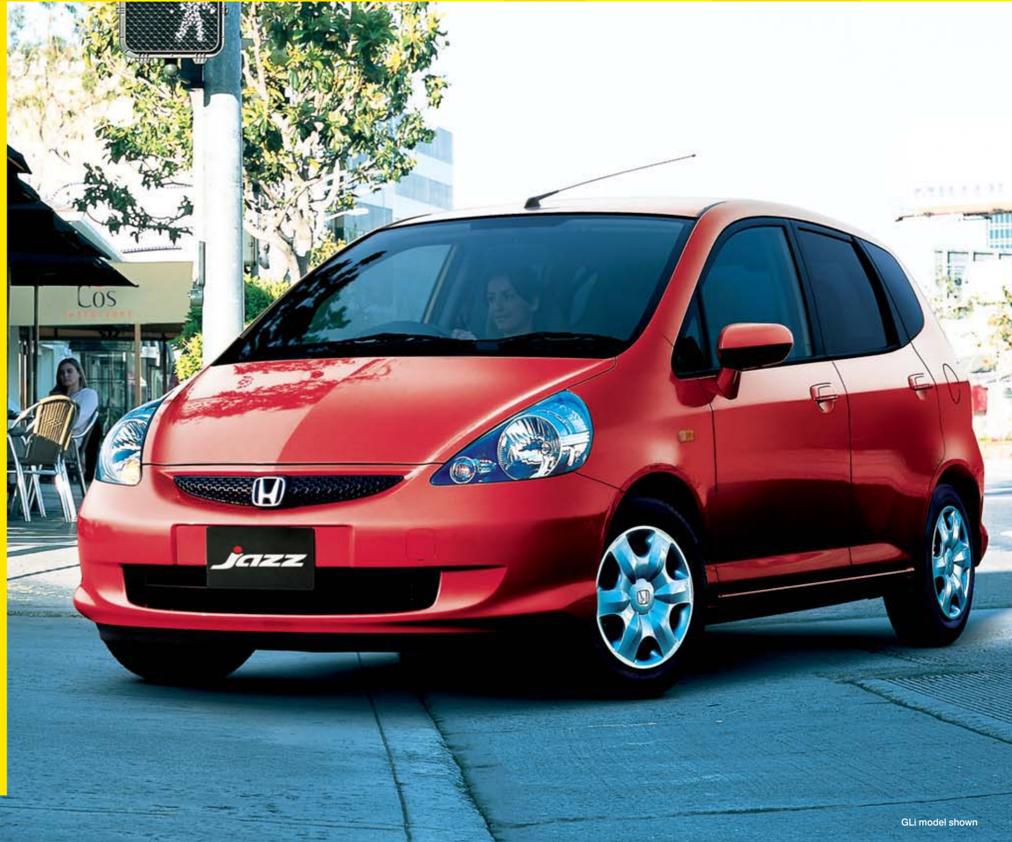
GLI model shown

Jazz's user-friendly cabin puts you in total control. Whether you're changing radio stations or operating the power windows and mirrors, you'll find everything is within arm's reach. Controls are firm to the touch and every surface has a solid, quality feel. And because a comfortable, relaxing interior creates a better driving experience, the Jazz is designed to be supremely quiet.