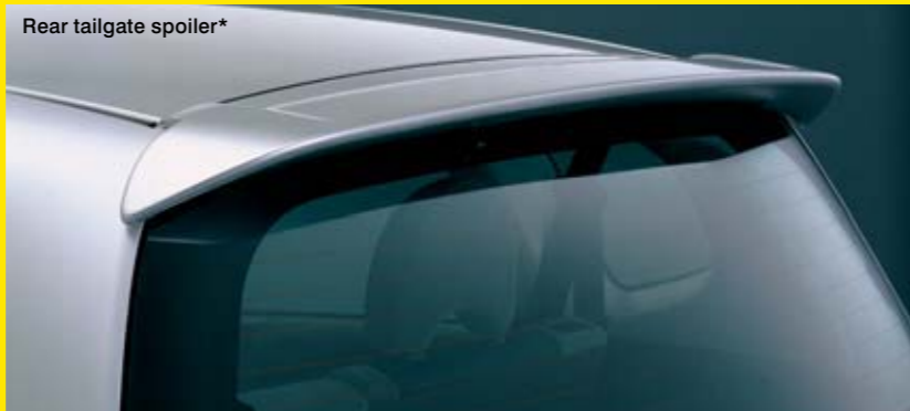
Rear tailgate spoiler*