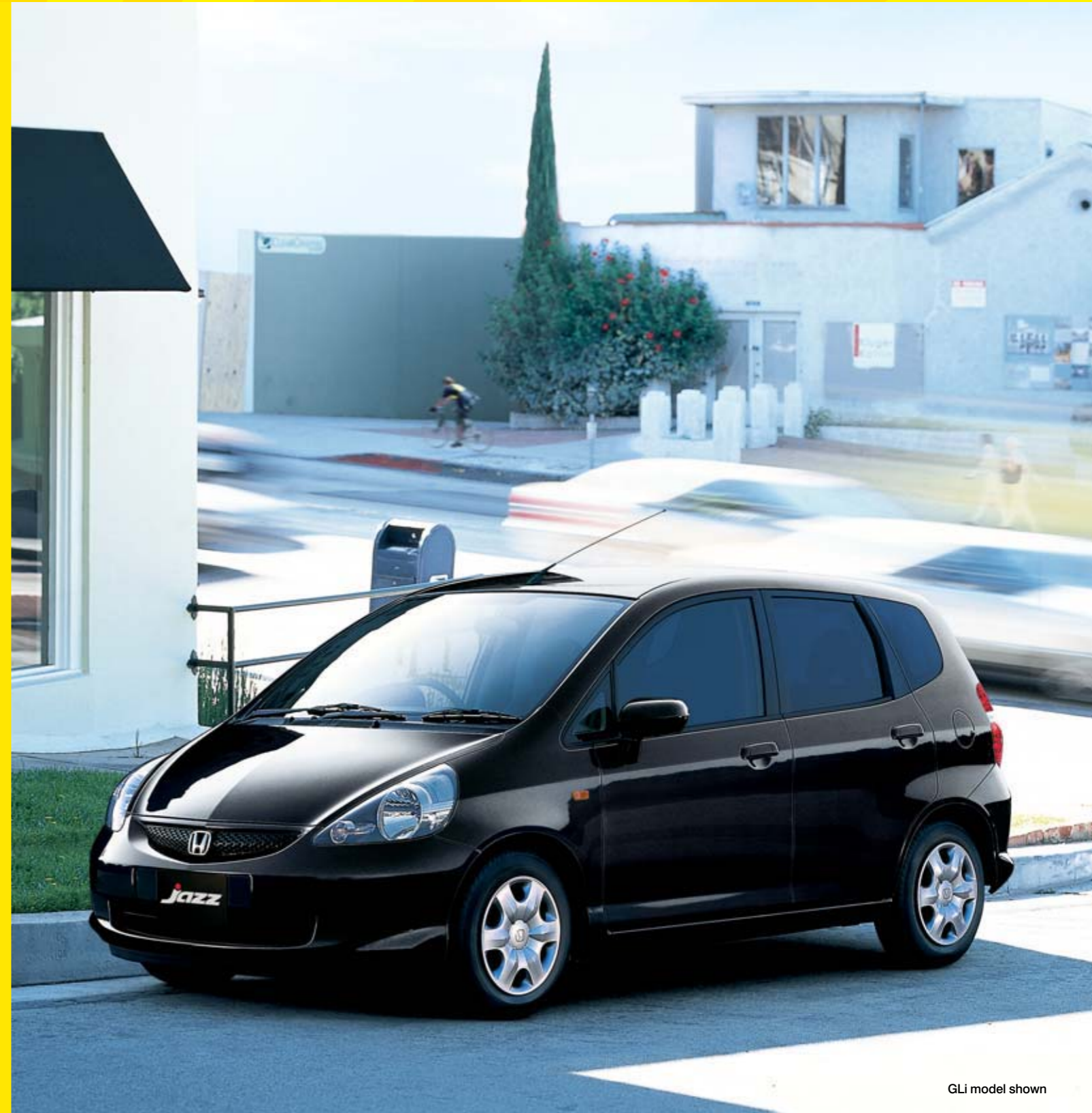
GLi model shown