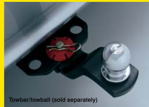
Towbar/towball (sold separately)