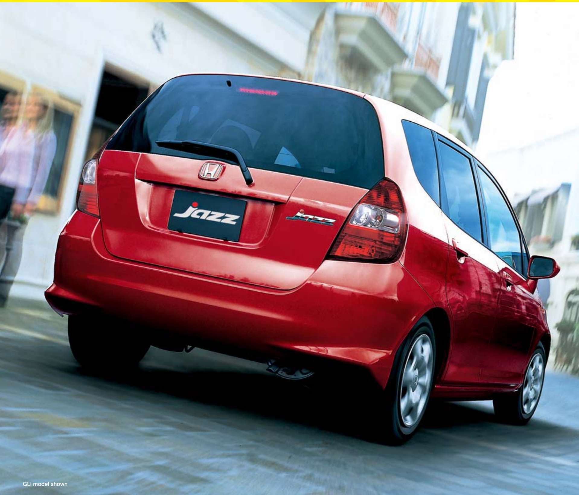
GLi model shown