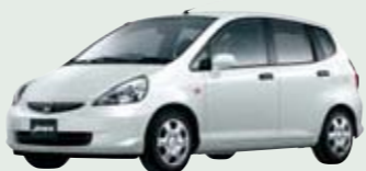
Satin Silver Metallic†