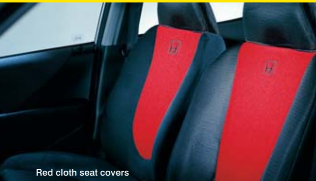
Red cloth seat covers