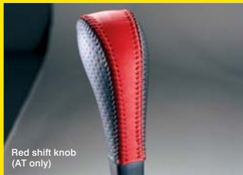
Red shift knob (AT only)