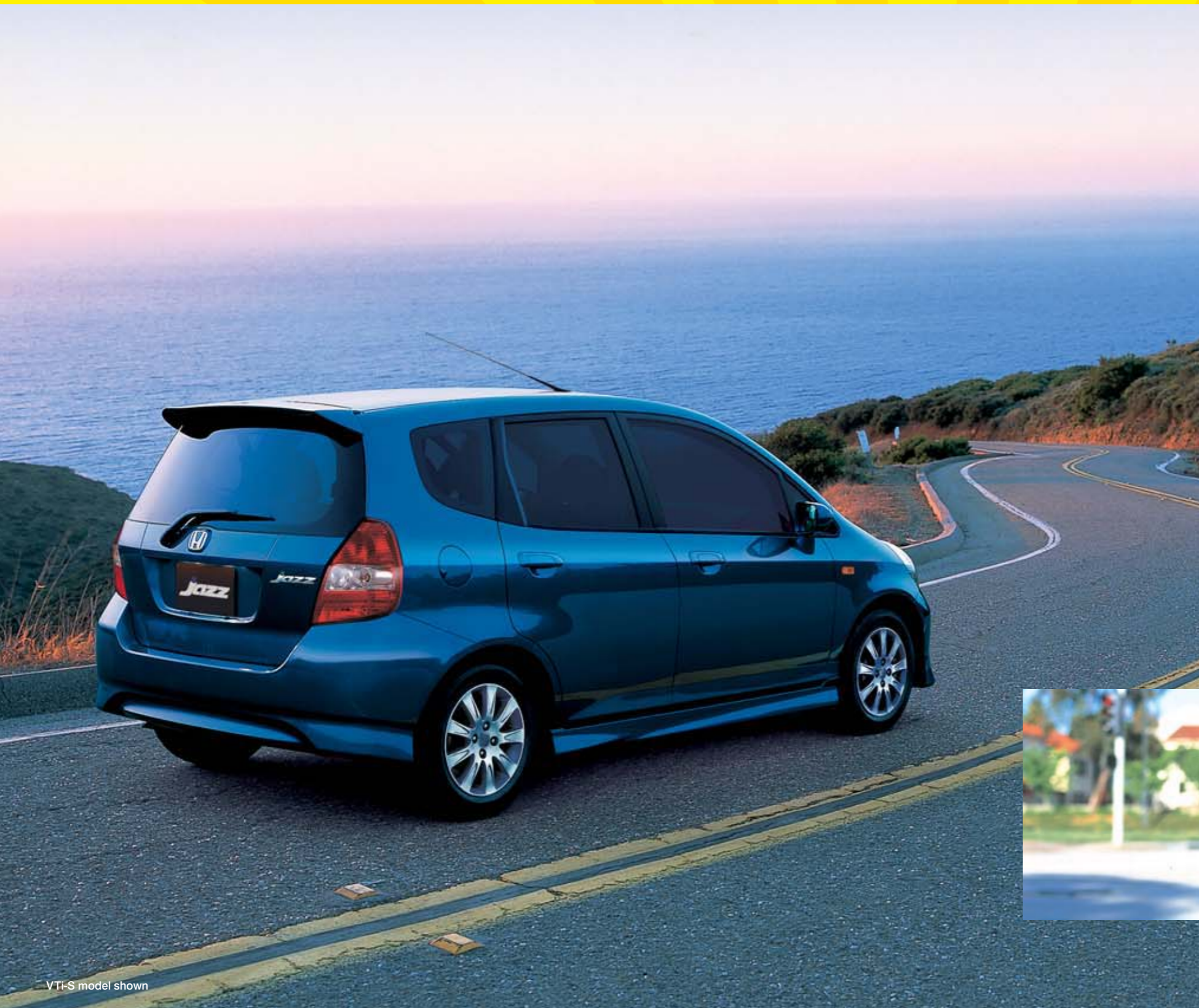
VTI-S model shown

The world's finest cars: the world's finest after sales service. The pride you'll feel in your new Jazz is one we feel as well. That's why we take just as much care building our Dealer network as we do building our cars.