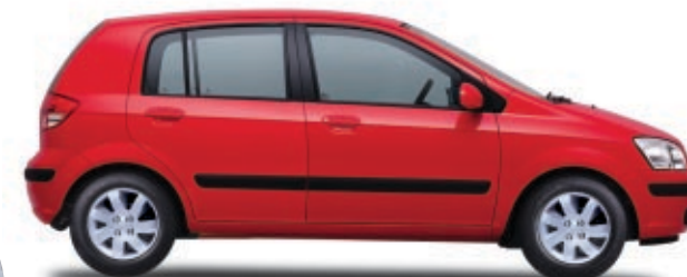
Hip Hop Red (Solid)