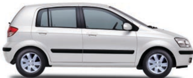
Noble White (Solid)