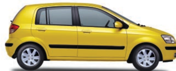
Vivid Yellow (Solid)

Current as at 1/4/2005. Part No: GETZ0205S Note: Car colours are indicative only and may vary due to the printing process. www.hyundai.com.au