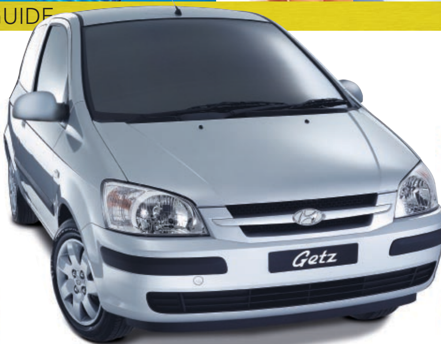
Clean Silver (Metallic)