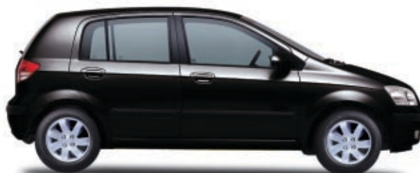
Ebony Black (Solid)