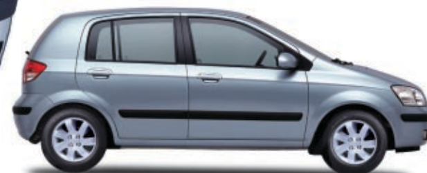
Celadon Blue (Mica)