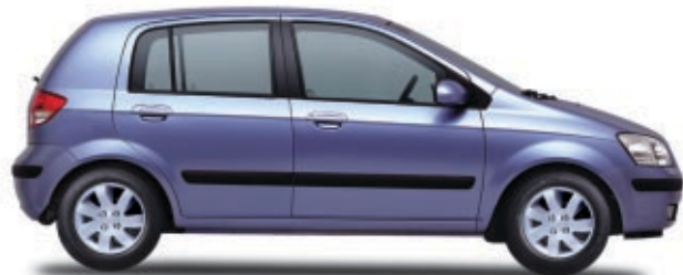
Lilac Blue (Metallic)