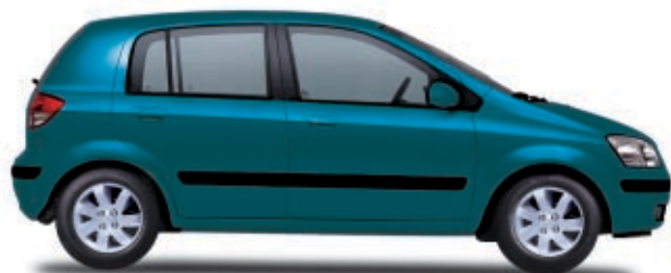
Sea Side Blue (Metallic)