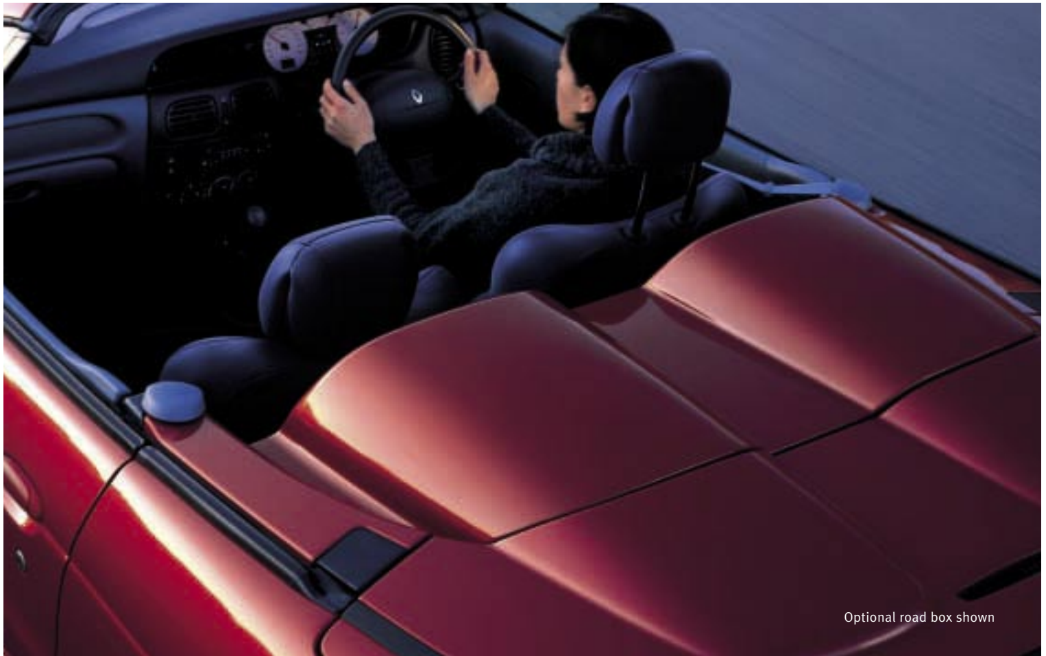
Optional road box shown

Should the eye-catching Megane happen to leave a pedestrian spellbound in its path, front wheel disc brakes and an Anti-lock Braking System (ABS), will help you steer clear of trouble. MacPherson Strut front suspension and four torsion bar rear suspension will straighten out the most challenging bends. What's more, so your eyes remain tuned to the road and not the radio, the audio system is operable from the steering column, using Satellite Audio Controls.