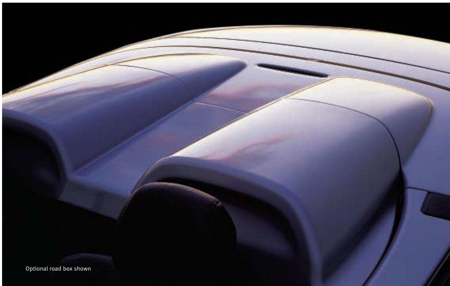
Optional road box shown

There's no denying the Megane is an impressive visual package, but with the optional Road Box (below) in place, it makes an already attractive ensemble, even more appealing. From a four-seater cabriolet, it converts into a classic, two-seat roadster. Not only does the Road Box dramatically change the car's appearance, it also creates an exceptionally large and secure storage area.