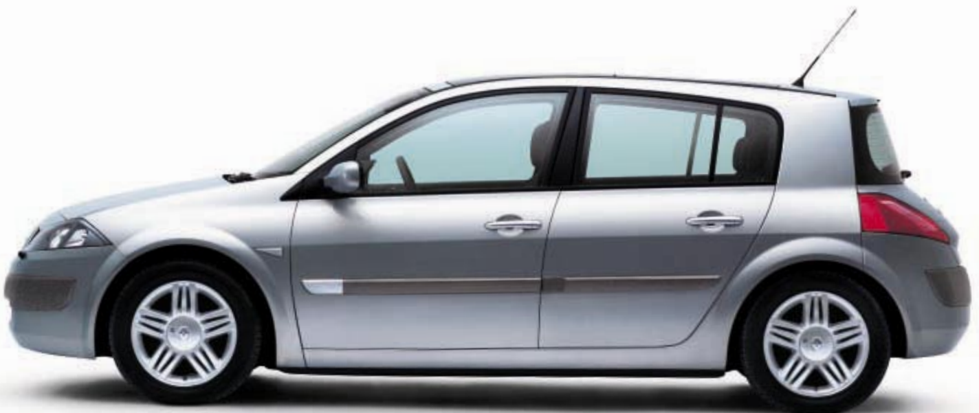
5 door Dynamique model shown.

Indeed, they knew what they were talking about, for within a year of being launched the Megane became the biggest selling range in Europe.