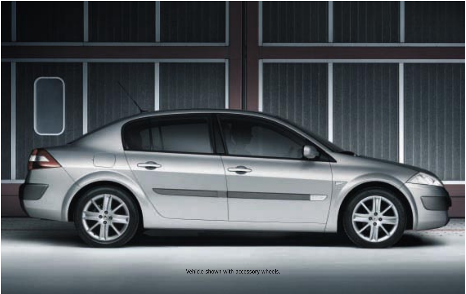
Vehicle shown with accessory wheels.

Or, less critically but aesthetically important nonetheless, why can't a handbrake look like an aircraft throttle control? So, after more than a century of automotive innovations, the new Megane Sedan sets new benchmarks in design, style, pleasure and safety.