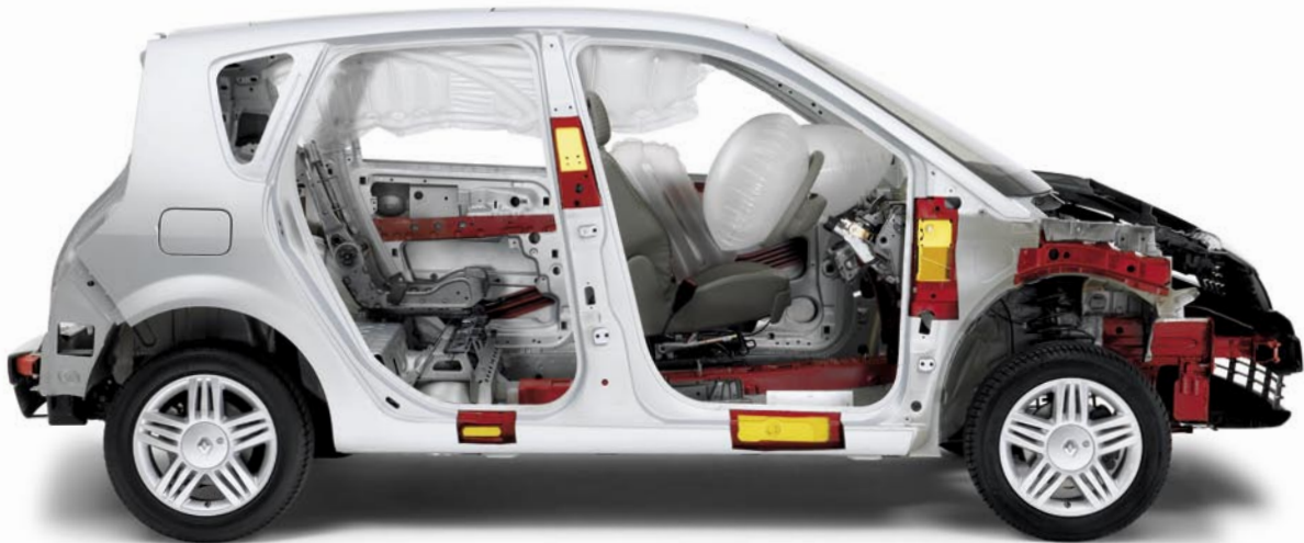
Wheels shown not available.

Renault is the industry leader in automotive safety, a claim endorsed by the fact that Renault has more cars with a five star safety rating for impact protection in independent EuroNCAP crash tests than any other manufacturer. At time of printing, the new Scenic is one of seven Renault vehicles with a five star safety rating.