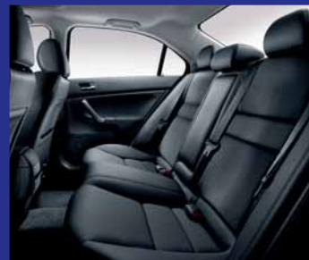
Above: Accord Euro Luxury's woodgrain look console trim and sumptuous leather interior. Right: Accord Euro with plush black cloth seats and metallic look console trim.

It's not just the Accord Euro's racing-inspired exterior that's sure to turn heads. It's also what's inside that will leave you (and your onlookers) lost for words.