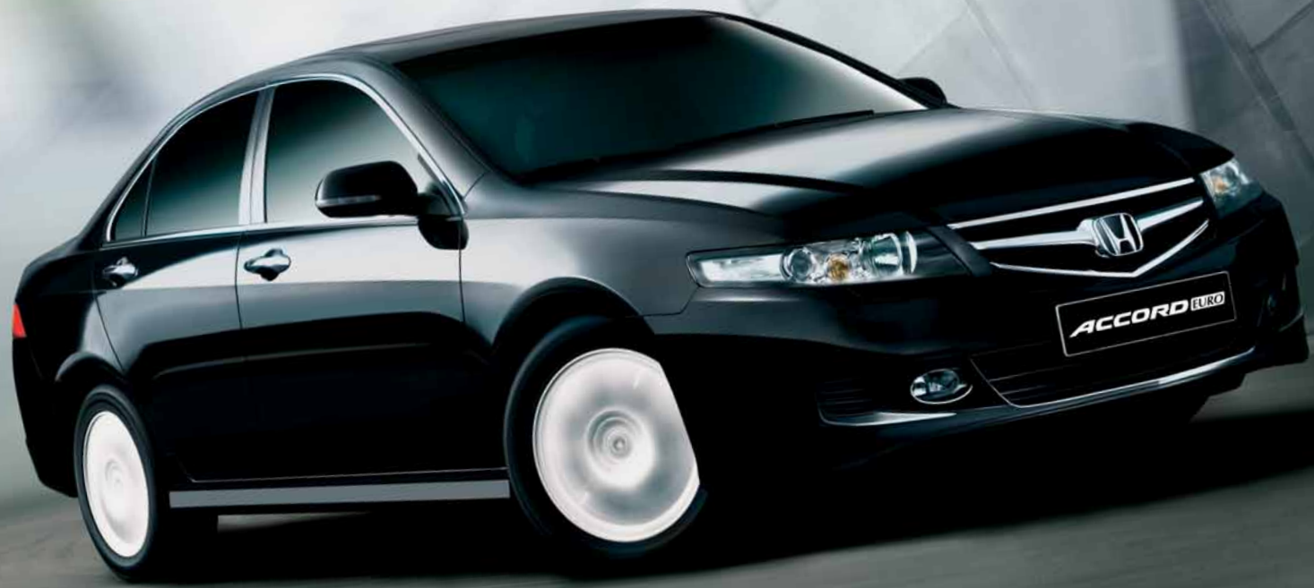
Luxury model shown

But it won't just be you who'll enjoy the ride. Your back seat drivers will enjoy more headroom, width and legroom and will experience a superior level of comfort and support.