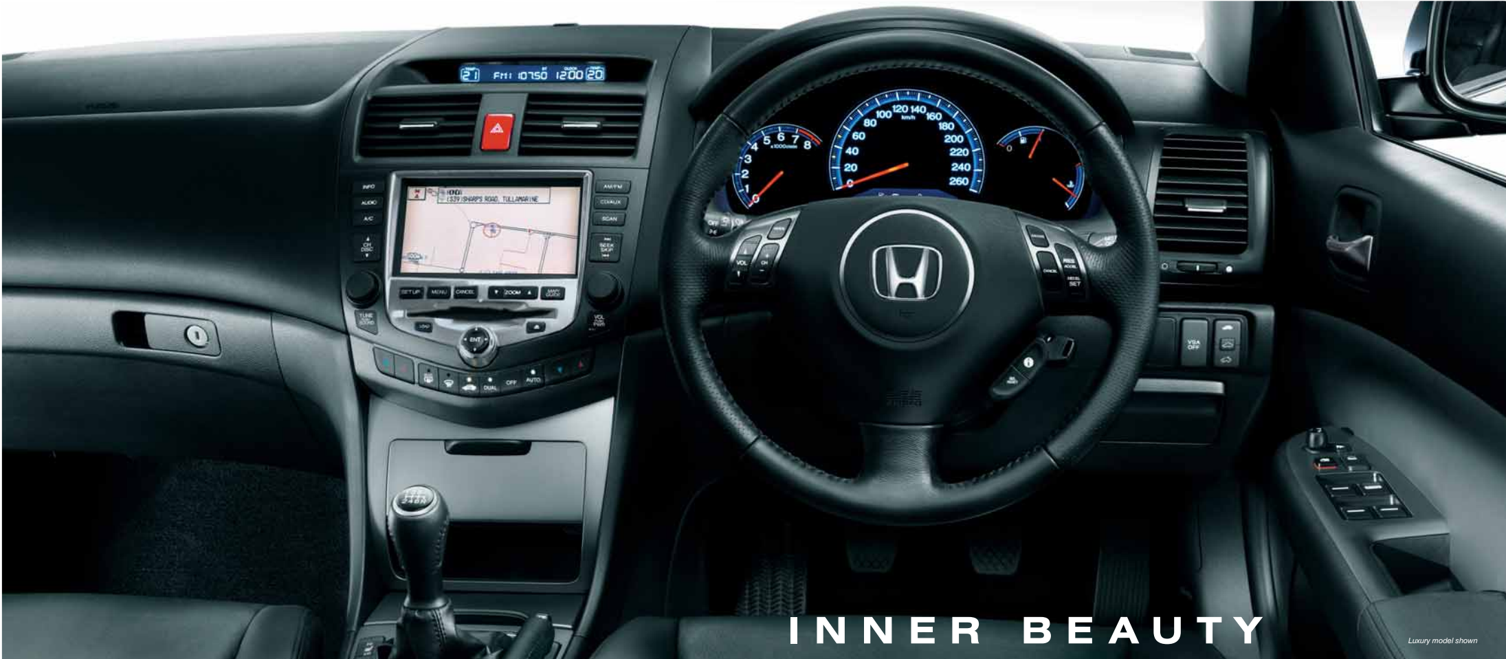
Luxury model shown