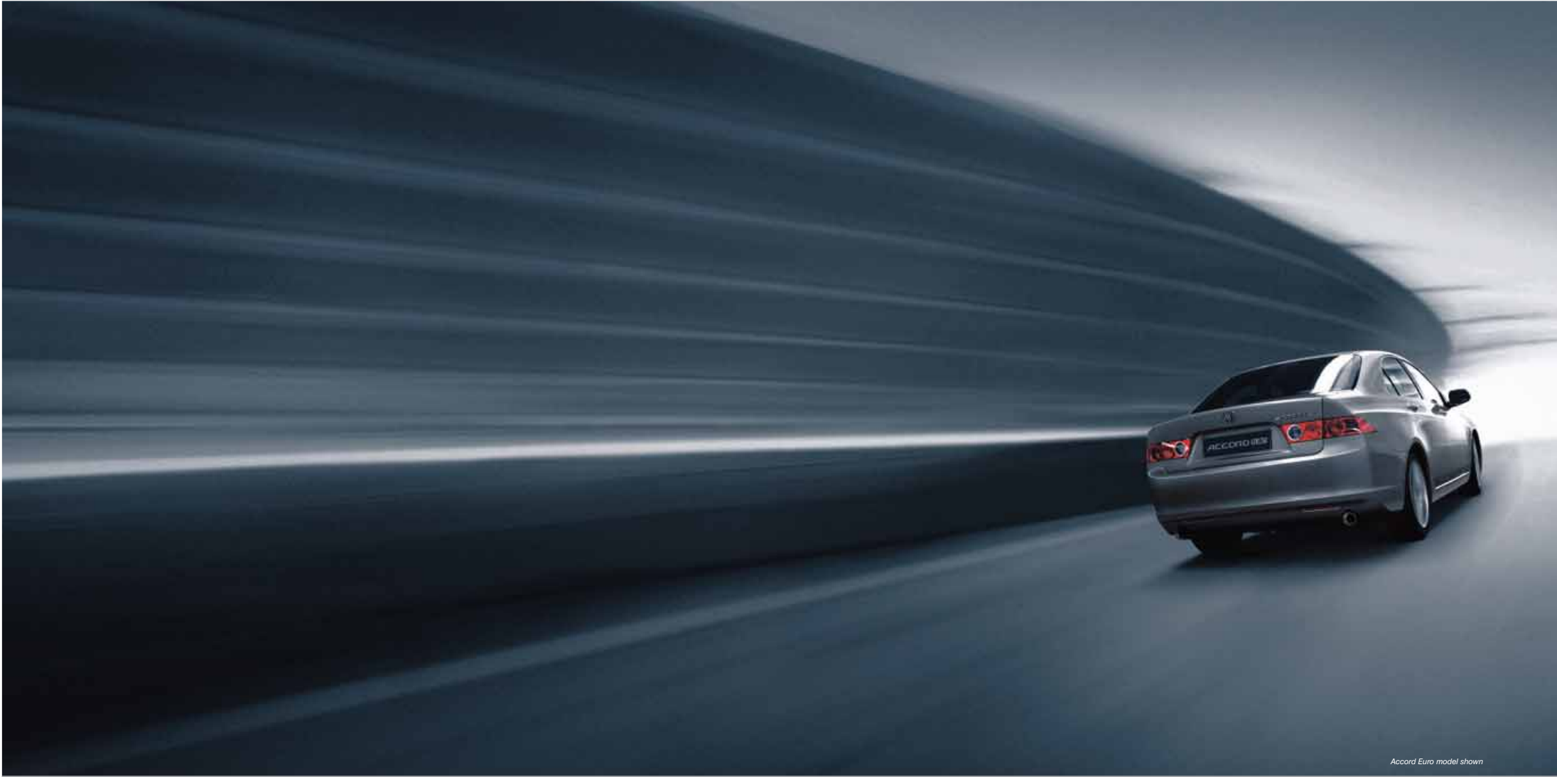
Accord Euro model shown

Electronic Throttle Control System (ETCS) is the name Honda has given to drive-by-wire technology. Adapted from Honda's NSX Supercar, this system replaces the conventional throttle cable with an all-electronic system that's able to monitor pedal position, throttle position, vehicle speed, engine speed, calculated road slope, corner radius and engine vacuum.