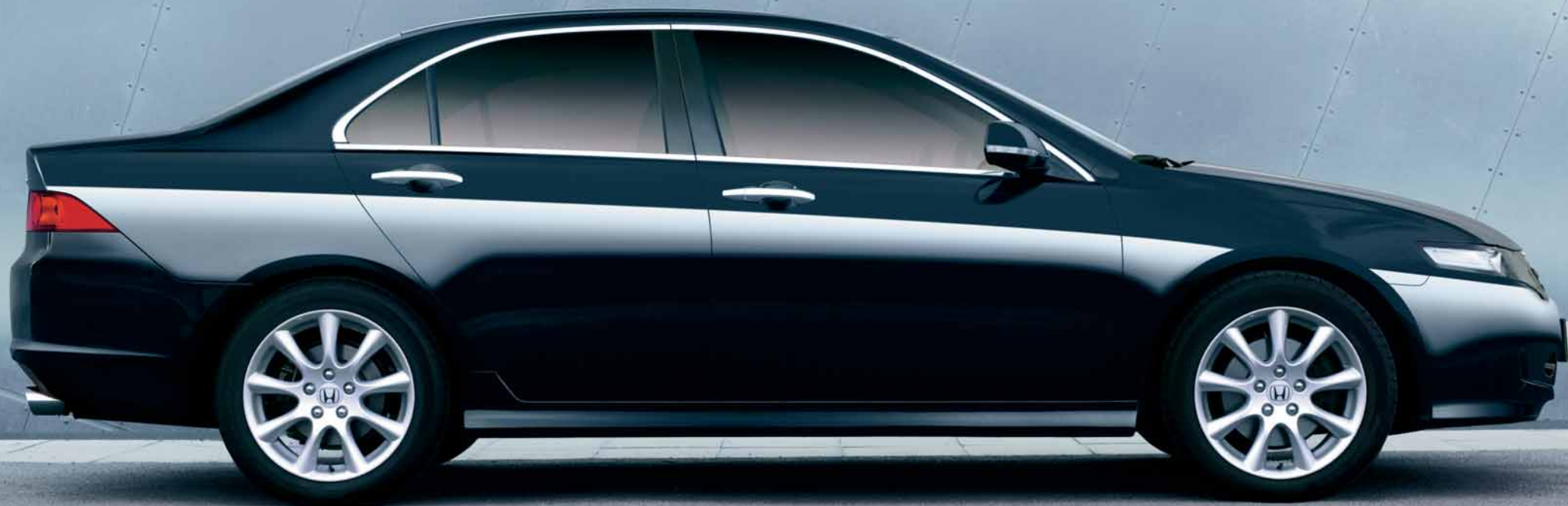
Luxury model shown

Even the best car in the world is worth nothing without the support to maintain it at its peak performance.