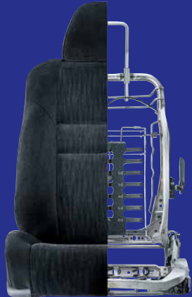
Driver's seat shown

Once you've experienced the comfort of the driver's (or passenger's) seat you'll feel like you may have been there before. The Accord Euro Luxury's advanced seat technology can be programmed to mould to your body shape - embracing you like it embraces corners. It pulls your hips into the seat for full spinal support and reduces shoulder and hip movement. To ensure the perfect driving posture, the armrest can even be adjusted to the nearest millimetre.