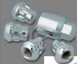
11/ Lock nuts Security for your alloy wheels.