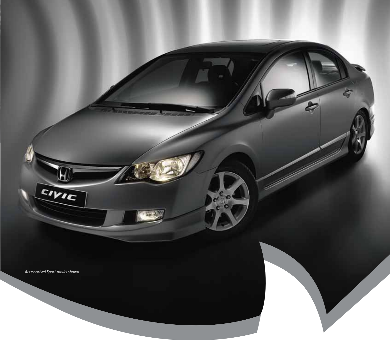
Accessorised Sport model shown