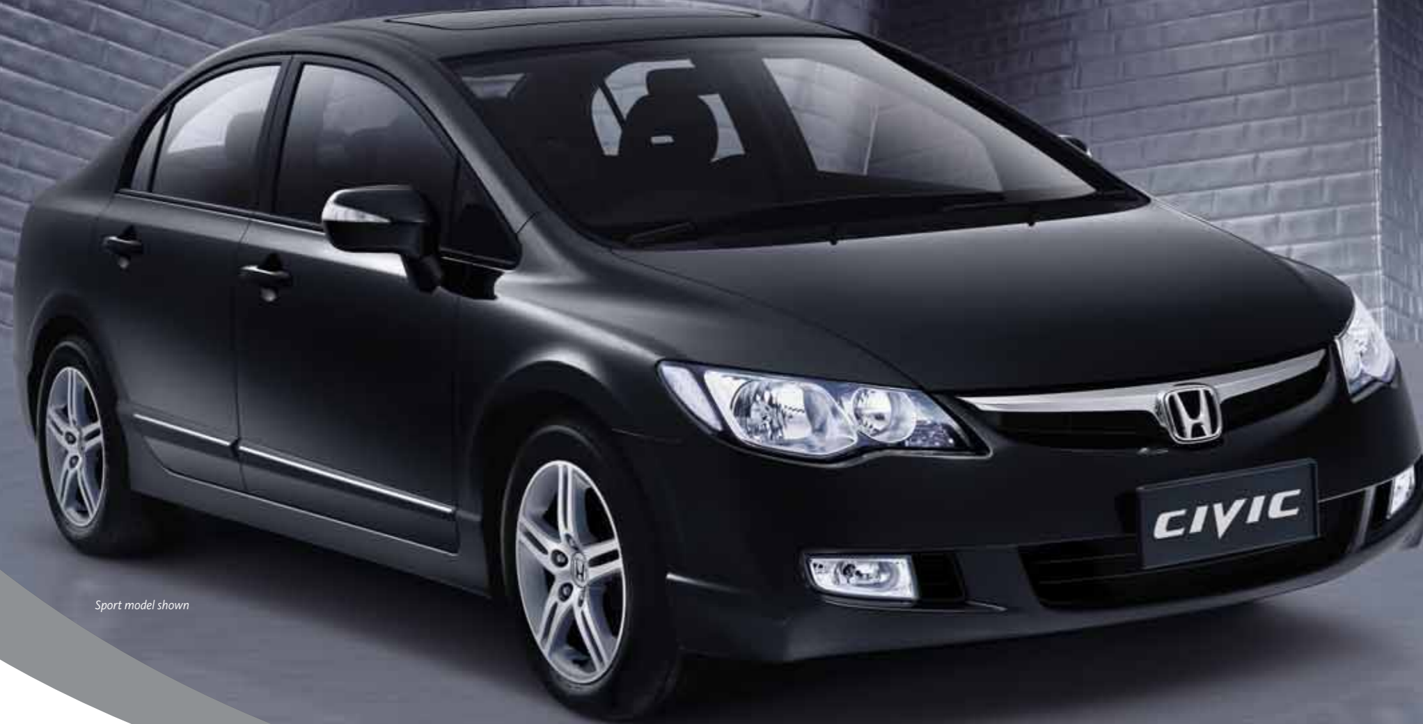
Sport model shown