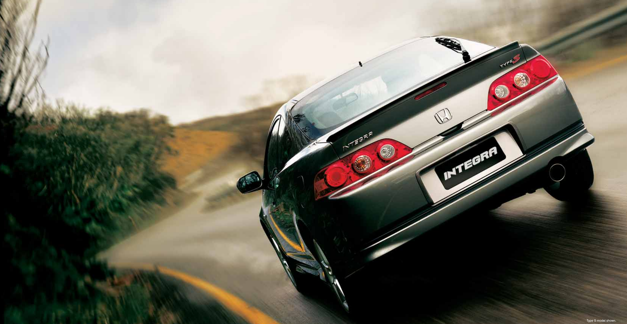
Type S model shown.