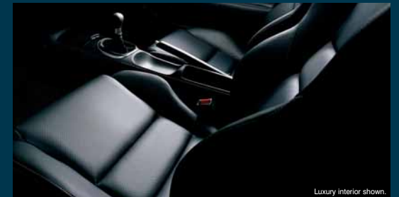
Luxury interior shown.

which allows for quick and easy shifts. In this way, economy of driver movement matches the efficiency of the i-VTEC engine. Or for even more convenience, there's the option of an advanced 5-speed sequential shift automatic transmission. Inspired by transmissions used in F1 racecars, it lets you upshift and downshift at the flick of the wrist. This provides the control and enjoyment of a manual, minus the clutch. In fully automatic mode it delivers crisp, clean shifting and uses Grade Logic Control to avoid gear hunting on up-hills and down-hills.