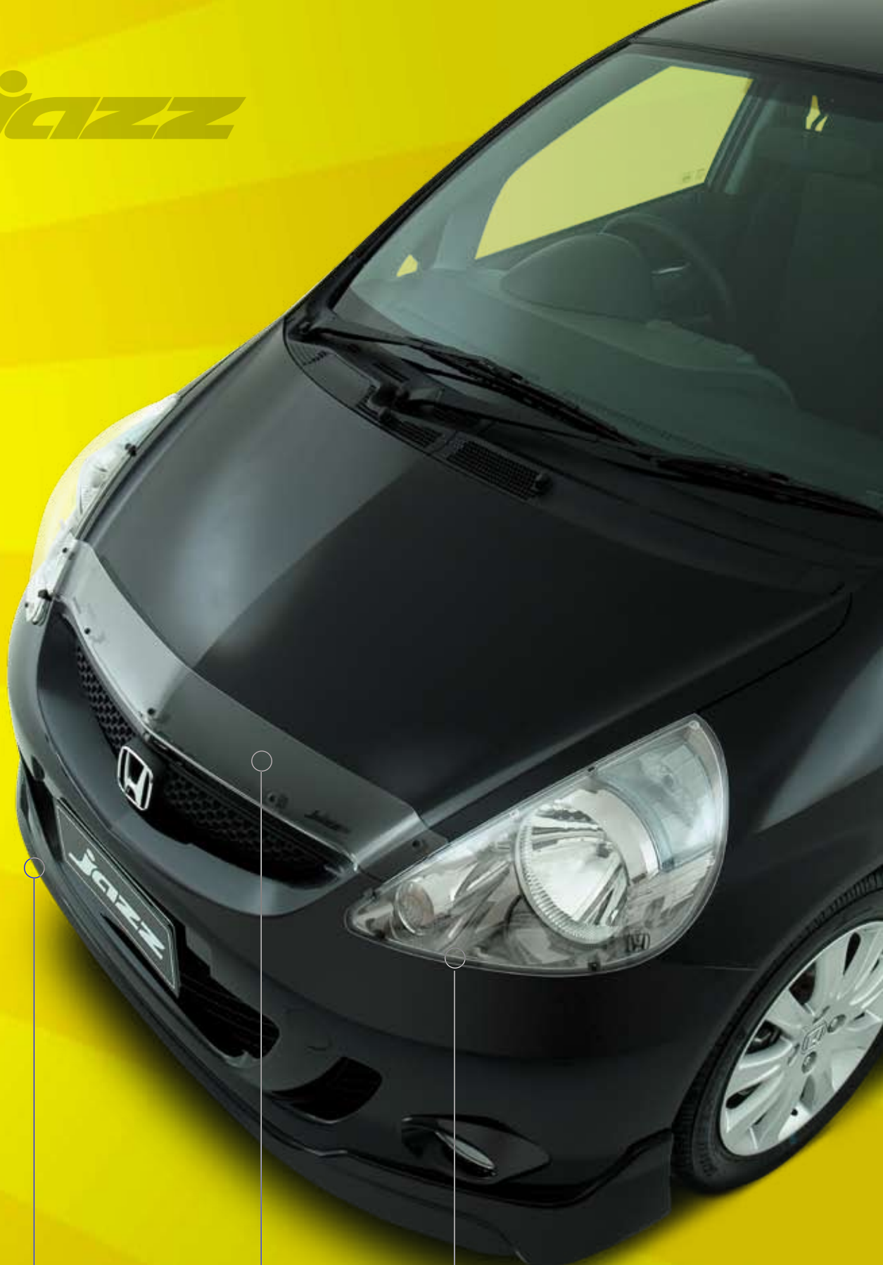
Front under spoiler