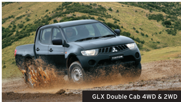
GLX Double Cab 4WD & 2WD