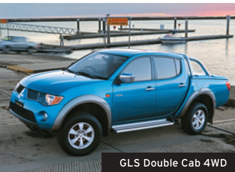
GLS Double Cab 4WD