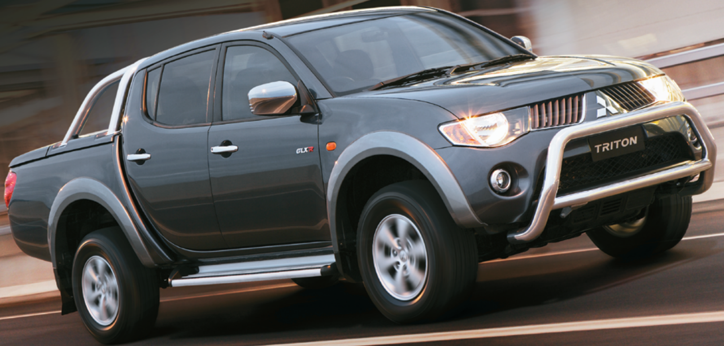
GLX-R Double Cab 4WD