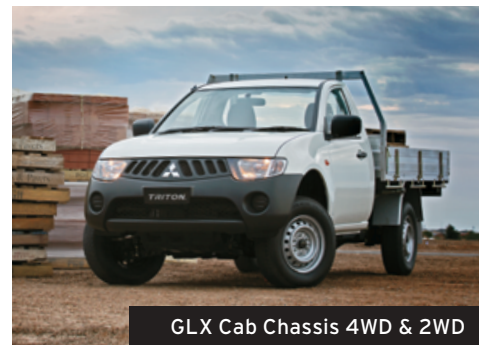
GLX Cab Chassis 4WD & 2WD