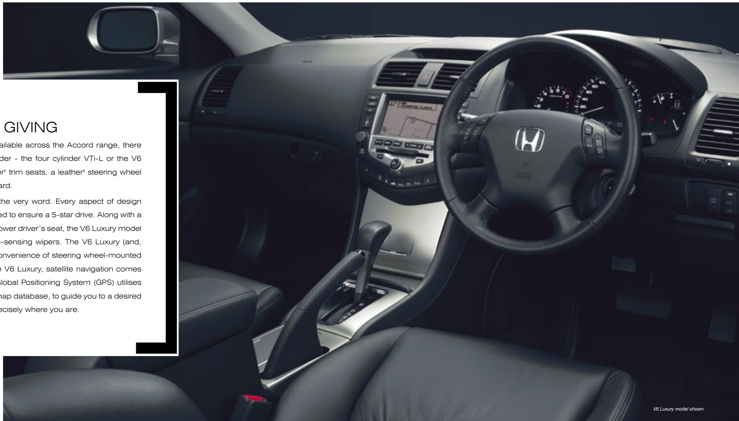
V6 Luxury model shown.

Of course, the V6 Luxury redefines the very word. Every aspect of design has been considered and reconsidered to ensure a 5-star drive. Along with a plush leather† interior and an 8-way power driver's seat, the V6 Luxury model includes an electric sunroof and rain-sensing wipers. The V6 Luxury (and, incidentally, the V6) has the added convenience of steering wheel-mounted audio controls. And amazingly, in the V6 Luxury, satellite navigation comes standard. This highly sophisticated Global Positioning System (GPS) utilises 24 satellites orbiting the Earth and a map database, to guide you to a desired destination. So you'll always know precisely where you are.