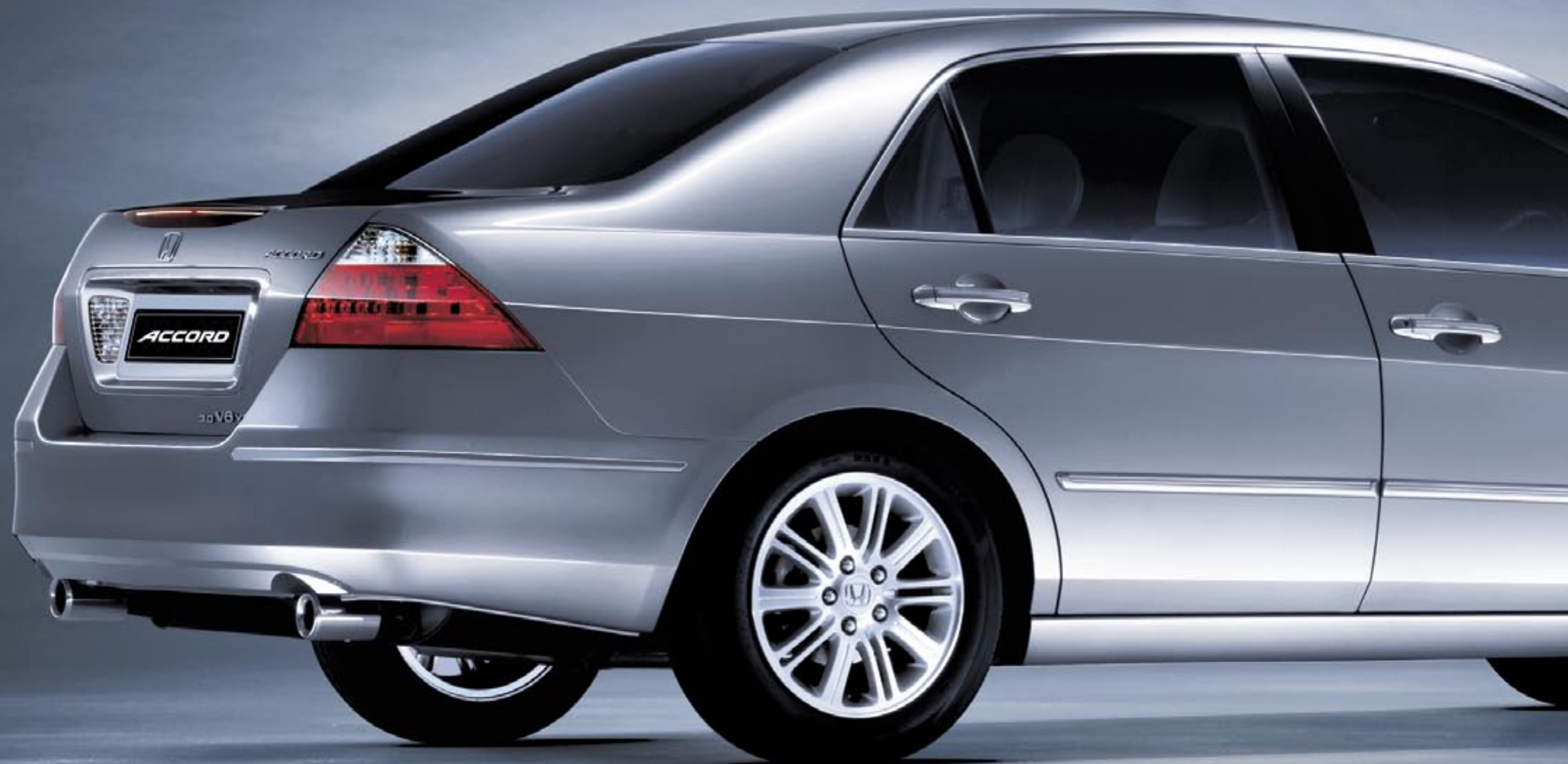
V6 Luxury model shown.