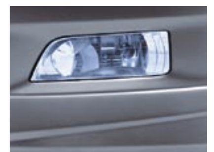
Fog lights (standard on V6 Luxury).