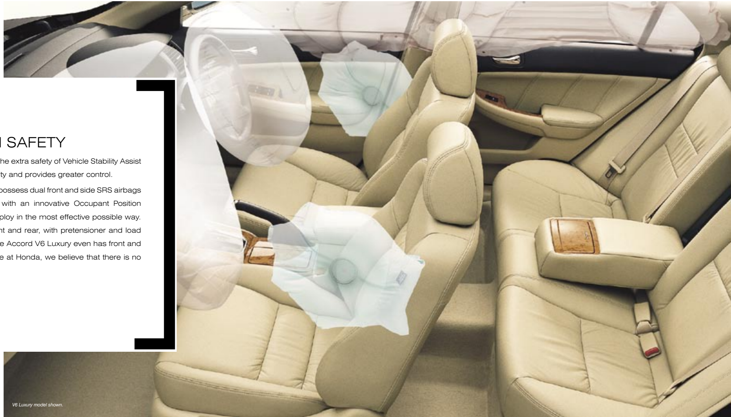
V6 Luxury model shown.

And to top it all off, all Accord models possess dual front and side SRS airbags for the driver and front passenger with an innovative Occupant Position Detection System, to ensure they deploy in the most effective possible way. 3-point seatbelts are provided in front and rear, with pretensioner and load limiter systems for the front seats. The Accord V6 Luxury even has front and rear SRS curtain airbags. All because at Honda, we believe that there is no greater luxury than safety.