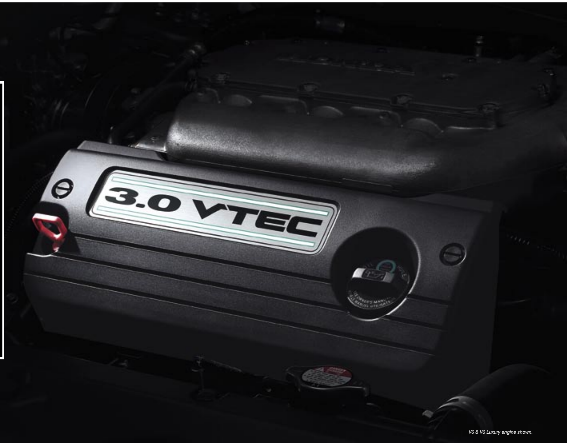
V6 & V6 Luxury engine shown.

The VTi models aren't the only Accord models to benefit from Honda's advanced VTEC technology. The Accord V6 and V6 Luxury both boast a powerful 3.0 litre SOHC V6 VTEC engine, equipped with a drive by wire throttle. This superbly crafted machine produces a very sporty 177 kW of power, and an outstanding 287 Nm of torque. The clever V6 engine manages to produce all that power while remaining amazingly fuel efficient.