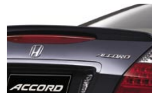
Rear boot spoiler - duck tail type.