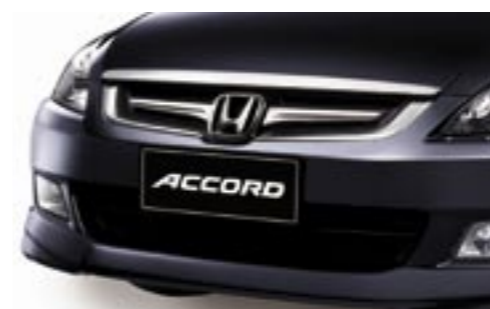
Front under spoiler.