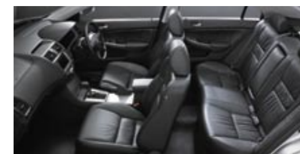
V6 Luxury model shown.