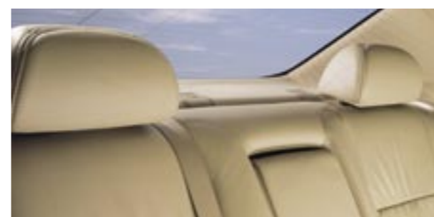
V6 Luxury model shown.

† Leather interior includes some PVC vinyl material.