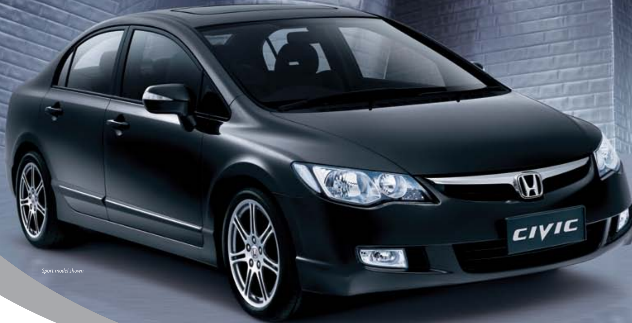
Sport model shown