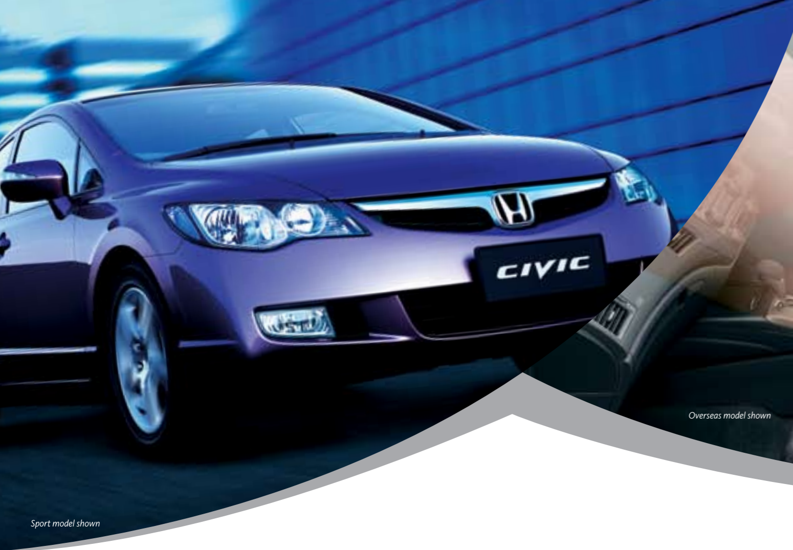
Sport model shown