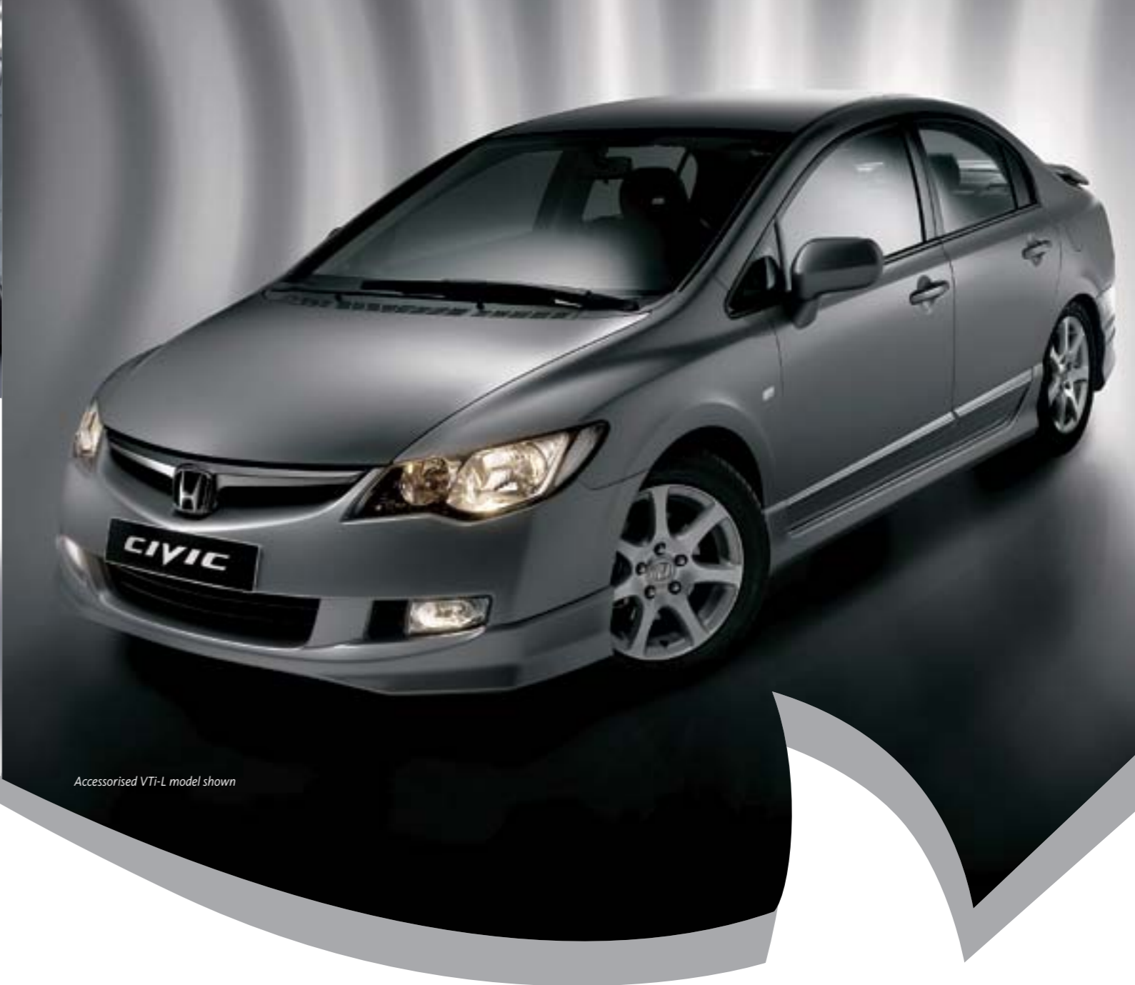
Accessorised VTI-L model shown