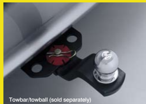
Towbar/towball (sold separately)