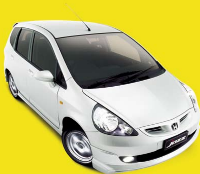
GLi model shown

Your Honda Dealer can help you select the accessories for your Jazz and have them installed at the time of purchase. They'll then be fully covered by the 3-year, 100,000 kilometre new car warranty.