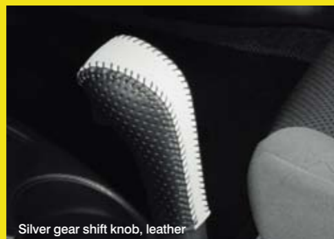
Silver gear shift knob, leather