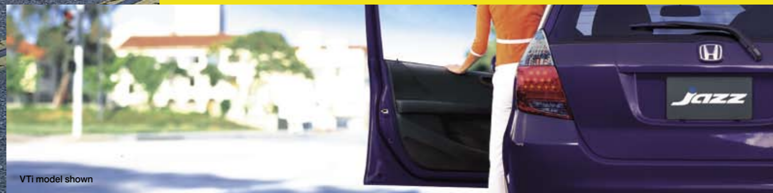
VTi model shown

This includes a 3-year surface corrosion warranty and a 6-year rust perforation warranty for your absolute peace of mind. As you can see, Honda is committed to your car long after the sale. That's why our alliance with every Honda Dealership is so important to us and invaluable to you throughout your ownership.