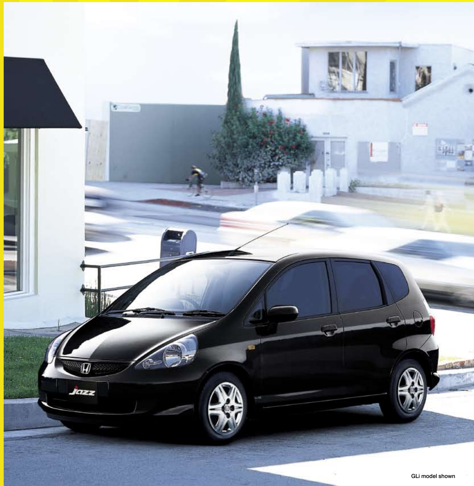
GLi model shown