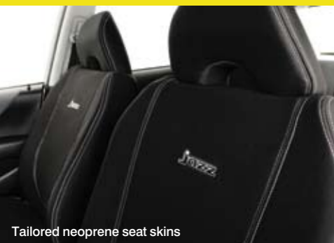
Tailored neoprene seat skins