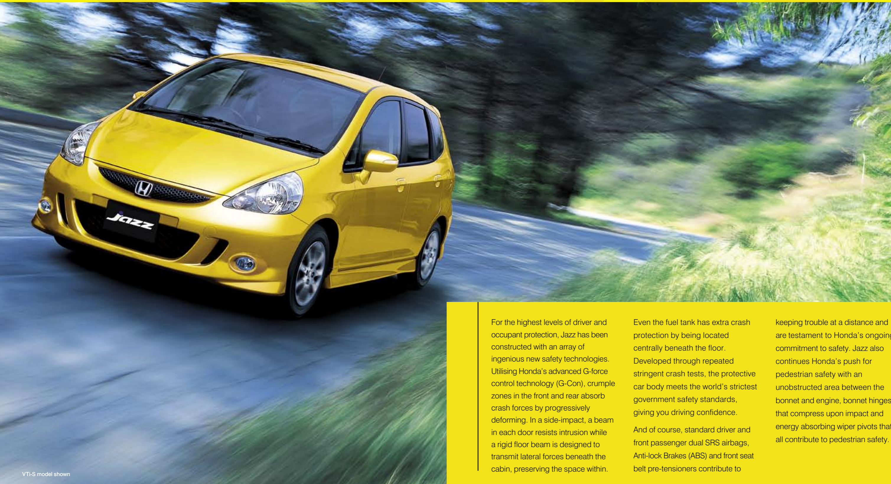
VTI-S model shown

For the highest levels of driver and occupant protection, Jazz has been constructed with an array of ingenious new safety technologies. Utilising Honda's advanced G-force control technology (G-Con), crumple zones in the front and rear absorb crash forces by progressively deforming. In a side-impact, a beam in each door resists intrusion while a rigid floor beam is designed to transmit lateral forces beneath the cabin, preserving the space within.