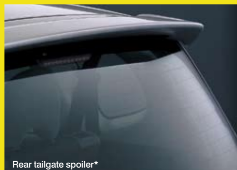
Rear tailgate spoiler*