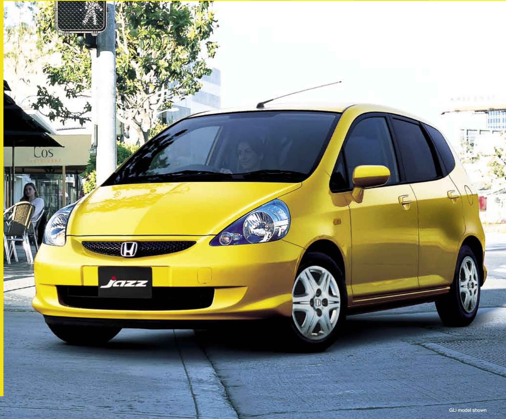
GLi model shown

Jazz's user-friendly cabin puts you in total control. Whether you're changing radio stations or operating the power windows and mirrors, you'll find everything is within arm's reach. Controls are firm to the touch and every surface has a solid, quality feel. And because a comfortable, relaxing interior creates a better driving experience, the Jazz is designed to be supremely quiet.