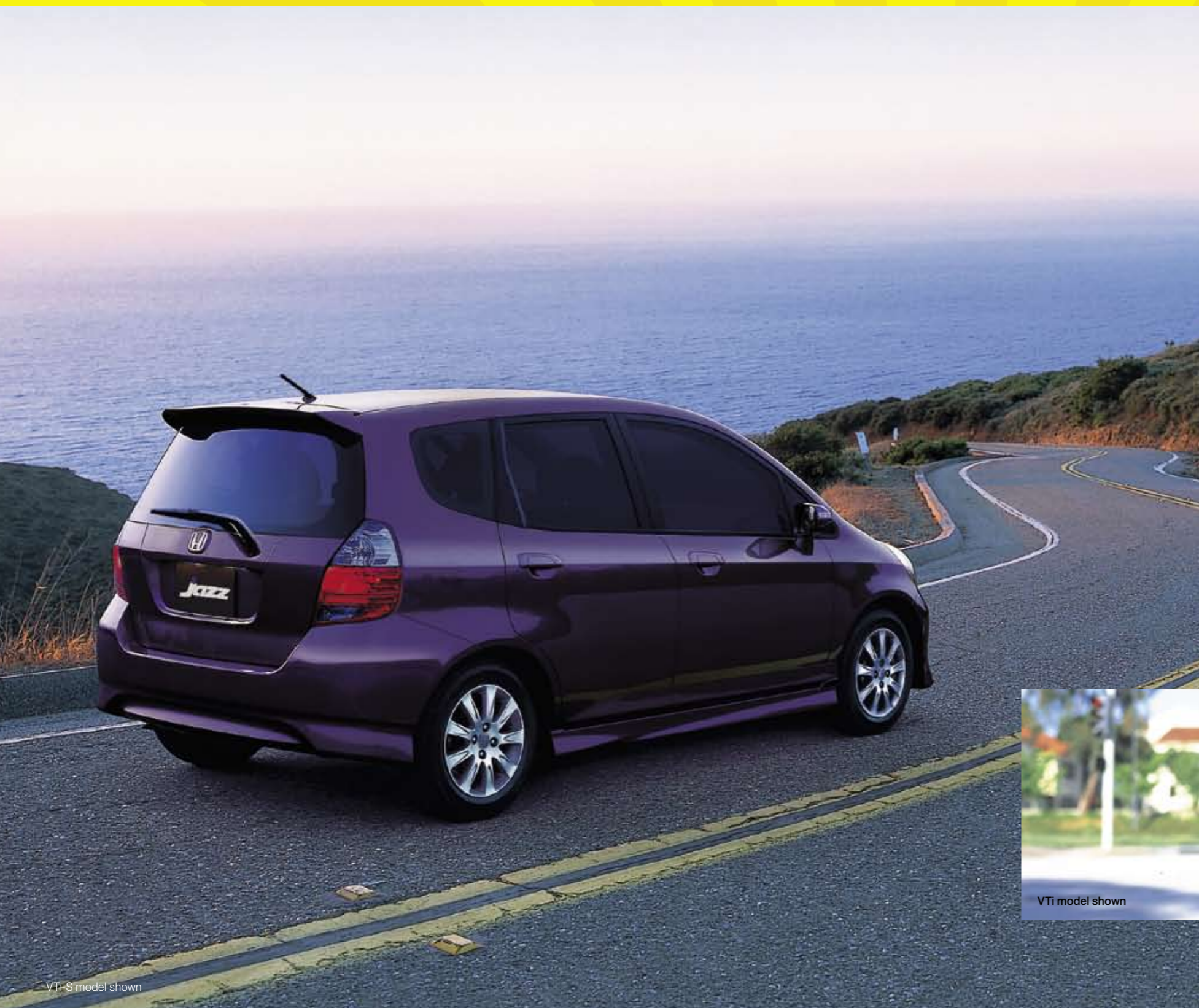
VTi-S model shown

The world's finest cars: the world's finest after sales service. The pride you'll feel in your new Jazz is one we feel as well. That's why we take just as much care building our Dealer network as we do building our cars.