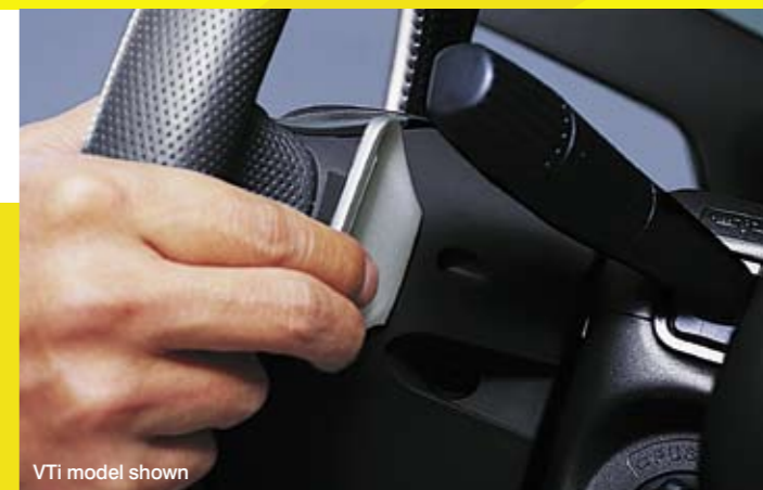
VTi model shown

Wherever you go in the Jazz, you're assured of superb performance, handling and stability – and the choice of two exciting engines. Press the accelerator and the GLi's four cylinder, fuel injected 1.3 L i-DSI (intelligent Dual and Sequential Ignition) engine responds with a surge of power. This engine generates 61 kW of power at 5700 rpm and maximum torque of 119 Nm at only 2800 rpm, which is great for city and highway driving.