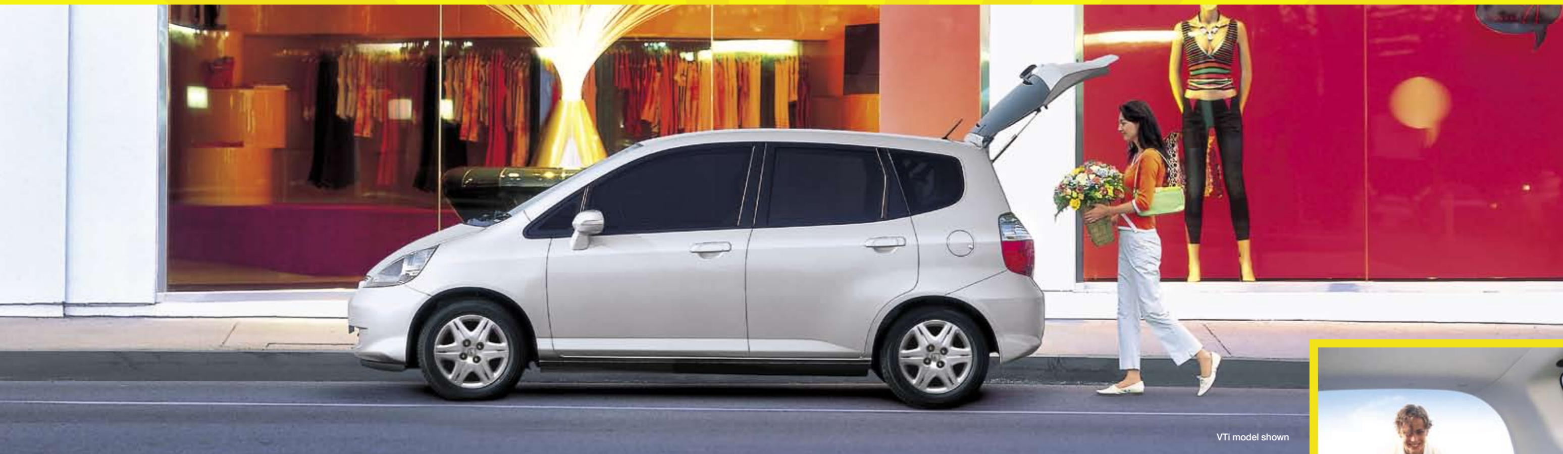
VTi model shown

When it comes to getting things moving, you can fit almost anything in a Jazz. With its revolutionary 'Magic Seat' system, you can open up a huge range of loading possibilities in seconds. With three seat configurations to choose from (utility, tall and long mode), a simple fold of a seat will see you transporting mountain bikes, suitcases or other bulky items in no time.