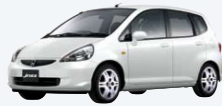
Alabaster Silver Metallic†