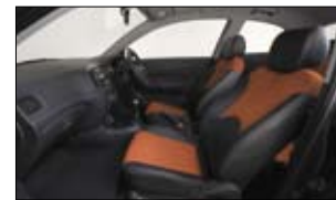
Sports black leather bolster seats with orange cloth inserts (Blue Onyx comes with grey cloth inserts)