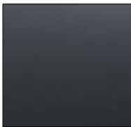
Midnight Grey (pearl)