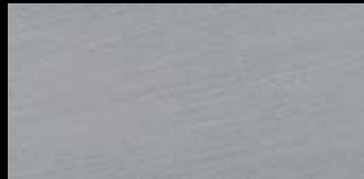
Matt brushed aluminium (standard inlay with Audi exclusive line)