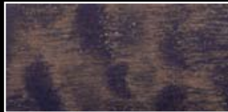
Tamo ash dark brown (available as an additional option for Audi exclusive line)