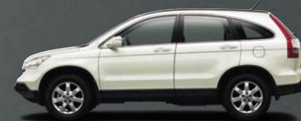
Taffeta White Interior trim: Ivory