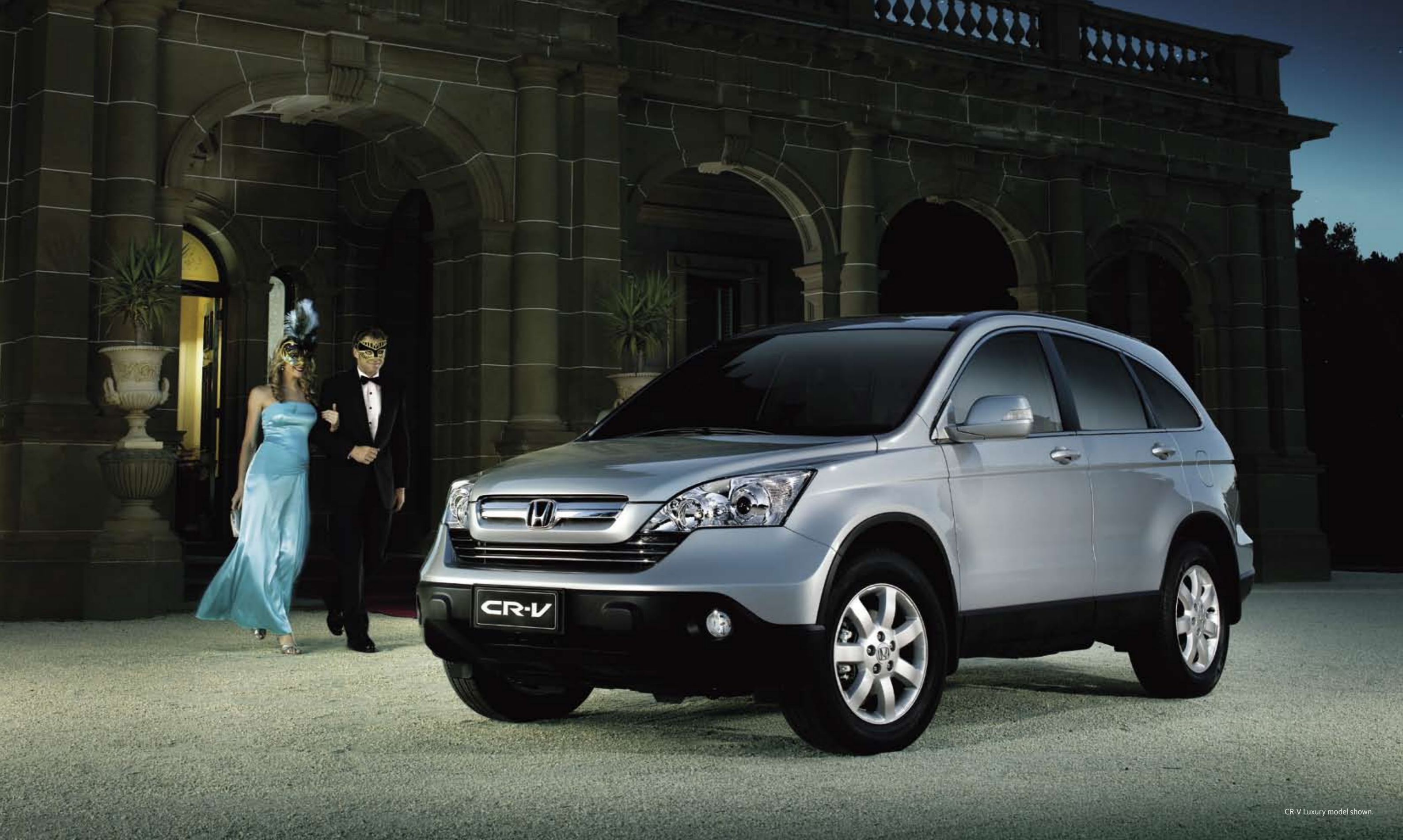
CR-V Luxury model shown.