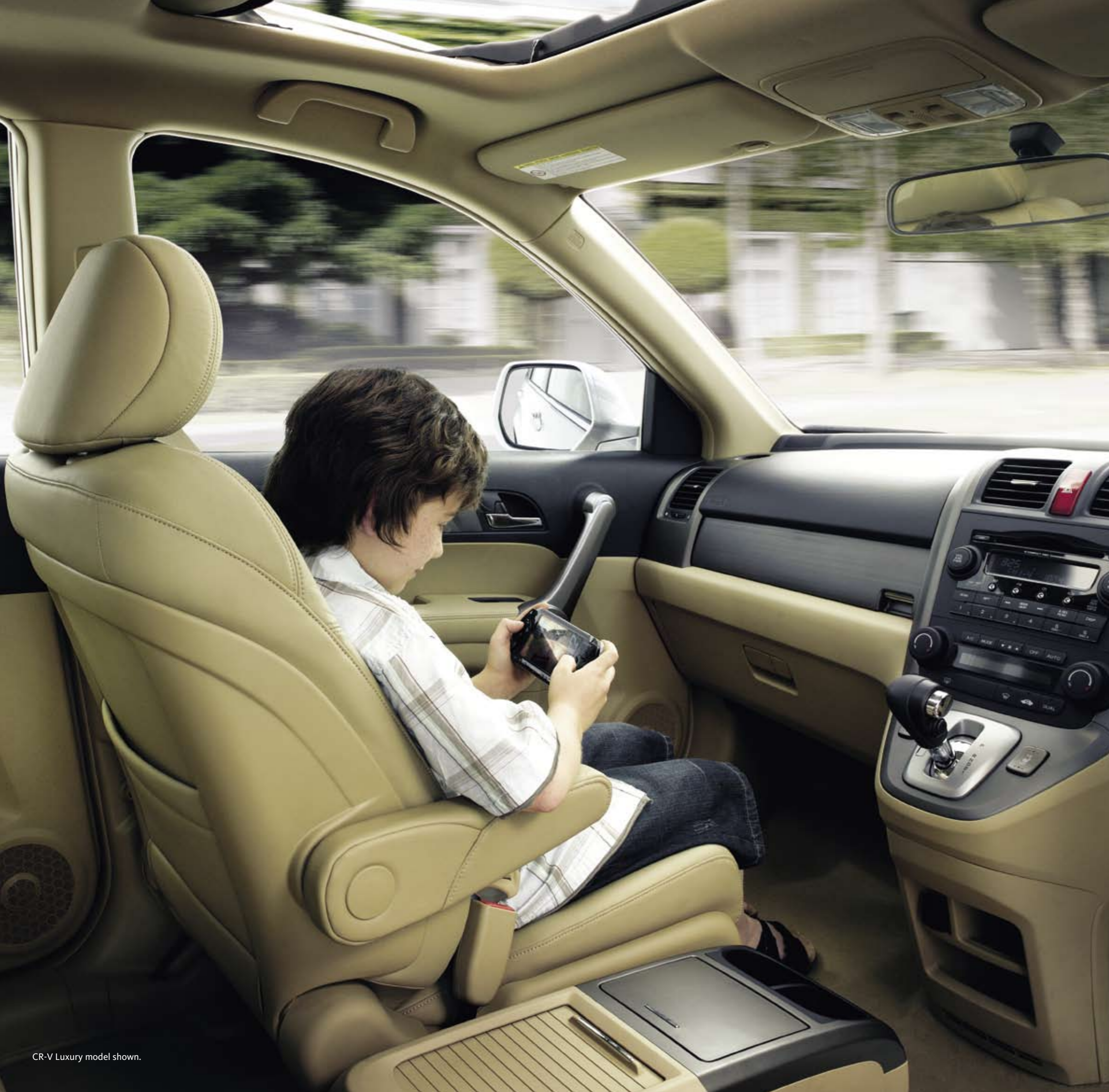
CR-V Luxury model shown.