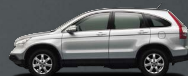
Alabaster Silver Metallic* Interior trim: Black