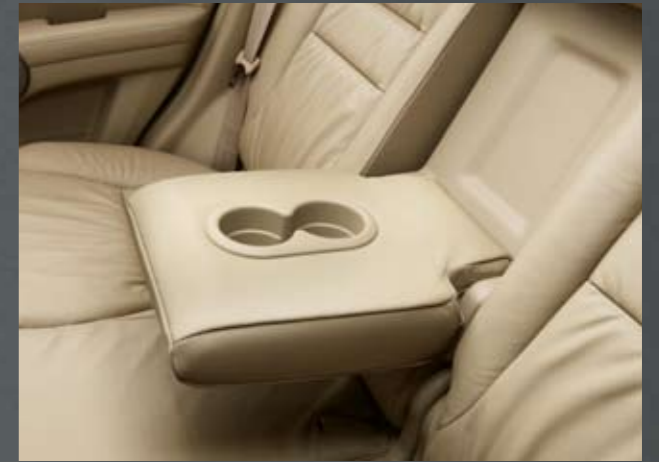
CR-V Luxury model shown.