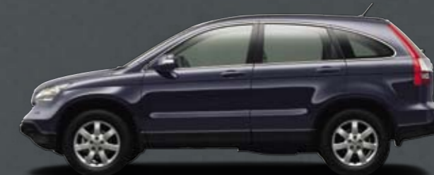
Sparkle Grey Pearl* Interior trim: Black