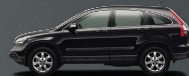
Nighthawk Black Pearl* Interior trim: Black or Ivory