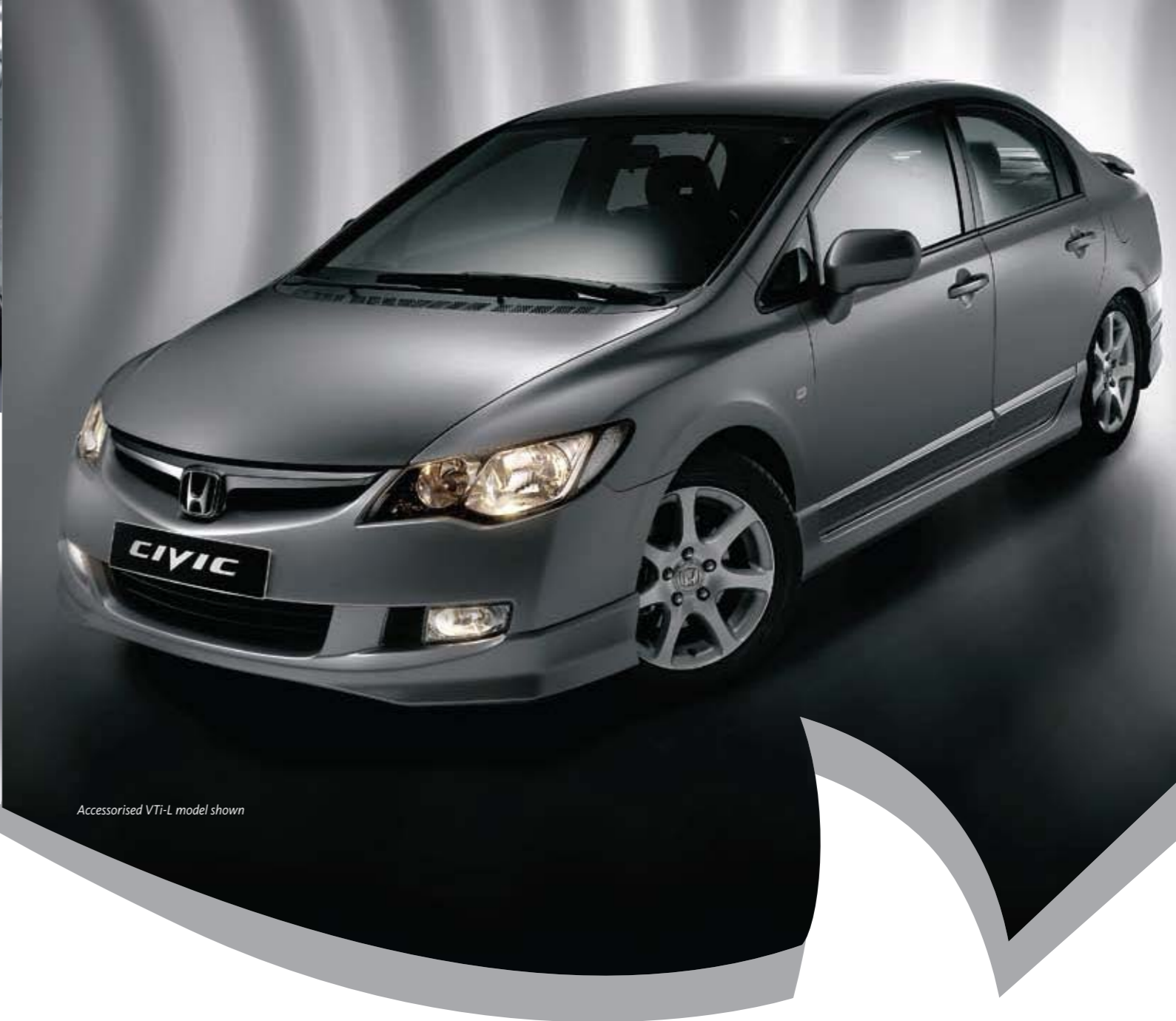
Accessorised VTI-L model shown