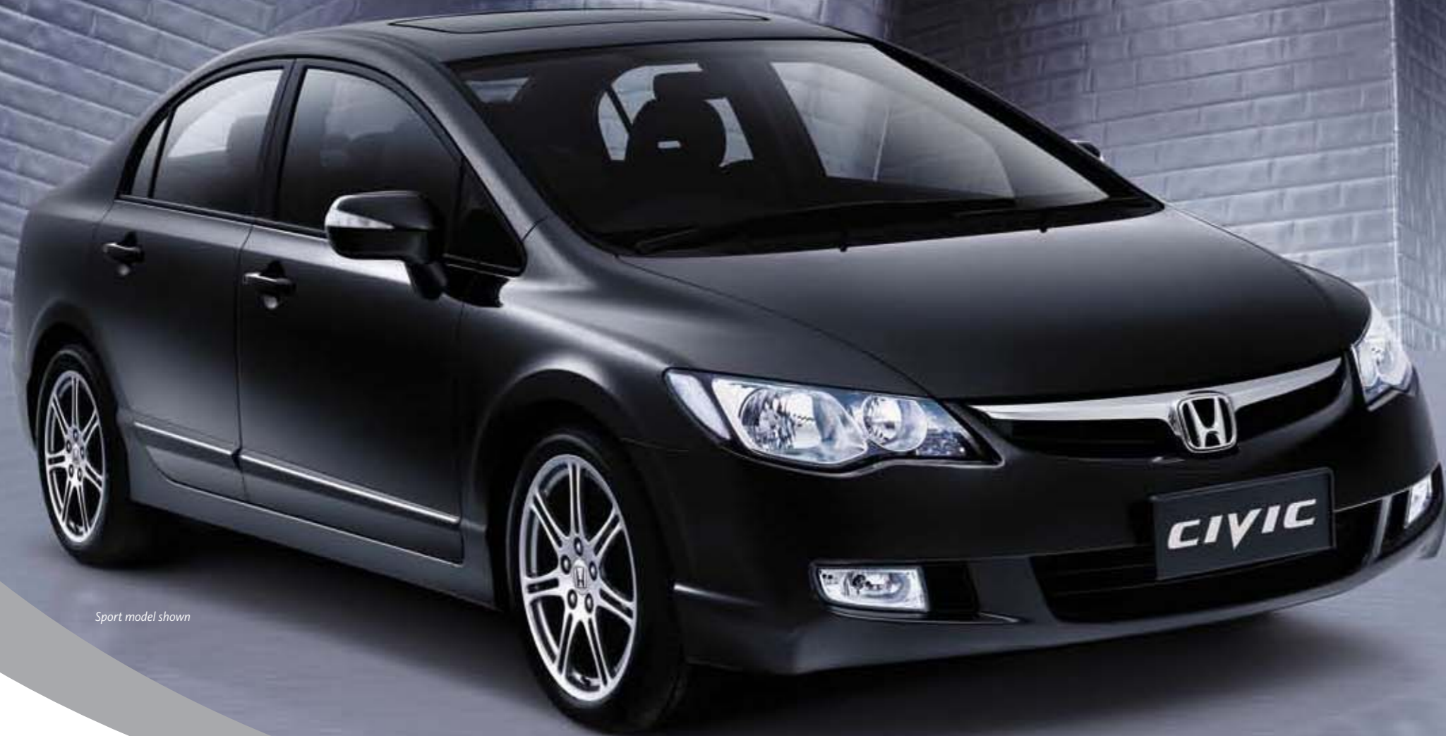
Sport model shown