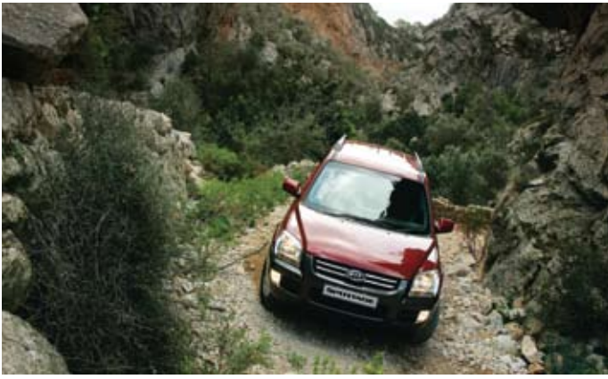
Sportage EX V6