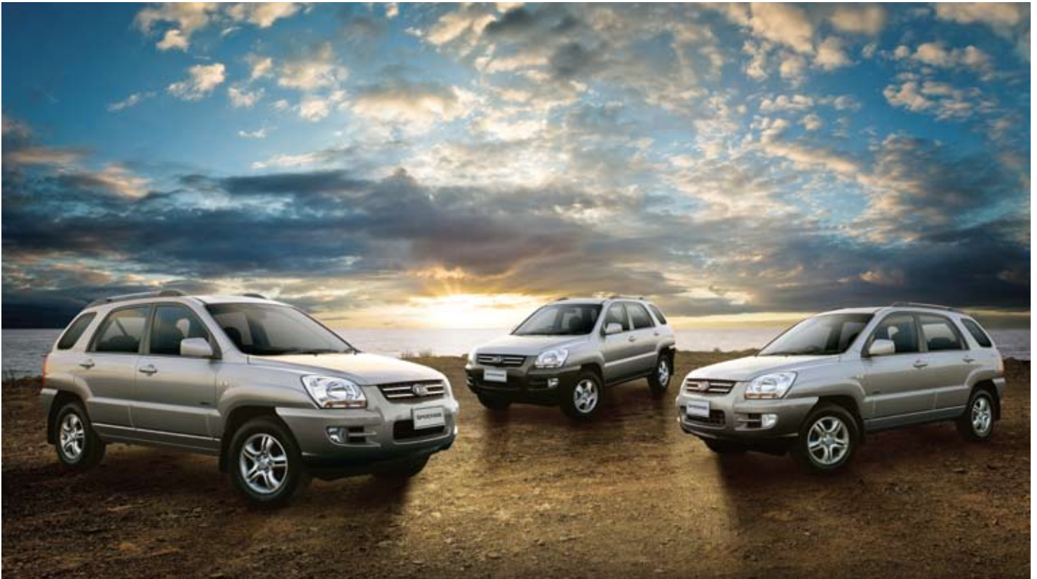
L to R: Sportage EX V6, Sportage LX, Sportage EX CRDi.

Our commitment to global research and development includes state-of-the-art centres in Germany, Japan and the United States. As a result every Kia Sportage embodies some of the smartest automotive thinking in the world, and the kind of features you simply don't expect to come as standard. It's this dedication to surprising people that has made Kia the fastest growing car company in Europe, and the brand to watch in the 160 countries in which our cars are sold.