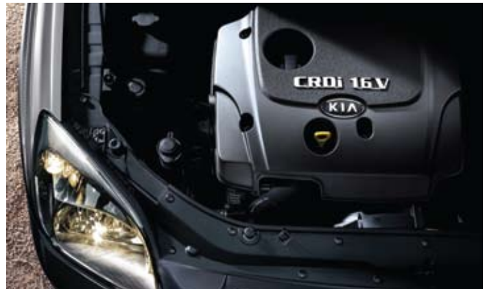
The CRDi engine includes a particulate filter in its exhaust system to produce cleaner emissions.